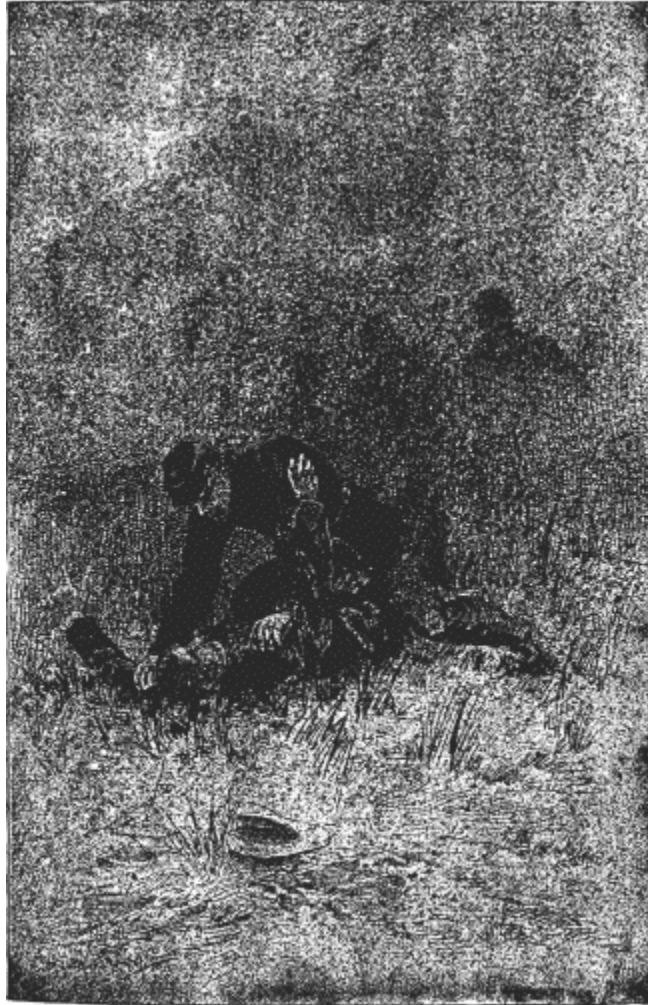
"A TREMENDOUS STRUGGLE FOLLOWED."--Page 284.

Flint had remained in the canoe, which had been partly drawn up on the beach; but the moment he sprang out upon the sand to go to the assistance of his officer, he was set upon by two men and secured. Both of them were deprived of their weapons, and their hands tied behind them. Beyond a doubt the lieutenant and the master's mate were prisoners before they had any clear idea of the situation.