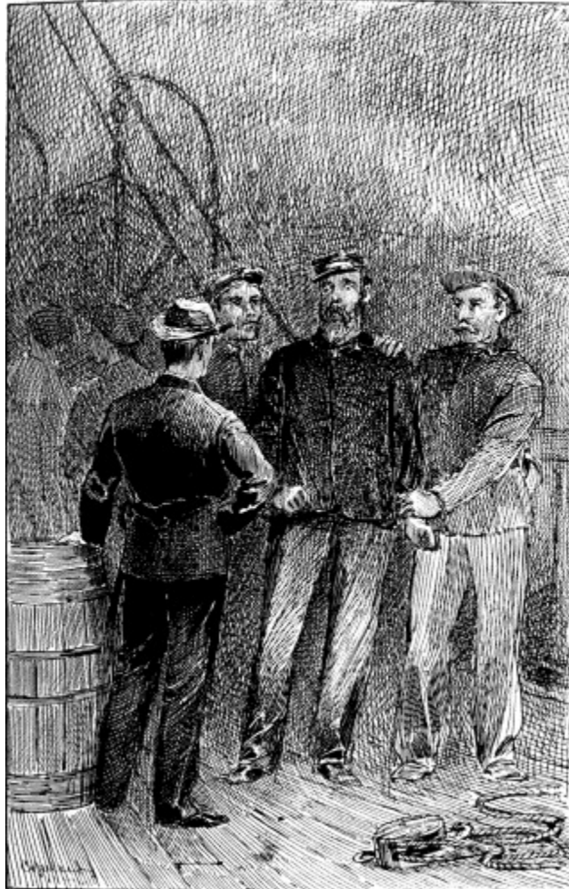
"HE PLACED ONE OF HIS MEN ON EACH SIDE OF THE CAPTAIN."--Page 233.

"I shall not make any trouble about the screw, Captain Folkner, for I don't think we shall have any difficulty about it. But I believe we had better not hoist it any higher out of water," added Christy. "I mean that I think we had better go out of the bay by the main channel."