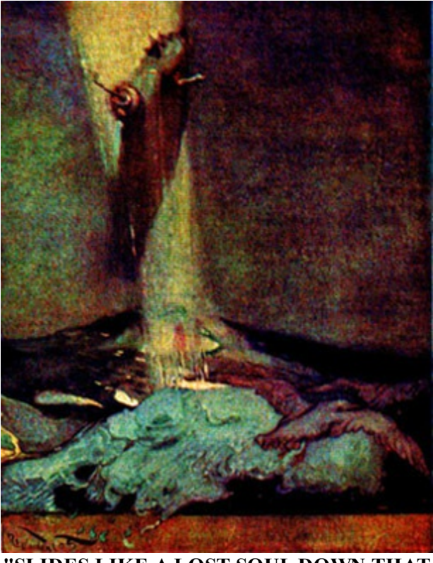
"SLIDES LIKE A LOST SOUL DOWN THAT PITILESS LADDER OF LIGHT, AND THE ATLANTIC TAKES HER"

Captain Hodgson opens the underbody colloid, swings the heavy pithing-iron out of its rack which in liners is generally cased as a settee, and at two hundred feet releases the catch. We hear the whir of the crescent-shaped arms opening as they descend. The derelict's forehead is punched in, starred across, and rent diagonally. She falls stern first, our beam upon her; slides like a lost soul down that pitiless ladder of light, and the Atlantic takes her.