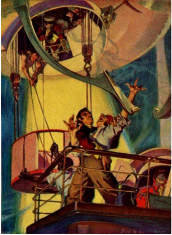
"A MAN WITH A GHASTLY SCARLET HEAD FOLLOWS, SHOUTING THAT HE MUST GO BACK AND BUILD UP HIS RAY."