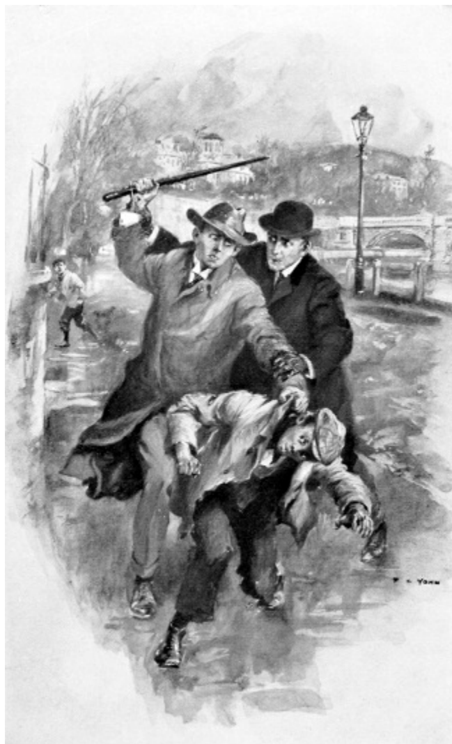
A heavy blackthorn held in murderous poise.

At that unlucky moment, one small suburban Arab, in full flight from another, dashed round the corner and butted into that part of Delavoye which the Egyptian climate had specially demoralised. I saw his dark face writhe with pain and fury. With one hand he caught the offending urchin, and in the other I was horrified to see his stick, a heavy blackthorn, held in murderous poise against the leaden sky, while the child was thrust out at arm's length to receive the blow. I hurled myself between them, and had such difficulty in wresting the blackthorn from the madman's grasp that his hand was bleeding, and something had tinkled on the pavement, when I tore it from him.