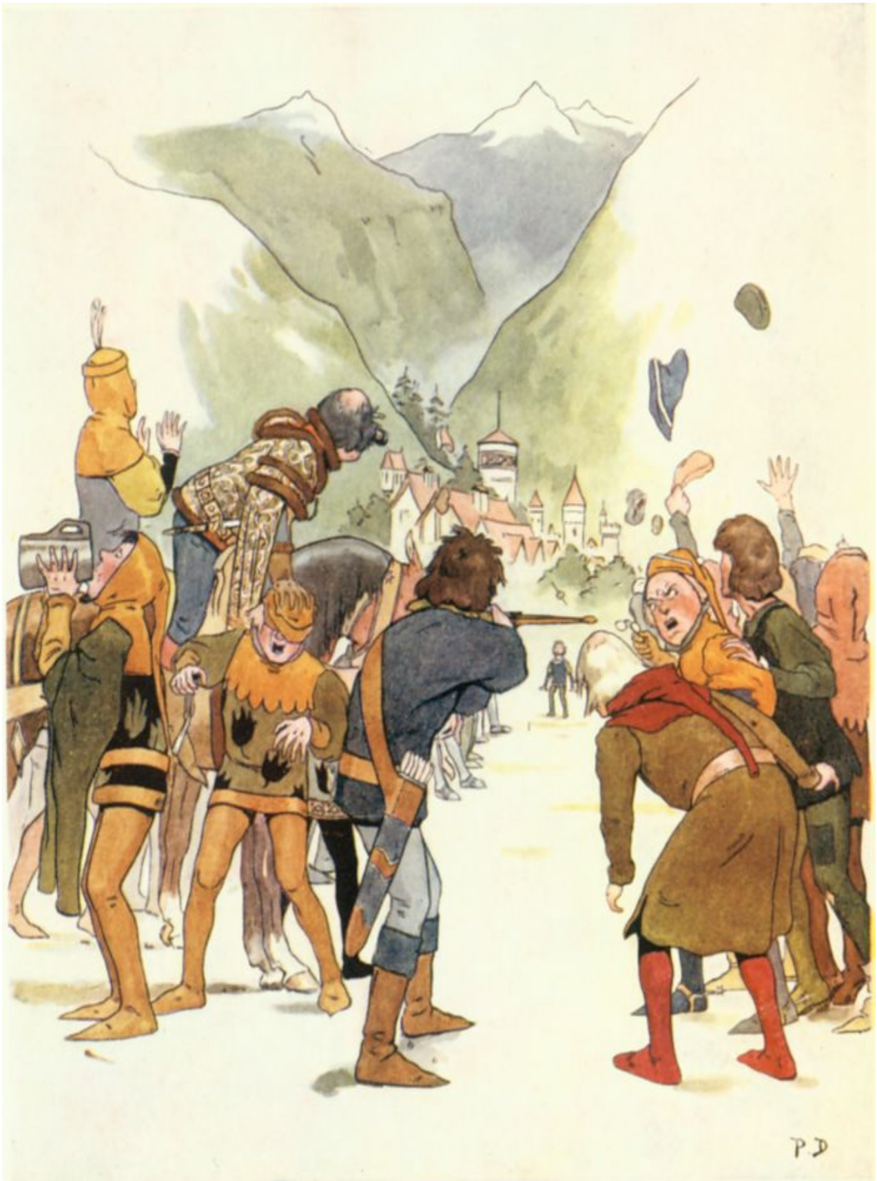
The apple had leaped from Walter's head, pierced through the centre.