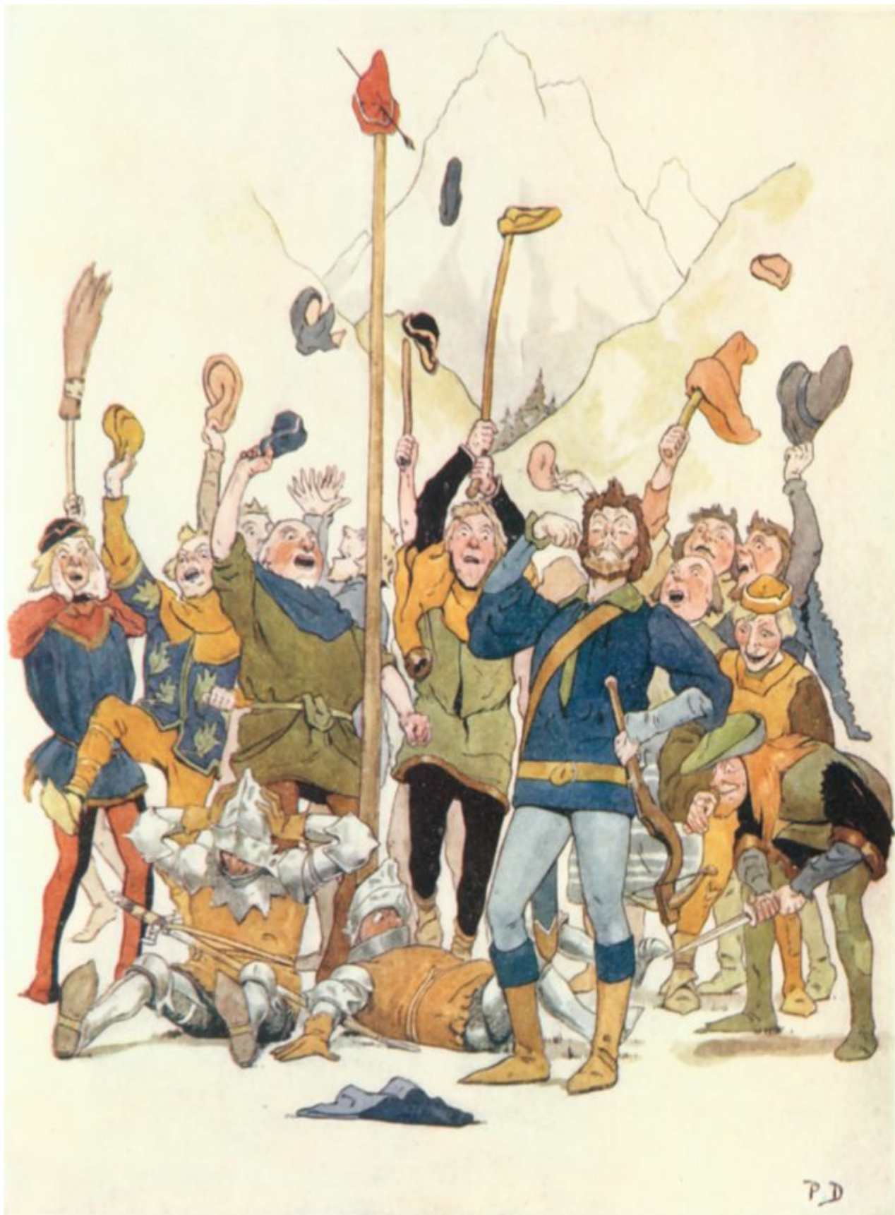
"A mere trifle," said Tell modestly. The crowd cheered again and again.