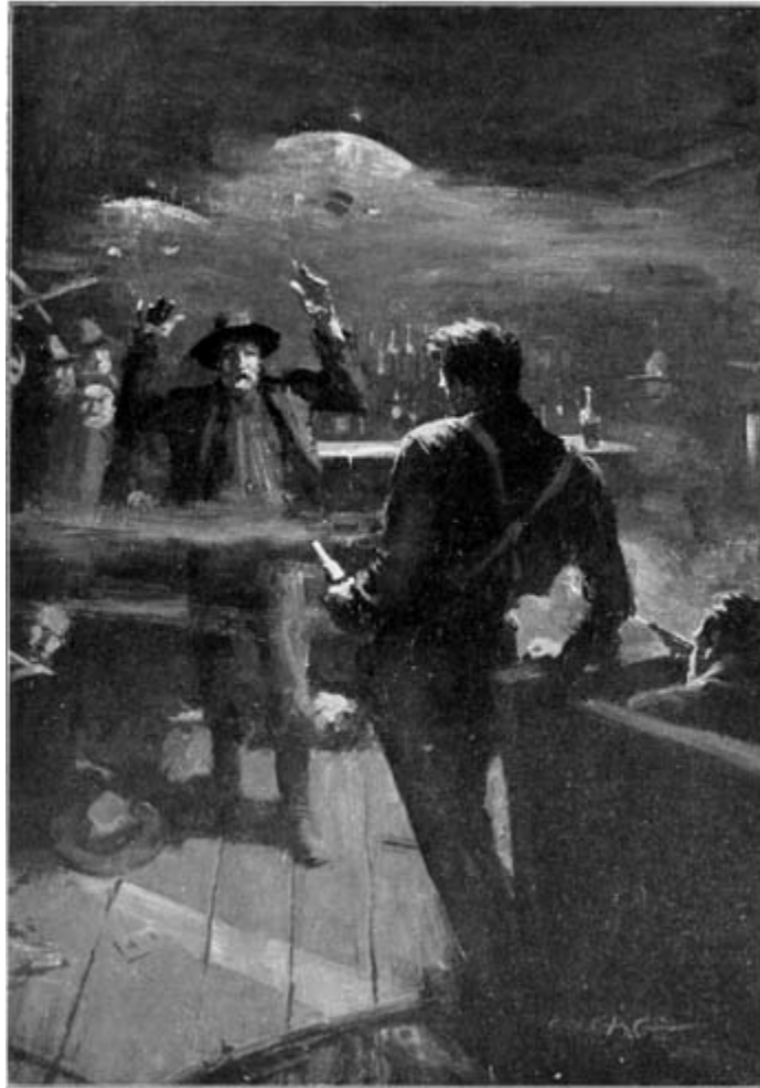
Then giving back step by step, Bear Cat edged to the corner of the table

Pulling himself painfully up by the table's edge with his one sound arm, Jerry made a panting and final effort, but, as he struggled, part of his body became exposed and that was the signal for several desultory shots. He fell back again, bleeding at the mouth, and the spot where he collapsed was reddened with the flow from his wounds.