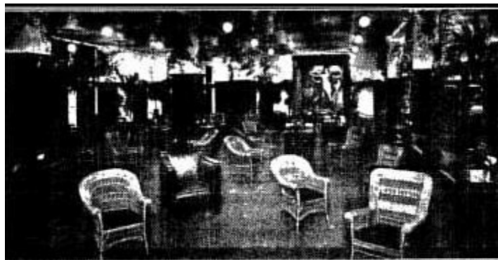
A DEPARTMENT STORE REST-ROOM FOR WOMEN

This luxurious apartment in Gimbel Brothers' New York store shows the lavishness with which the great department stores seek the comfort of their customers.