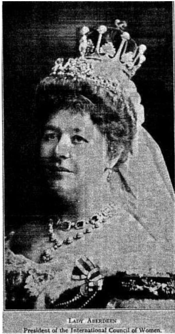
LADY ABERDEEN President of the International Council of Women.

The International Council of Women discusses every important question presented, but makes no decision until the opinion of the delegates is practically unanimous. It commits itself to no opinion, lends itself to no movement, until the movement has passed the controversial stage.