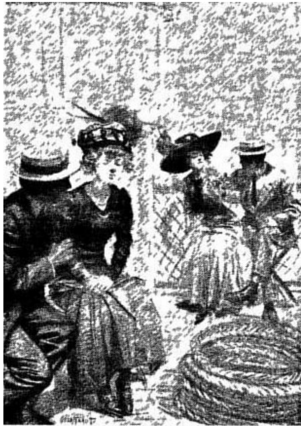
ANOTHER SERIOUS CONTRIBUTION TO THE SOCIAL QUESTION The servant girl has to seek relaxation in the promiscuous and dissipating society of the excursion boat, she has nowhere else to go.

Tolstoy's terrible story "Resurrection" has for its central anecdote in the opening chapter a court-room scene in which a judge is called upon to sentence to prison a woman for whose downfall he had, years before, been responsible. A somewhat similar story in real life, with a happier ending, was told me by the head of a woman's reformatory. This official received a visit from a lawyer, who told her with much emotion that he had, several days before, been present when a young girl was sentenced to a term in a reformatory.