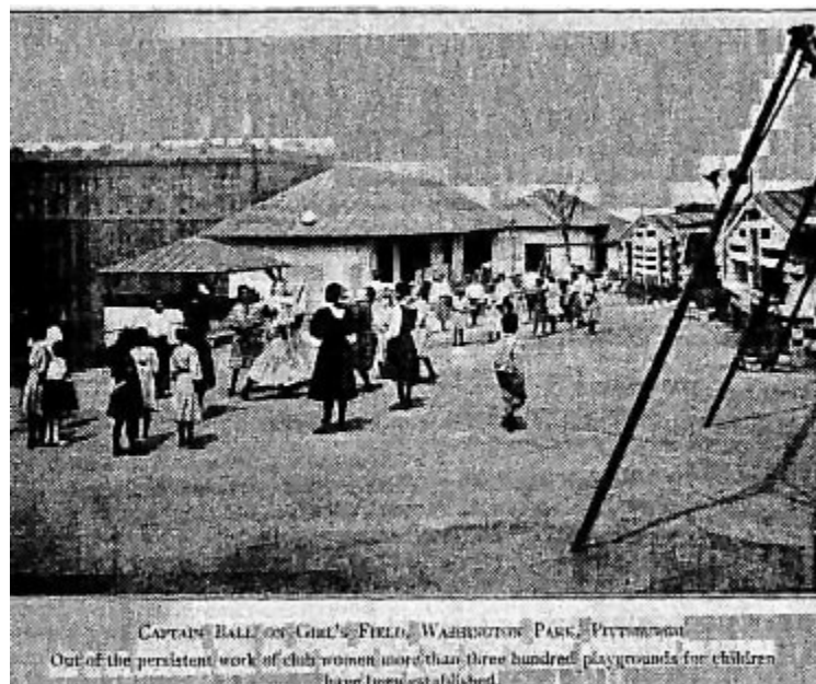
CAPTAIN BALL ON GIRL'S FIELD, WASHINGTON PARK, PITTSBURGH Out of the persistent work of club women more than three hundred playgrounds for children have been established.

If the Germanic alderman who protested that "vimmins" did not know anything about boys' play was in office at the time, one wonders what his emotions were when the playgrounds committee first appeared before the Council and asked to have vacant lots flooded to give children skating ponds in winter. Of course the Council refused. Fire plugs were for water in case of fire, not for children's enjoyment. In fact there was a city ordinance forbidding the opening of a fire plug in winter, except to extinguish fire. It took two years of constant work on the part of the club women to remove that ordinance, but they did it, and the children of Detroit have their winter as well as their summer playgrounds.