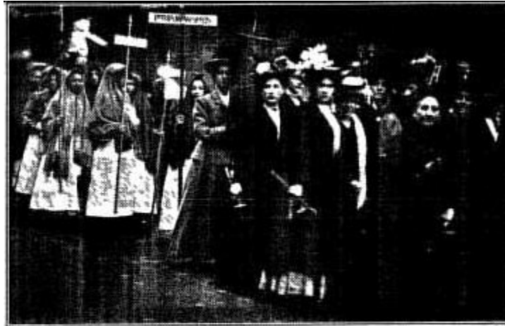
THE WOMEN'S TRADES PROCESSION IN THE AIRSFT HALL, MEETING, APRIL 27, 1909 The Suffrage movement has broken down class lines. In the famous London parade, April 27, 1909, the women, chain makers and the pit-brow workers — the hardest-working women in England — were given the place of honor.

Suffrage Party, a fusion of nearly all the suffrage clubs in the greater city into an association exactly along the lines of a regular political party. At the head of the party as president is Mrs. Carrie Chapman Catt, president of the International Woman Suffrage Association. Each of the five boroughs of the city has a chairman, and each senatorial and assembly district is either organized or is in process of organization.