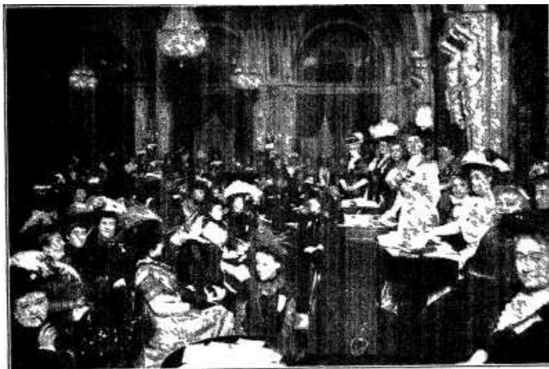
CONVENTION OF CLUB WOMEN AT HOTEL ASTOR, NEW YORK A typical gathering, well-dressed, intelligent, business like.