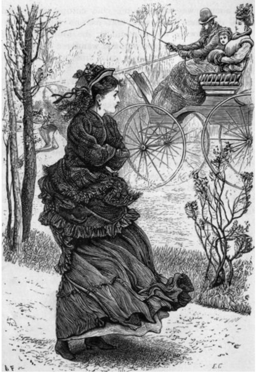
GOING TO THE BAD.

Alas! in just such an enchanted garden of love, and hope, and joy, how often has the ground caved in and let the victim down into dungeons of despair that never open!