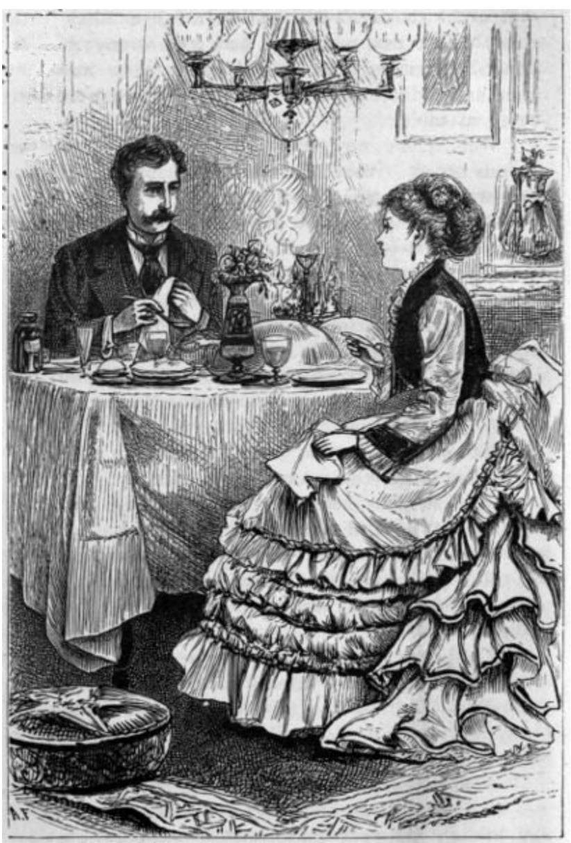
TALKING IT OVER.

Eva went over and over in her own mind her self-justifications--she told herself that she and her aunt were essentially different people, incapable of understanding each other sympathetically or acting in each other's ways, and that the well-meant, positive dicta of her relative were to be let go for what they were worth, and no more.