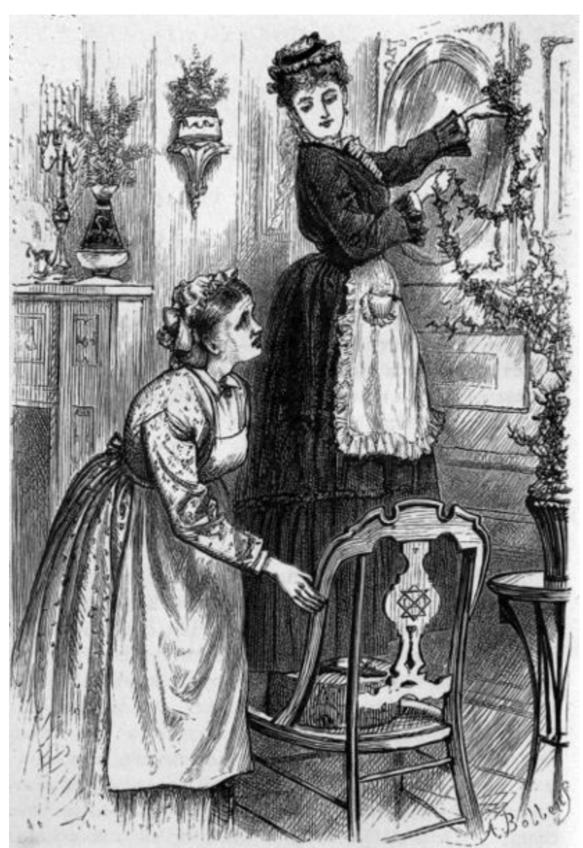
THE DOMESTIC ARTIST

"A spray of ivy that was stretching towards the window had been drawn back, and forced to wreathe itself around a picture."-p. 131.