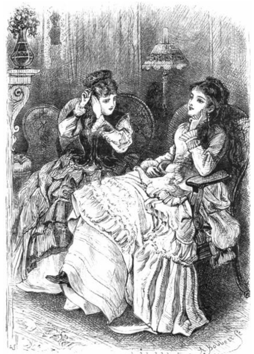
A MIDNIGHT CAUCUS.