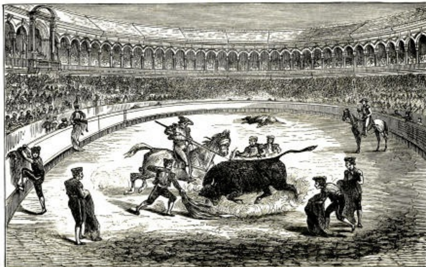
THE BULL-FIGHT AT SEVILLE. Page 406.

For a time he played with the furious beast, which continually plunged at the red banner, the man skilfully stepping aside. At last he seemed to be prepared for the final blow. Holding the banner in his left hand, he permitted the bull to make a dive at it; and, while his head was down, he reached over his horns with the sword, and plunged it in between the shoulder-blades. His aim was sure: he had pierced the heart, and the bull dropped dead. Again the applause shook the arena, and the audience in the lower part of the building hurled their hats and caps into the ring; and a shower of cigars, mingled with an occasional piece of silver, followed the head-gear. The victorious espada picked up the cigars and money, bowing his thanks all the time, while the chulos tossed back the hats and caps.