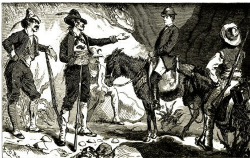
"HE SIMPLY HELD OUT HIS HAND." Page 356.

journey was through a pleasant country, affording them an occasional view of the Guadalquivir.