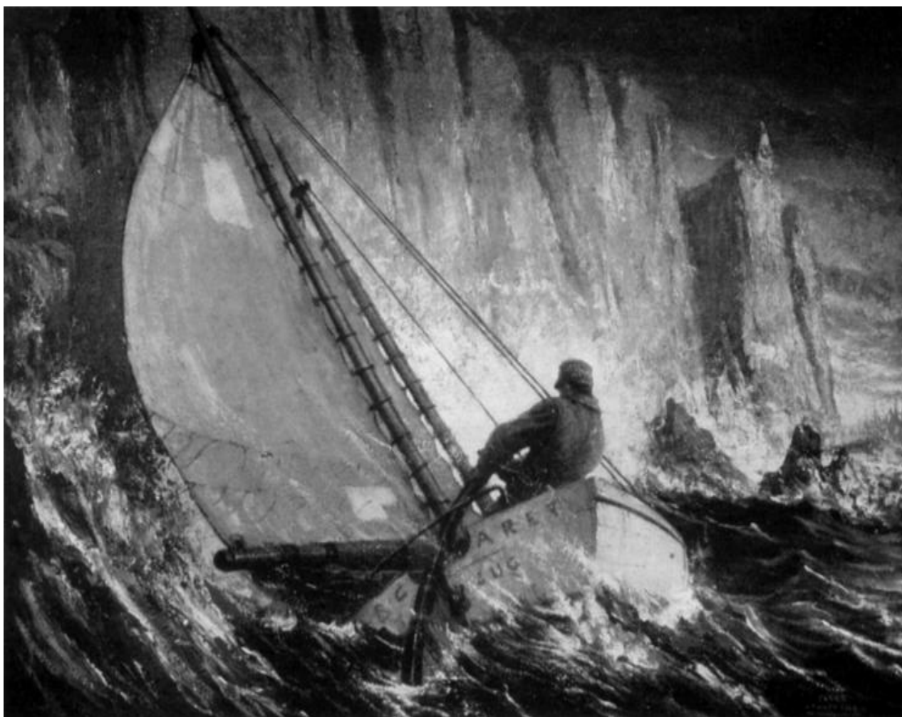
SEETHED THE DEVIL'S TEA KETTLE

The boat was in the passage at last. David, every nerve tense, held her down to it. On the right seethed the Devil's Tea Kettle, sending forth a continuous deafening roar. On the left was Comfort Island with a boom! boom! of thundering breakers smashing against its high, sullen bulwarks of black rocks. The boat was so near that spray from the breakers fell over it in a shower.