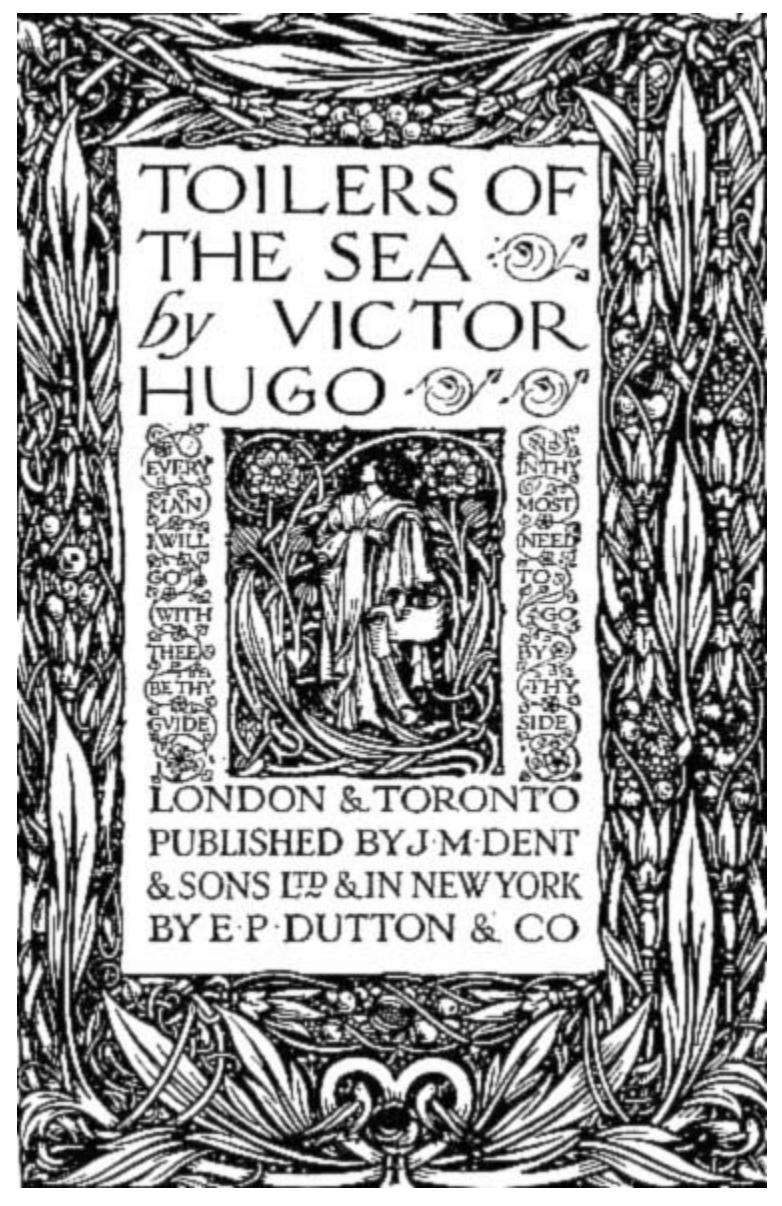
First Issue of this Edition 1911 Reprinted 1913, 1917, 1920, 1928