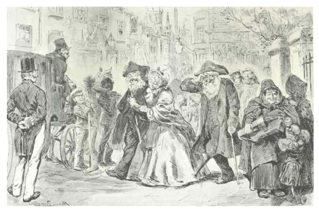
What Mr. Battens might have done in the matter of taking it up, goaded by the infuriated state of public feeling next morning, was anticipated by another phenomenon. A Truck, propelled by the Greenwich Pensioner and the Chelsea Pensioner, each placidly smoking a pipe, and pushing his warrior breast against the handle.

The display on the part of the Greenwich Pensioner of his 'marriage-lines,' and his announcement that himself and friend had looked in for the furniture of Mrs. G. Pensioner, late Mitts, by no means reconciled the ladies to the conduct of their sister; on the contrary, it is said that they appeared more than ever exasperated. Nevertheless, my stray visits to Titbull's since the date of this occurrence, have confirmed me in an impression that it was a wholesome fillip. The nine ladies are smarter, both in mind and dress, than they used to be, though it must be admitted that they despise the six gentlemen to the last extent. They have a much greater interest in the external thoroughfare too, than they had when I first knew Titbull's. And whenever I chance to be leaning my back against the pump or the iron railings, and to be talking to one of the junior ladies, and to see that a flush has passed over her face, I immediately know without looking round that a Greenwich Pensioner has gone past.