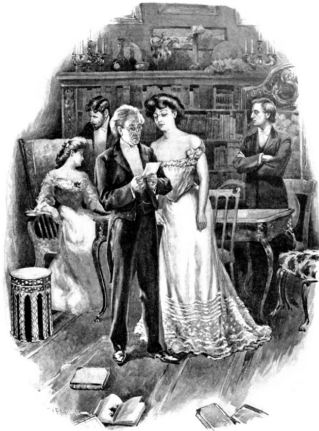
"THE GIRL'S EYES WERE OPENING AS FROM NATURAL SLUMBER"

She smiled faintly as she recognized him. "My arms are numb, and my feet feel as if strips of wood were nailed to my soles," she answered, wearily, "and my head is aching dreadfully; but that will soon pass."