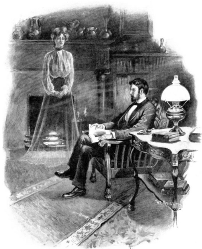
"VIOLA, TOO, CAME BACK TO BEWITCH HIM FROM HIS READING"

They came of good stock, these Servisses, and knew it and felt it. Breeding was indicated in their well-set heads, in their shapely hands, and especially in their handsome noses. "We are inclined to be stubby, that's true, but we have the noses of aristocrats--they go back to the Aryans of the Danube," said Mrs. Rice to a friend. "Morton cannot consider a girl of questionable pedigree, no matter how rich or charming she may be. We believe in stock--not in family, but strain ; a family is an accident, a strain is a formation. The Mortons and the Servisses are strains . Their union in my brother will yet make itself felt." Her confidence in his powers was absolute. "He is one of the greatest young men of his day. Time will show," she added, as if to clinch her argument.