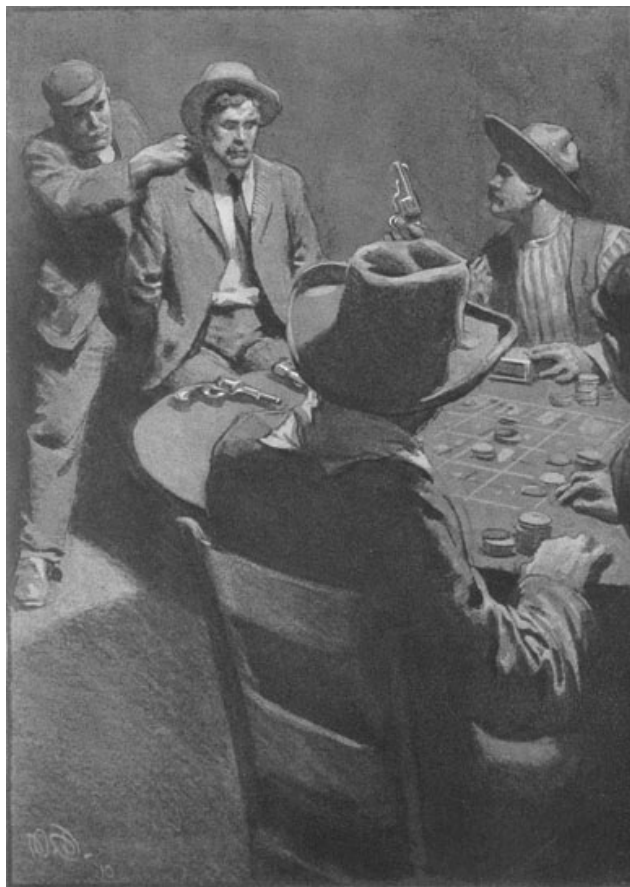
"Bart's afraid he can't duck without dying."

"Well?" growled the trainmaster, when he saw who had opened and closed the door. "Come back to tell me you've sworn off? That won't go down with Mr. Lidgerwood. When he fires, he means it."