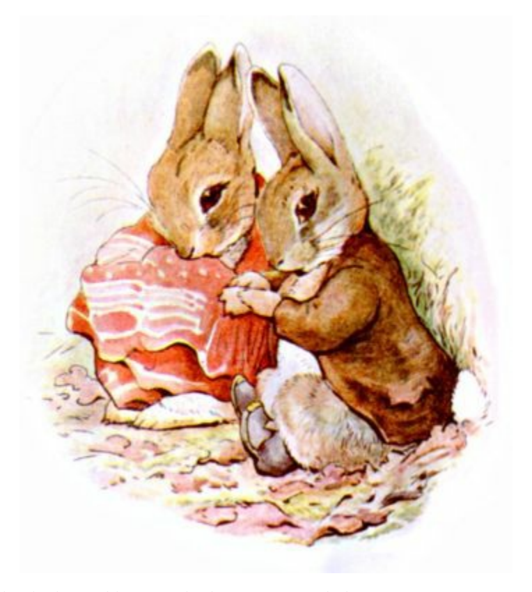
"Peter," said little Benjamin, in a whisper, "who has got your clothes?"

Peter was sitting by himself. He looked poorly, and was dressed in a red cotton pocket-handkerchief.