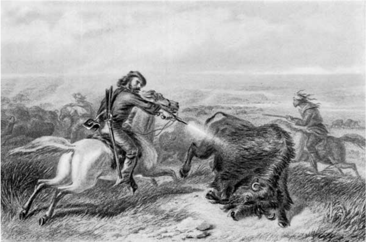
The buffalo-hunt. After a contemporary print.

Arrows whistled through the air, shots clattered with the fusillade of artillery volleys. Bullets fell to earth with the dull ping of an aim glanced aside by the adamant head bones or the heaving shoulder fur of the buffalo. The Indians shouted their war-cry of "Ah--oh, ah--oh!" Here and there French voices screamed "Vóila! Les b[œ]ufs! Les b[œ]ufs! Sacre! Tonnerre! Tir--tir--tir--donc! By Gar!" And Missouri traders called out plain and less picturesque but more forcible English.