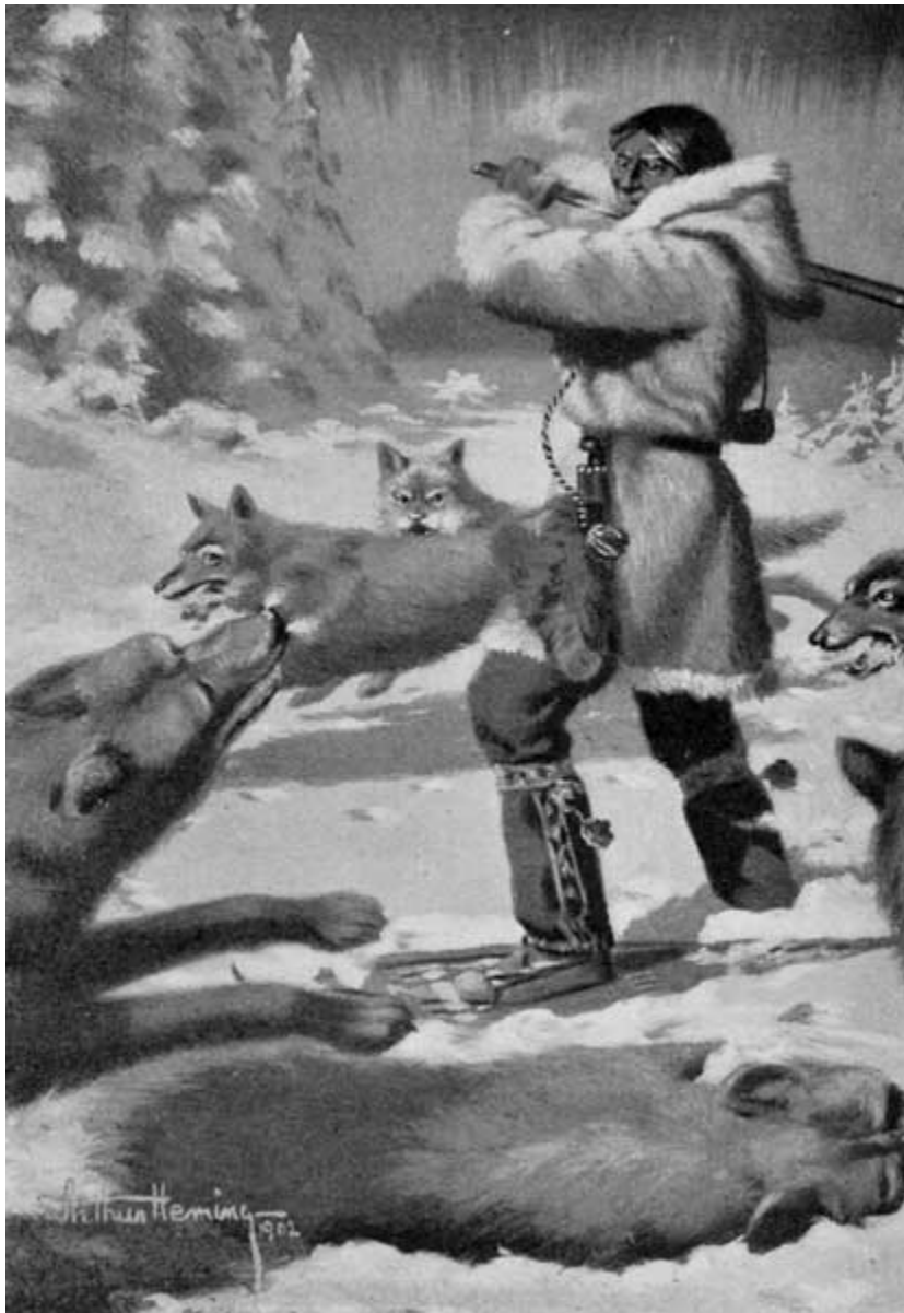
They dodge the coming sweep of the uplifted arm.

But the wolves are fighting from zest of the chase now, as much as from hunger. Leaping over their dead fellows, they dodge the coming sweep of the uplifted arm, and crouch to spring. A great brute is reaching for the forward bound; but a mean, small wolf sneaks to the rear of the hunter's fighting shadow. When the man swings his arm and draws back to strike, this miserable cur, that could not have worried the trapper's dog, makes a quick snap at the bend of his knees.