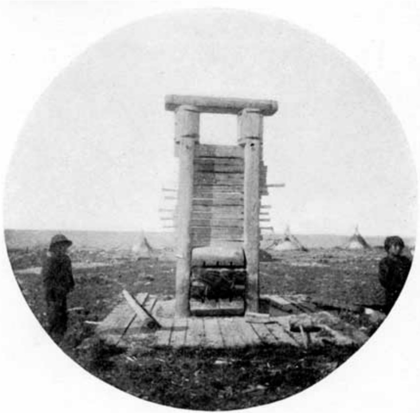
Old wedge press in use at Fort Resolution, of the sub-Arctics.