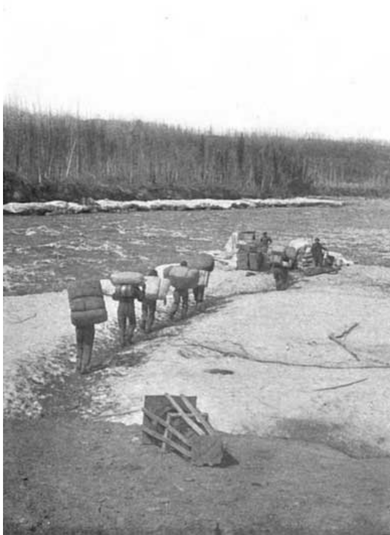
Indian voyageurs "packing" over long portage, each packet containing from fifty to one hundred pounds.

"Overhauled a canoe going eastward, ... a Mackinaw trader and four Indians with a dozen fresh American scalps," writes MacDonald, showing to what a pass things had come. Two days later a couple of boats were overtaken and compelled to halt by a shot from MacDonald's swivels. The strangers proved to be the escaping crew of a British ship which had been captured by two American schooners, and the British officer bore bad news. The American schooners were now on the lookout for the rich prize of furs being taken east in the North-West canoes. Slipping under the nose of these schooners in the dark, the officer hurried to Mackinac, leaving the Nor' Westers hidden in the mouth of French River. William MacKay, a Nor' West partner, at once sallied out to the defence of the furs.