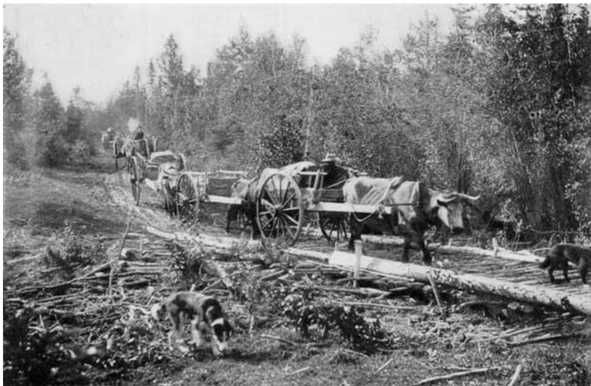
Carrying goods over long portage in MacKenzie River region with the old-fashioned Red River ox-carts.

Another picturesque feature of the fur trade was the long caravan of ox-carts that used to screech and creak and jolt over the rutted prairie roads between Winnipeg and St. Paul. More than 1,500 Hudson's Bay Company carts manned by 500 traders with tawny spouses and black-eyed impish children, squatted on top of the load, left Canada for St. Paul in August and returned in October. The carts were made without a rivet of iron. Bent wood formed the tires of the two wheels. Hardwood axles told their woes to the world in the scream of shrill bagpipes. Wooden racks took the place of cart box. In the shafts trod a staid old ox guided from the horns or with a halter, drawing the load with collar instead of a yoke. The harness was of skin thongs. In place of the ox sometimes was a "shagganippy" pony, raw and unkempt, which theimps lashed without mercy or the slightest inconvenience to the horse.