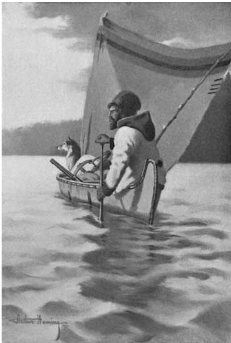
With eye and ear alert the man paddles silently on. (See page 105. )