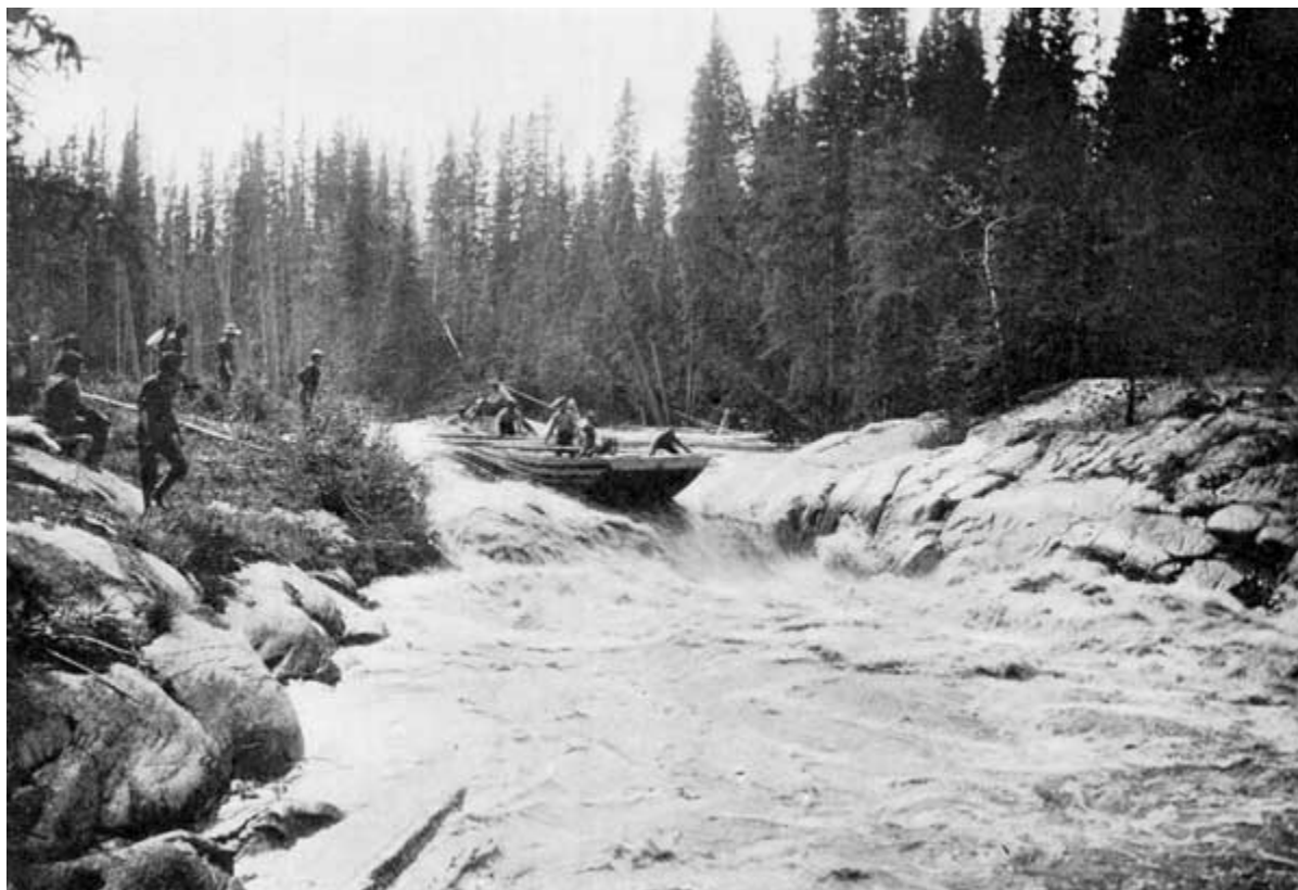
Traders running a mackinaw or keel-boat down the rapids of Slave River without unloading.

But the waters gather as if to throw themselves forward. The roar becomes a crash. As if moved by one mind the paddlers brace back. The lightened bow lifts. A white dash of spray. She mounts as she plunges; and the voyageurs are whirling down-stream below a small waterfall. Not a word is spoken to indicate that it is anything unusual to sauter les rapides , as the voyageurs say. The men are soaked. Now, perhaps, some one laughs; for Jean, or Ba'tiste, or the dandy of the crew, got his moccasins wet when the canoe took water. They all settle forward. One paddler pauses to bail out water with his hat.