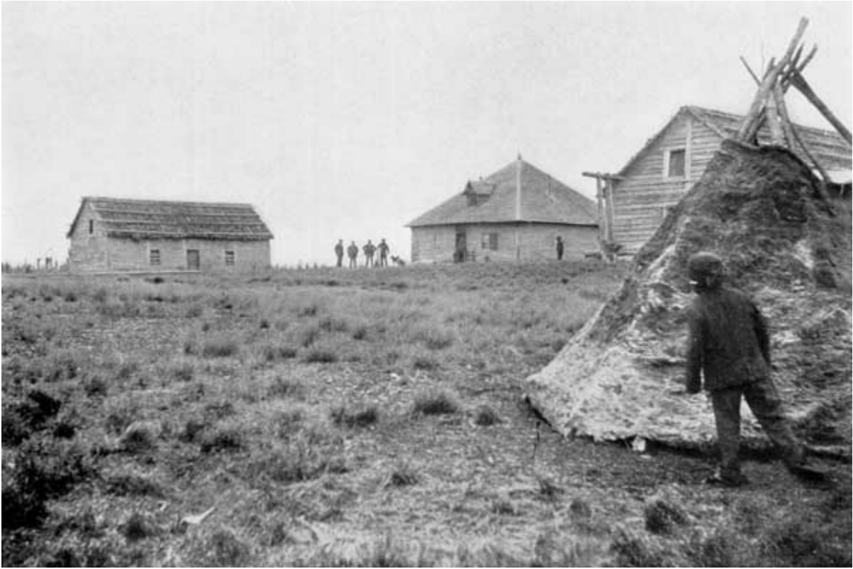
Fort MacPherson, now the most northerly post of the Hudson's Bay Company, beyond tree line; hence the houses are built of imported timber, with thatch roofs.

Here the track is lost at the narrow ford of an inflowing stream, but across the creek lies a fallen poplar littered with--what? The feathers and bones of a dead owlet. Balancing himself--how much better the moccasins cling than boots!--the trapper crosses the log and takes up the trail through the rushes. But here musquash has dived off into the water for the express purpose of throwing a possible pursuer off the scent. But the tracks betrayed which way musquash was travelling; so the trapper goes on, knowing if he does not find the little haycock houses on this side, he can cross to the other.