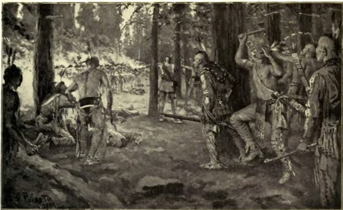
"The men had been hastily formed into a square."

A sudden wild clamor smote upon the morning quiet. The outposts were rushing in with the cry that the woods on every side were full of Cherokees, with their faces painted, and swinging their tomahawks; the next moment the air resounded with the hideous din of the war-whoop. Demere's voice rose above the tumult, calling to the men to fall in and stand to their arms. A volley of musketry poured in upon the little camp from every side.