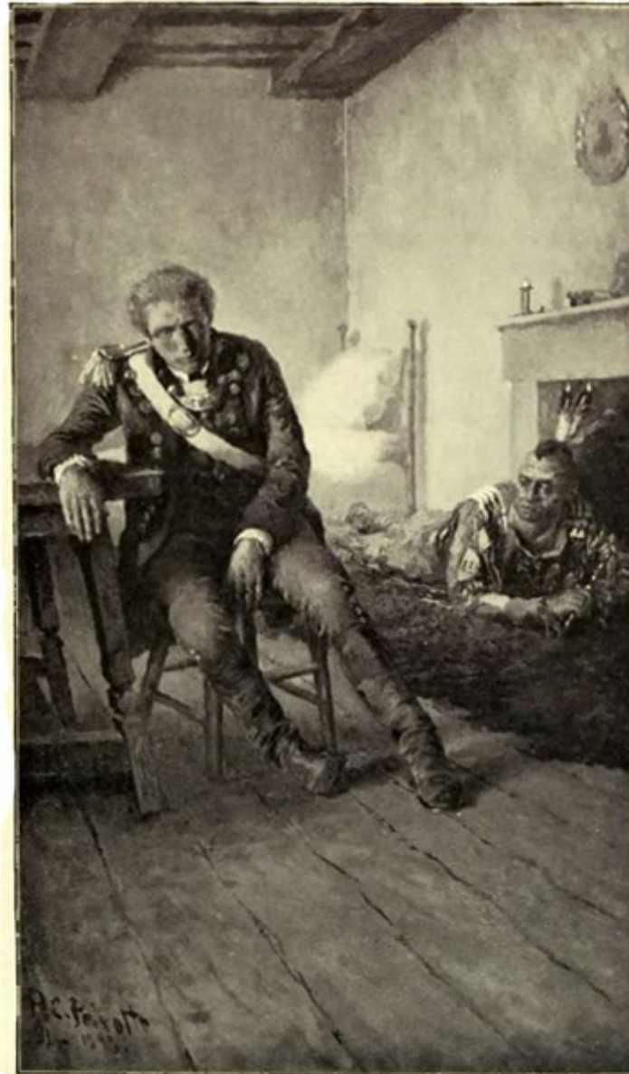
"He stared forward blankly at the inevitable prospect."

"I will not go!" he cried in sudden passion. "So help me, God! I will die first!--a thousand deaths. So help me, God!" He lifted his clinched right hand in attestation and shook it wildly in the air.