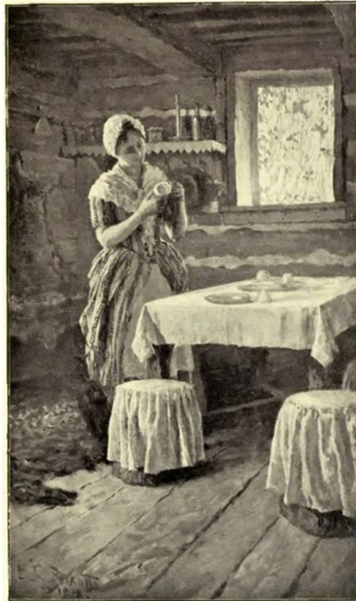
"And oh, the moment of housewifely pride!"

"I don't intend to plait my hair in a queue any more," Hamish declared contemptuously. "The men in this country," he continued with a lofty air, "have too much men's work to do to busy themselves with plaiting hair and wearing a bobbing pig-tail at their ears." He shook his own dangling curls as he spoke.