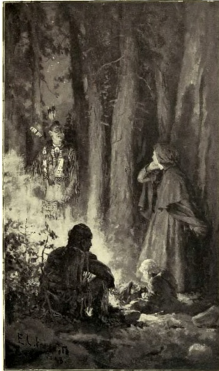
"What more wonderful? What more fearful?"

He had never heard of Babel, poor soul, but he was as subject to the inconvenience of the confusion of tongues as if he had had an active share in the sacrilegious industry of those ambitious architects who builded in the plains of Shinar.