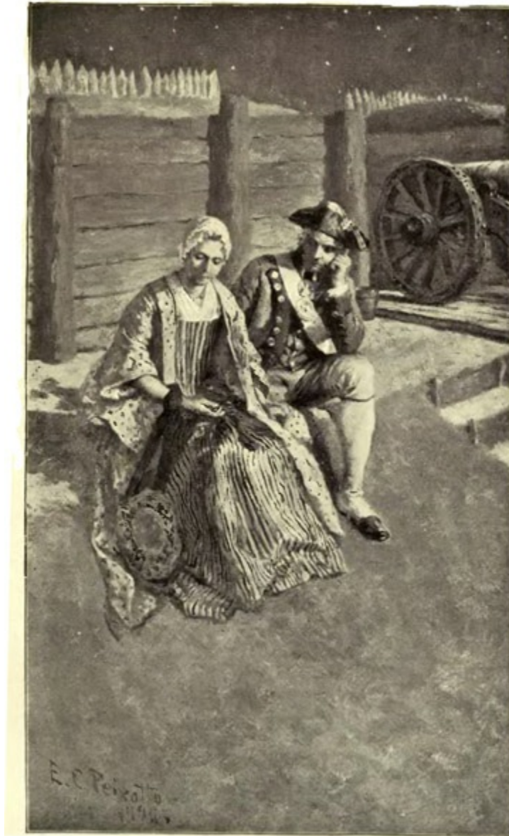
Belinda and the Ensign on the moonlit rampart.

The expected attack by the Indians took place one night late, in the dead hour, after the sinking of the moon, and with all the cunning of a designed surprise. The shadowy figures, that one might imagine would be indistinguishable from the darkness, had crept forward, encompassing the fort, approaching nearly to the glacis, when the crack of a sentry's firelock rang out, splitting the dead silence, and every cannon of the twelve roared in hideous unison, for the gunners throughout the night lay ready beside the pieces. A fusillade ill-directed upon the works, for the besiegers encountered the recoil of the surprise they had planned, met a furious response from the loop-holes where the firelocks of the garrison were reenforced by the rifles of the backwoodsmen. Every man had been assigned his post, and it seemed that the wild alarum of the drum had hardly begun to vibrate on the thrilling air when each, standing aside from the loop-hole according to orders, leveled his weapon without sighting and fired. Wild screams from without, now and again, attested the execution of these blind volleys into the black night, and the anguish that overcame the stoical fortitude of the warlike Cherokee. The crashing of the trees, as the cannon on all sides sent the heavy balls thundering beyond the open space into the forest, seemed to indicate that the retreat of the assailants was cut off, or that it must needs be made under the open fire of the artillery.