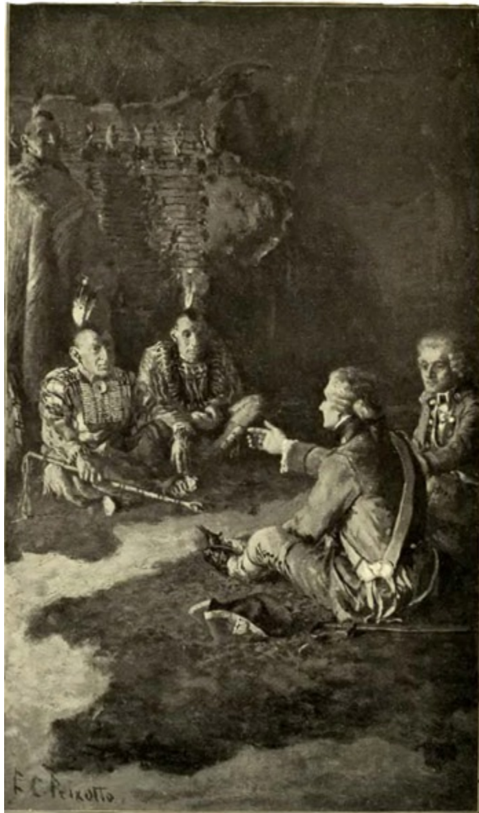
"The officers expressed their earnest remonstrances." (See