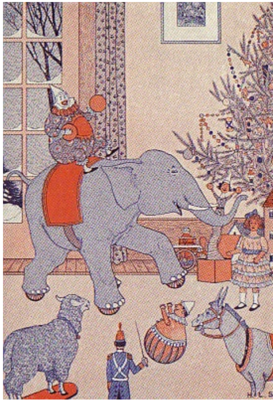
"Now Hold on Tightly," Said the Elephant. The Story of a Stuffed Elephant. Frontispiece--( Page 52 )