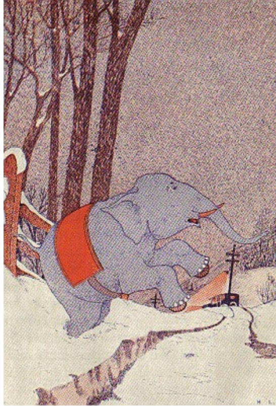
The Stuffed Elephant Stuck in a Snowdrift.

"Oh, dear!" whispered the Elephant to himself, for he went toppling, legs over head, out through a broken window of the car. Into a deep snowdrift stuck the poor Stuffed Elephant.