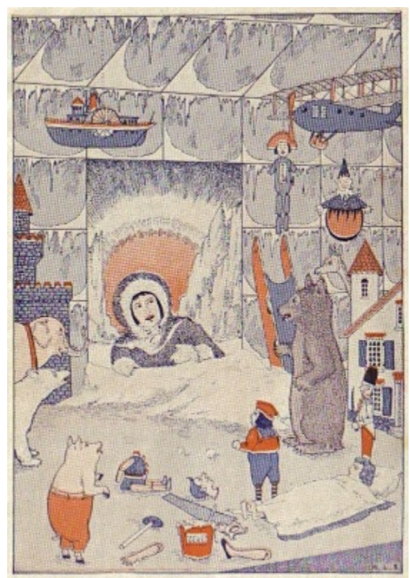
"Be Careful, Everybody!" Said the Plush Bear.

It was almost dark in the toy shop now. Outside the Northern Lights glowed faintly, and inside only a little candle was left gleaming, its beams reflected in some shiny gold stars that were to go on the tops of Christmas trees later on.