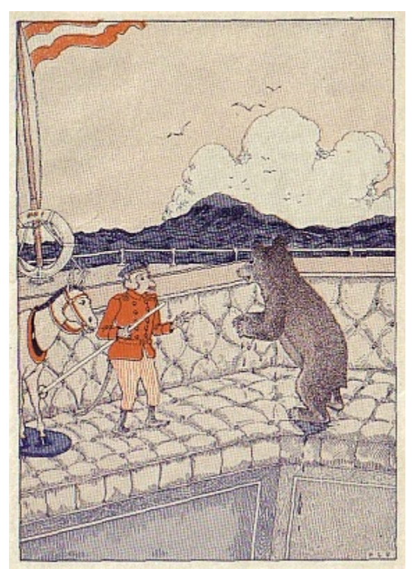
The Plush Bear Meets Nodding Donkey and Monkey On a Stick. Page 117

"I'm not a Teddy Bear at all," said Mr. Bruin to himself; "but if you rescue me from the water you may call me anything you wish."