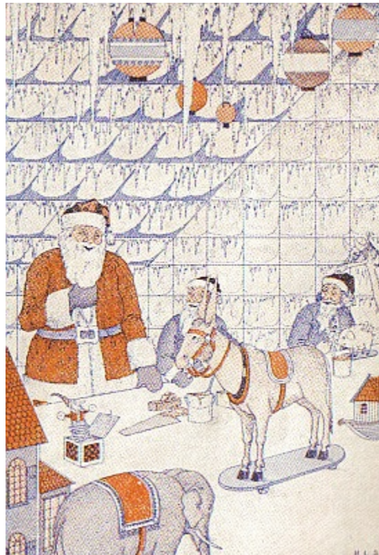
The Nodding Donkey's First Appearance.