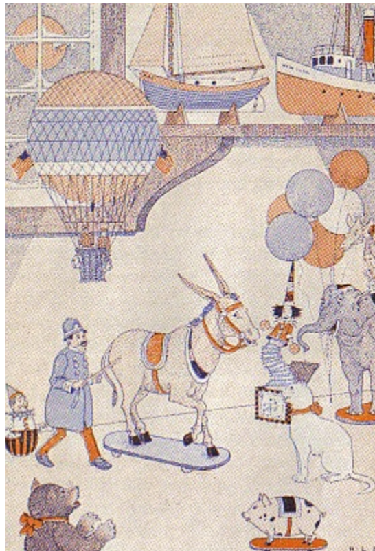
The Nodding Donkey is Ticked by the Toy Policeman.