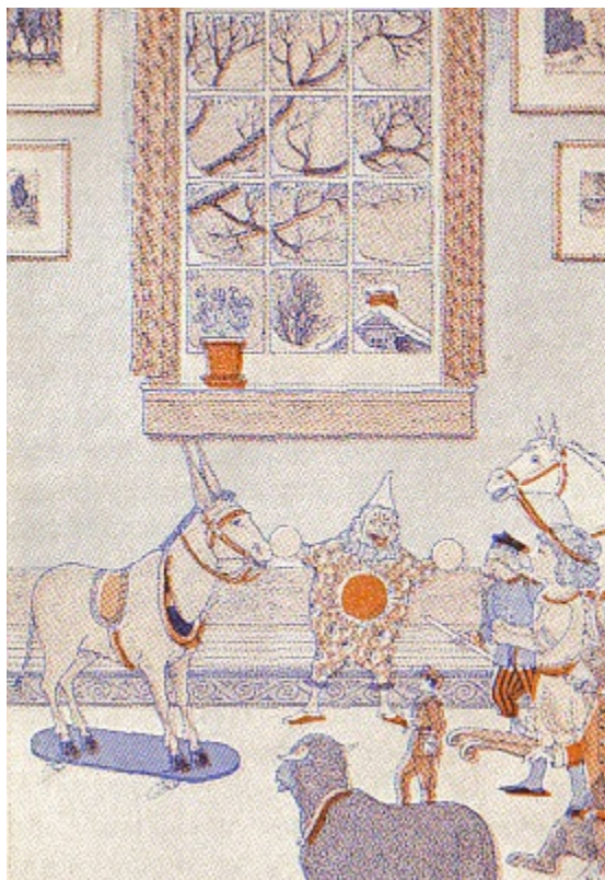
The Nodding Donkey is Welcomed by the Calico Clown.

"Ladies and Gentlemen," said the Calico Clown in his jolly voice, "we have all met together, after a long time of being apart. We have all had good times together, and now I hope you will all agree with me when I say that we are glad to welcome the Nodding Donkey among us."