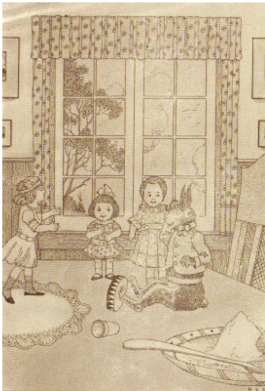
Candy Rabbit Has a Tumble.