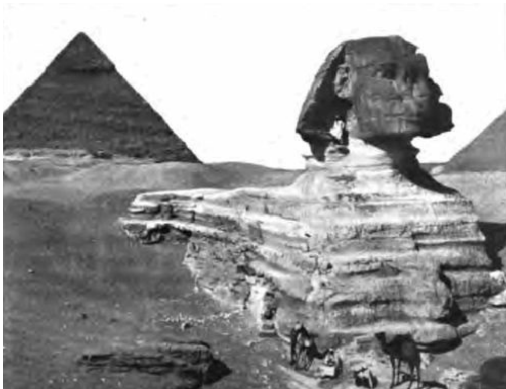
A VAST INDIFFERENCE TO ALL PUNY THINGS

As with the Pyramids, our first impression of the Sphinx was one of disappointment. It seemed small to us. It is small compared with a pyramid, while the photographs give one another idea. The photographs are made with the Sphinkis (Sphinx, I mean--one falls so easily into the native speech) in the foreground, looking fully as big as the second-size pyramid and quite able to have the third-size pyramid for breakfast. Figures mean nothing in the face of a picture like that; you comprehend them, but you do not realize them--visualize them, perhaps I ought to say.