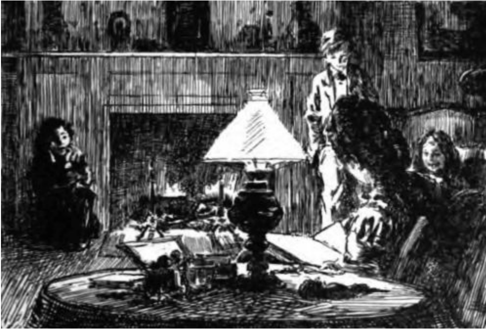
TO ME IT WAS ALL TRUE, ALL ROMANCE--ALL POETRY

just within reach, it lay. There was no reason why, in some measure at least, I should not follow the track of those old first "Innocents Abroad." Of course, I was dreaming again--only, this time, perhaps, I could make the dream come true.