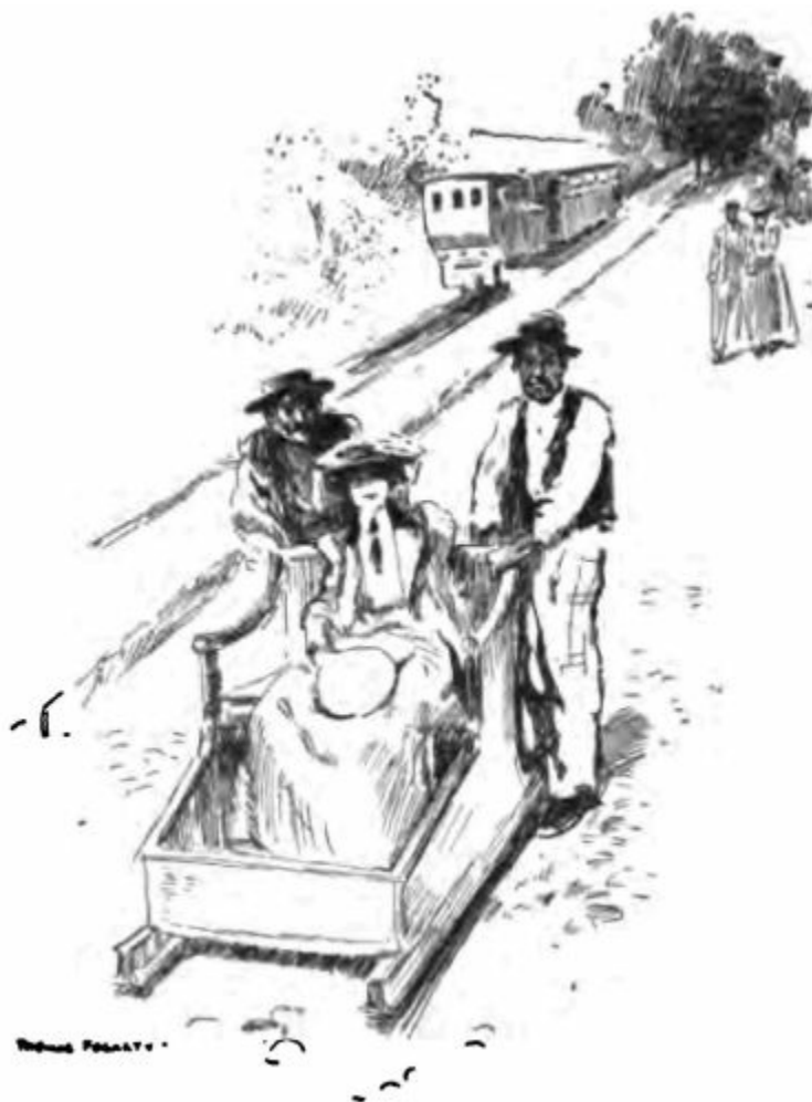
TWO MEN TAKE YOU IN HAND AND AWAY YOU GO

Good-bye to Madeira—a gentle place, a lovely place—a place to live and die in.