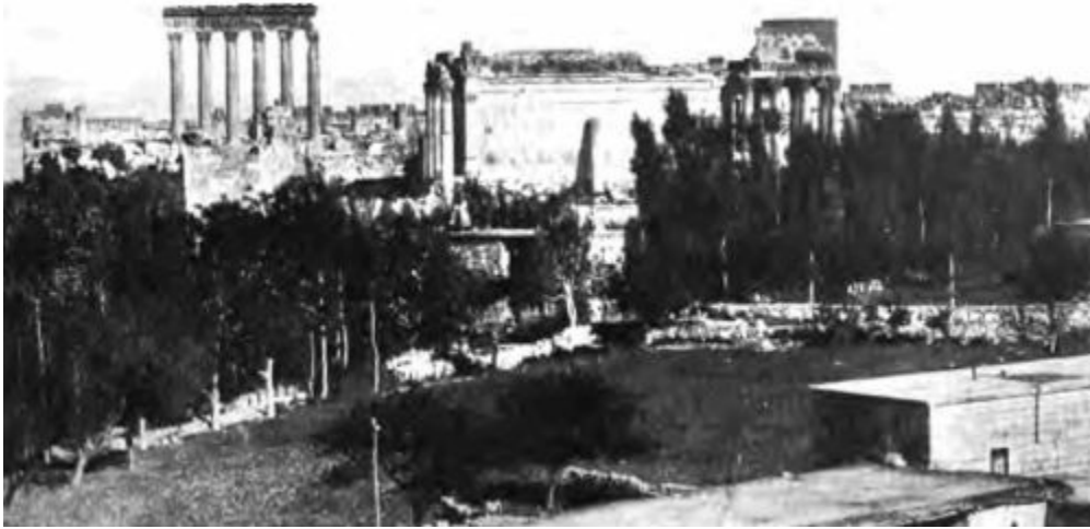
FROM THE TIME OF ADAM BAALBEC BECAME A PLACE OF ALTARS

It is a colossal object-lesson in what religions can do when they try. Nobody really knows who began to build temples here, but from the time of Adam Baalbec became a place of altars. Before history began it was already a splendid Syrian city, associated with the names of Cain, Nimrod, and Abraham, and it may have been Cain himself who raised the first altar here when he made that offering for which the Lord "had not respect." More likely, however--and this is the Arab belief--it was the city of refuge built by Cain, whose fear must have been very large if one may judge from the size of the materials used.