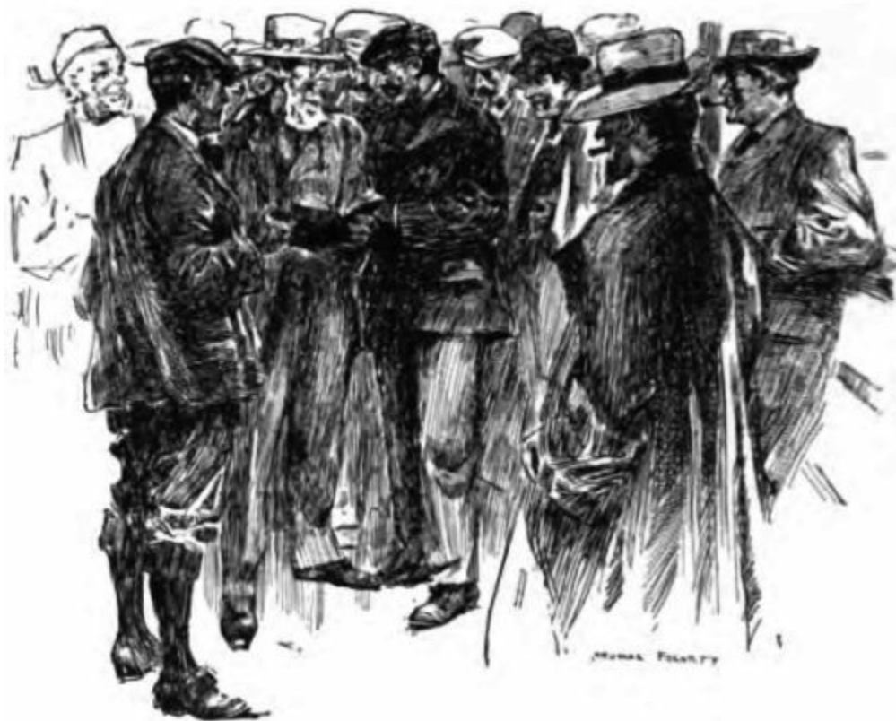
THE PATRIARCH KNEW ALL ABOUT JAFFA

We were not the only ones there. Two other great excursion steamers lay at anchor, the Arabic and the Moltke , their decks filled with our fellow-countrymen, and I think the several parties of ship-dwellers took more interest in looking at one another, and in comparing the appearance of their respective vessels, than in the rare vision of Jaffa aglow with morning. Three ship-loads at once! It seemed like a good deal of an invasion to land on these sacred shores. But then we remembered how many invasions had landed at Jaffa--how Alexander and Titus had been there before us, besides all the crusades--so a modest scourge like ours would hardly matter. As for that military butcher, Napoleon, who a little more than a century ago murdered his way through this inoffending land, he shot four thousand Turkish prisoners here on the Jaffa sands, after accepting their surrender under guarantee of protection. We promised ourselves that we would do nothing like that. We might destroy a pedler now and then, or a baksheesh fiend; but four thousand, even of that breed, would be too heavy a contract.