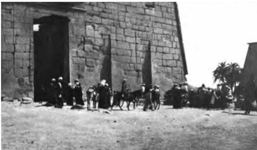
ITS MAGNIFICENT PYLONS OR ENTRANCE WALLS ... AND THEN ONCE MORE WE WERE ON THE DONKEYS

How little and how feebly I seem to be writing about this stupendous ruin, yet I must conclude presently for lack of room. We went into the Ramesseum, a temple literally lined with heroic statues of Rameses, where I made a picture of the fly-brush brigade, as we call ourselves now, because in Upper Egypt a fly-brush is absolutely necessary not alone to comfort, but to very existence. The fly here is not the ordinary house variety, fairly coy and flirtatious if one has a newspaper or other impromptu weapon, retiring now and again to a safe place for contemplation; no, the Egyptian fly is different. He never retires and he is not in the least coy. He makes for you in a cloud, and it is only by continuous industry that you can beat him off at all. Furthermore, he begins business the instant he touches, and he has continuously the gift which our fly sometimes has on a sultry, muggy day--the art of sticking with his feet, which drives you frantic. So you buy a fly-brush the instant you land in Upper Egypt, and you keep it going constantly from dawn to dark. The flies retire then, for needed rest.