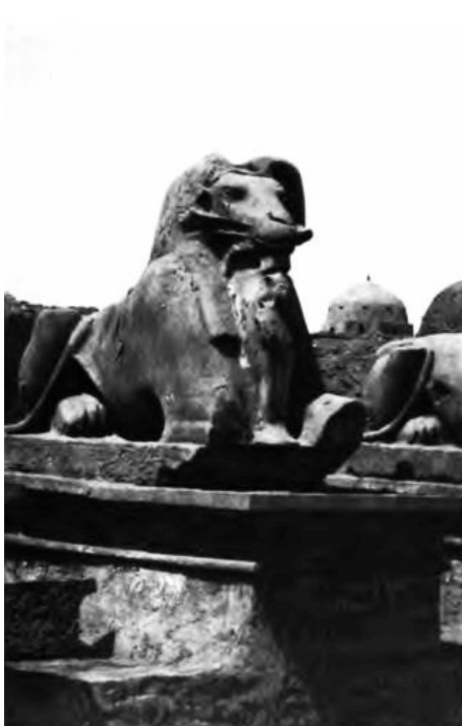
GOT IT MADE CHEAP SOMEWHERE WITH HER PICTURE CARVED ON THE FRONT OF IT

"Speaking of my tomb. I am glad I am not there. I attract much more attention here than if I were on exhibition in that