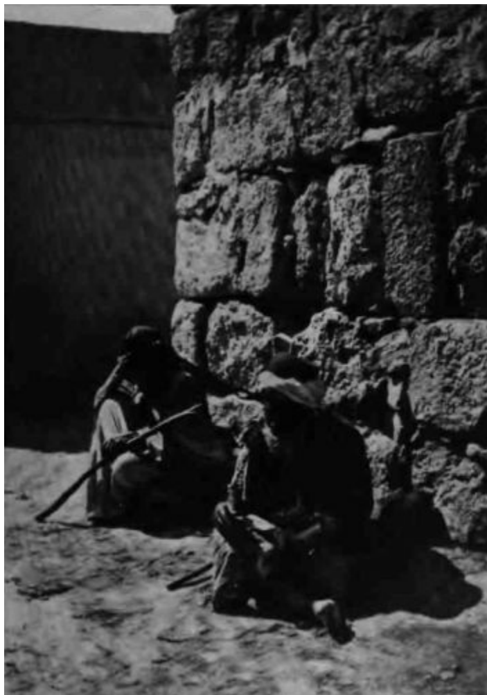
THE DEPTH OF THEIR FALL

considering a race—a race no worse than any other, and no better, but a chosen race; a race that without a ruler, without a nation, without a government—that outcast and despised of many nations has yet remained a unit through three thousand years. I am maintaining that only a chosen people could do that, and, without being able even to surmise the purpose, it is my humble opinion that the ages will show that purpose to have been good.