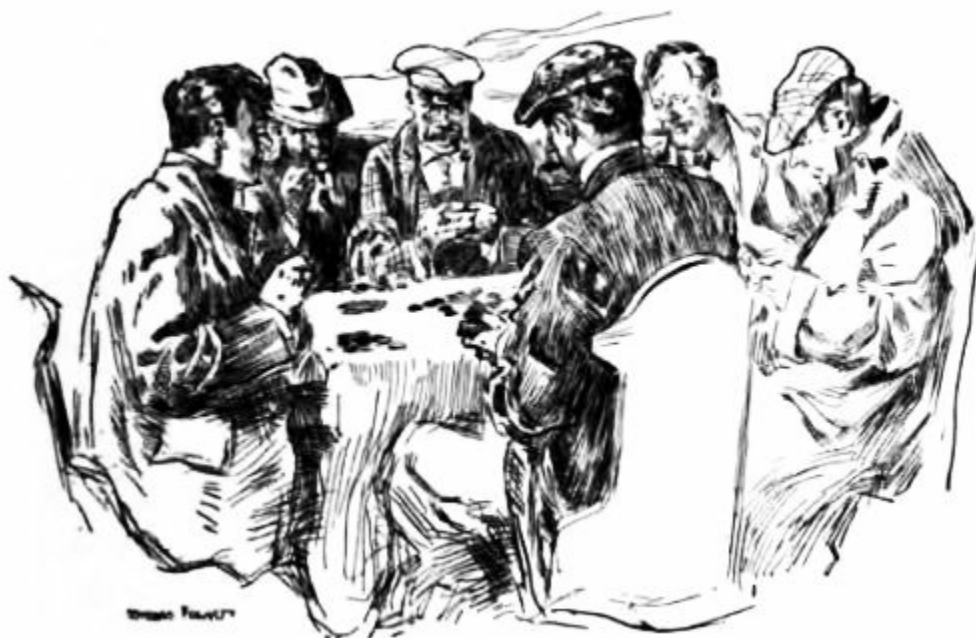
THEY ARE AN ATTRACTIVE LOT--THE REPROBATES

We have taken up such amusements as please us--reading, games, gossip, diaries, picture-puzzles, and there are even one or two mild flirtations discoverable. In the "booze-bazaar" (the Diplomat's name for the smoking-room) the Reprobates find solace in pleasant mixtures and droll stories, while they win one another's money at diverting games. They are an attractive lot--the Reprobates. One can hardly tear himself away from them. Only the odors of the smoking-room are not quite attractive, as yet. I am no longer seasick--at least, not definitely so; but I still say "Mind is all" as I pass through the smoking-room.