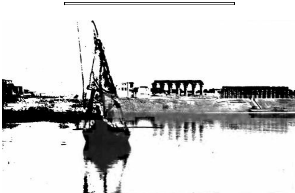
THE TEMPLE OF LUXOR ... ONCE MORE REFLECTING ITS COLUMNS IN THE NILE

Now that we were outside of the shaded temple and sanctuary enclosures our party was not very game. It was our first day in Upper Egypt, and the flies and the sun made a pretty deadly combination. We began to complain, and to long for the cool corridors and fizzy drinks and protecting screens of the hotel. We might have played golf or tennis in that sun, but seeing ruins was different, and we began to pray for the donkeys again. So Gaddis led us around by the Sacred Lake, where once the splendid ceremonials were performed--it is only a shallow pool now--and then once more we were on the donkeys, strung out in a crazy, shrieking stampede for the hotel. Gaddis rode near me. His donkey was a racer, too, but Gaddis did not laugh or cry out, or anything of the sort. He only wore that gentle serene smile, the smile of Egypt, observing trivial things.