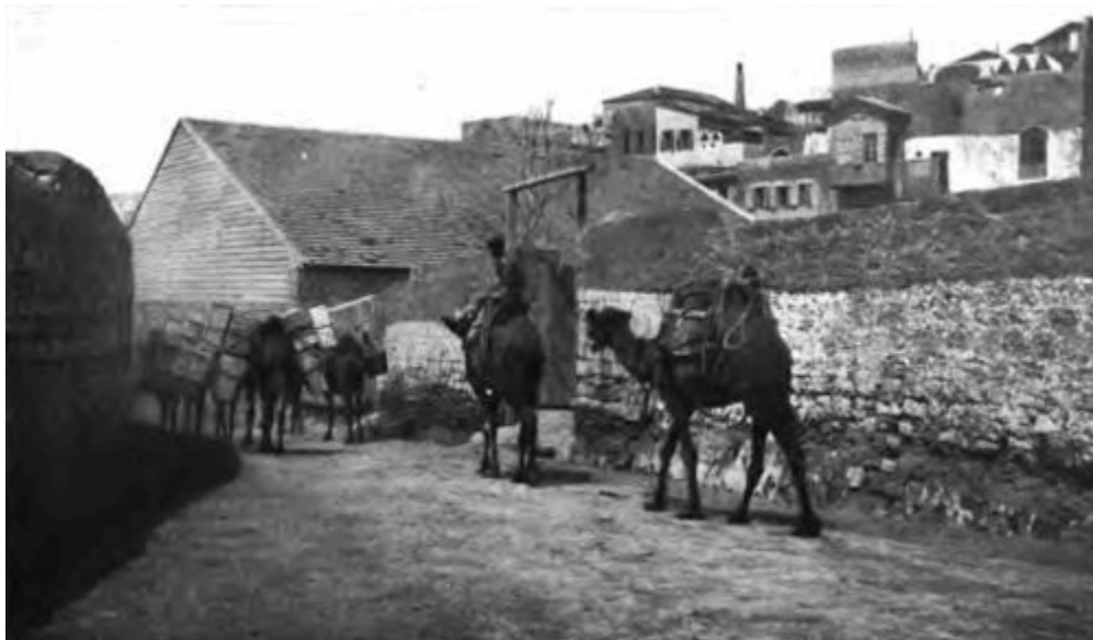
A CAMEL TRAIN LED THE WAY THROUGH THE GATES

I suppose "Oh, thou happy one; Oh, thou holy one," would be about the translation, with the wailing refrain at the end. I think we gave them something. I hope so; they are after us always, and we either give them or we don't, without much discrimination. You can't discriminate. They are all wretched and miserably needy. You give to get rid of them, or when pity clutches a little fiercer than usual at your heart.