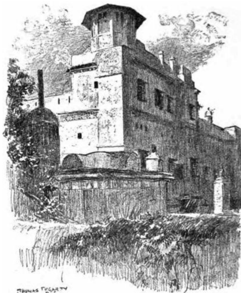
"THAT IS THE KASBA"

That was the downfall of Algiers. A blockade was established by the French, and three years later the French army of invasion marched in. Fifteen hundred guns, seventeen ships of war, and fifty million francs fell into the hands of France, as spoil of war. Algiers was no longer the terror of the seas. Over six hundred thousand Christian people had suffered the horrors of Algerian bondage, but with that July day, 1830, came the end of this barbarism, since which time Algiers has acquired a new habit--the habit of jumping at the crack of the French whip.