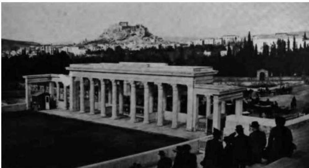
WE LOOKED ACROSS THE ENTRANCE AND THERE ROSE THE ACROPOLIS, HIGH AGAINST THE BLUE

That was Averof's inspiration. Without it he would most likely have spent his money in Alexandria, where he made it. Certainly without King George to point the way the progress of Athens would have been a sorry straggle instead of a stately march.