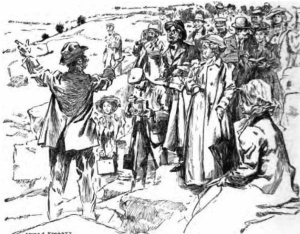
HE WOULD SWING HIS ARMS AND BEGIN, "YOU SEE--!" THE REST REQUIRED A MIND-READER

which nobody recognized, and which upon inquiry I was surprised to find was English. He had learned it overnight, it having been discovered that the guide engaged for our party had been detained--probably in jail--for the same offence. Still our sample would have done better if he had sat up later. As it was he knew just two words. He would swing his arms and point to something and begin, "You see--!" The rest required a mind-reader. The German guide was better--much better. I haven't a perfect ear for German, but I concluded to join that party.