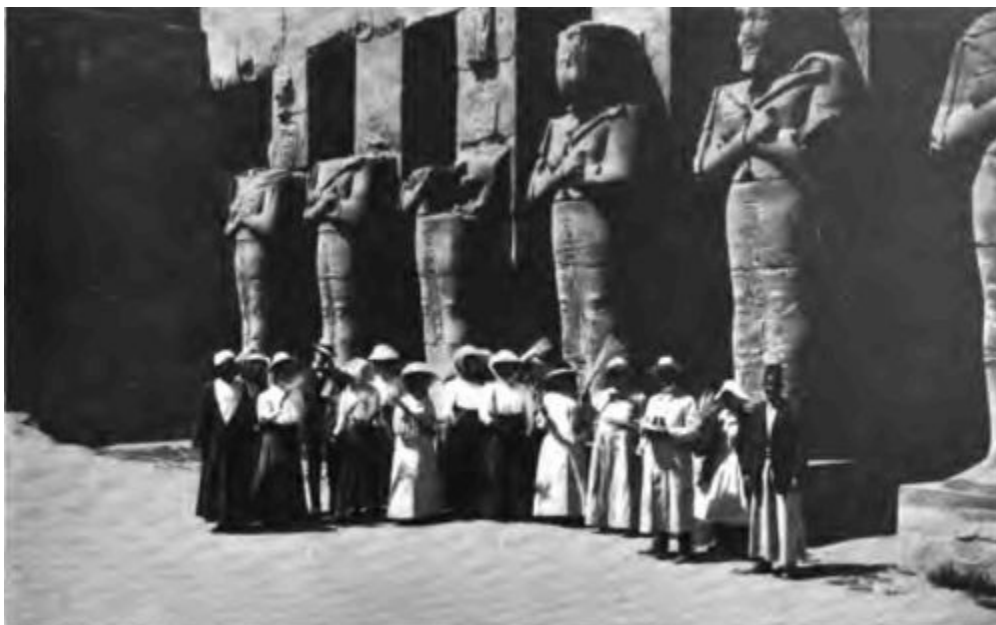
I MADE A PICTURE OF THE FLY-BRUSH BRIGADE

harmonious, and more beautiful than I can tell.