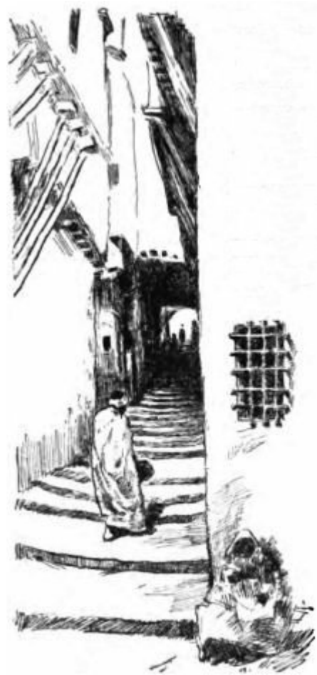
THOMAS FLEAATY ETERNALLY EAST WITH NO HINT OF THE OUTSIDE WORLD

Now I suspect that those jars are not for sale. This one had a sort of brass seal with a number and certain cryptic words