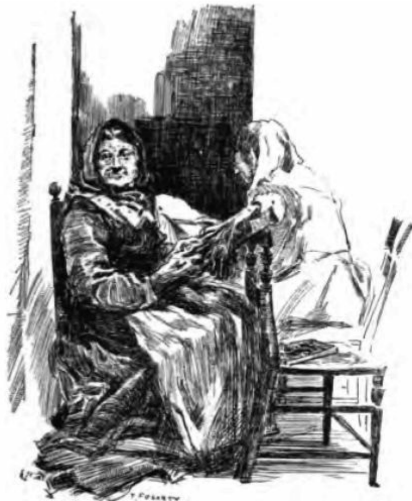
TWO BENT, WRINKLED WOMEN WEAVING LACE OUTSIDE THE DOOR

because they would have taken less, we because we would have given more. Only our guide was a bit solemn. I suppose his commission was modest enough in a place like that.