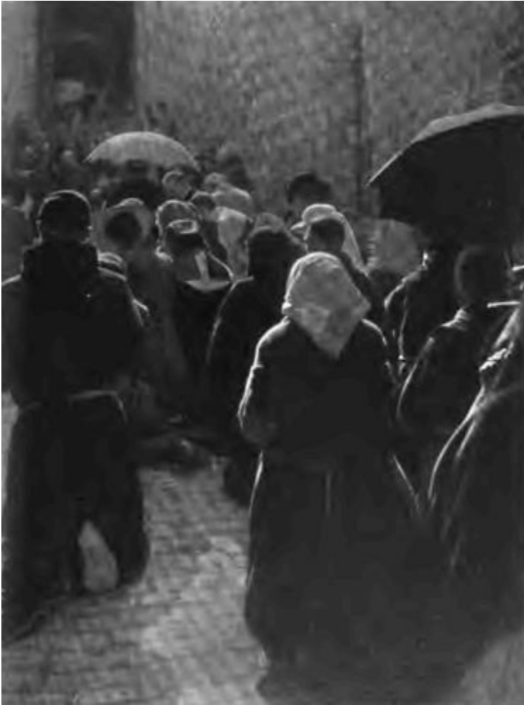
THE WAY OF THE CROSS