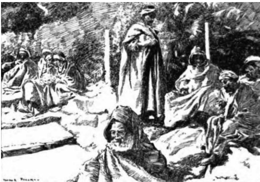
ONE DOES NOT HURRY THE ORIENT--ONE WAITS ON IT

"Nothing; only that tower seems to be another 'Queen's Chair.' I've been to it several times in the guide-book myself, and I've already had it twice served up by hand. Let's don't talk about it any more, until we've been ashore and had a look at it."