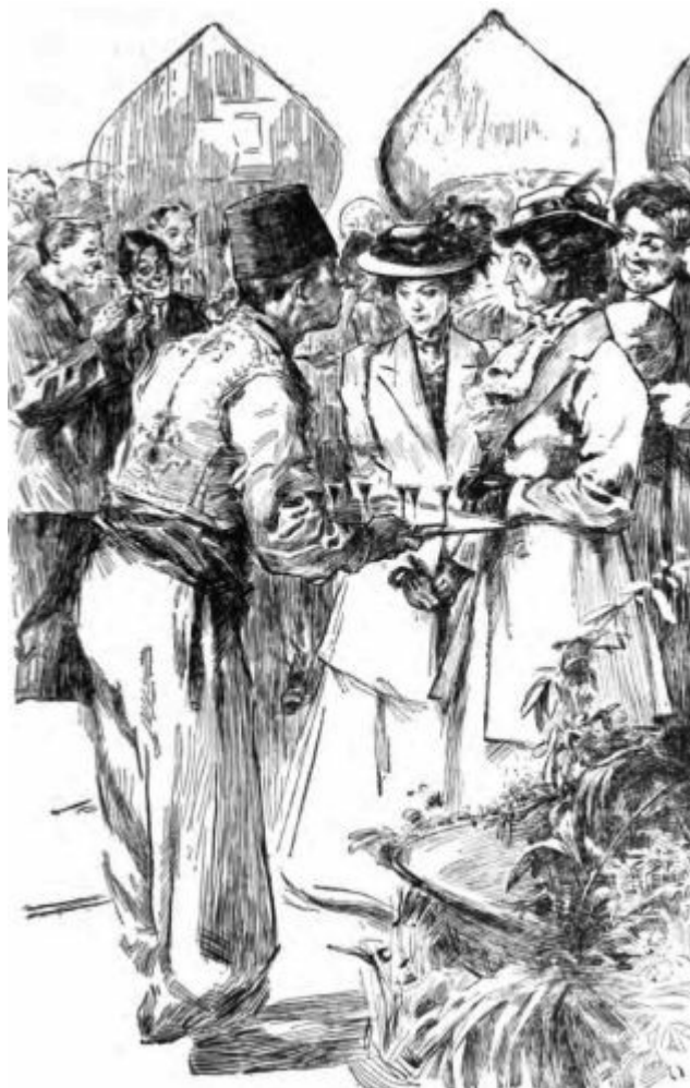
URGING US TO PARTAKE OF THE PRECIOUS STUFF, WITHOUT STINT

I do not think I shall turn Moslem. The doctrine has attractive features, both here and hereafter; but I would not like to undertake the Koran at my time of life. I can, however, and I do, pay the tribute of respect to the sun-baked land and sun-browned race that have given birth to three of the world's great religions, even though they have not unnaturally