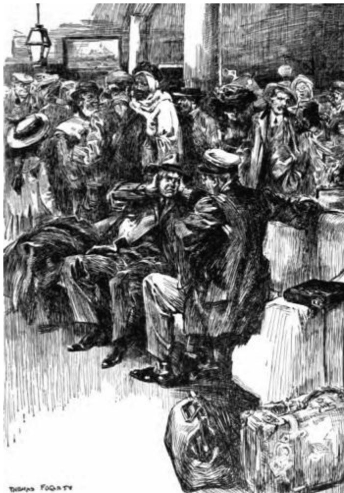
ASKED HIM IF HE WOULDN'T EXECUTE A LITTLE COMMISSION FOR ME IN THE BAZAARS

I thought the Apostle looked particularly solemn. Being a weighty person, jouncing all day in a carriage and walking through brass bazaars and fez bazaars and silk bazaars and rug bazaars and silver bazaars and leather bazaars and saddle bazaars, and at least two hundred and seven other bazaars, had told on him. When I spoke cheerily he merely grunted and reached for something in a glass which, if it tasted as it smelled, was not calculated to improve his temper. When I sat down beside him he did not seem over cordial.