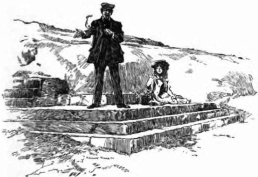
TOOK TURNS ADDRESSING THE MULTITUDE