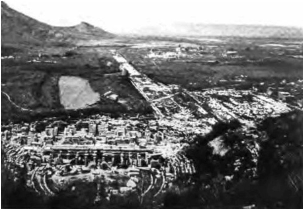
ALL THE PLAINS AND SLOPES OF THE OLD CITY WITH ITS WHITE FRAGMENTS AND POOR RUINED HARBOR LAY AT OUR FEET

Note.--In this picture the theatre where St. Paul fought is in the foreground; the library just beyond, the market-place to the right. Bits of water show where the harbor once lay.