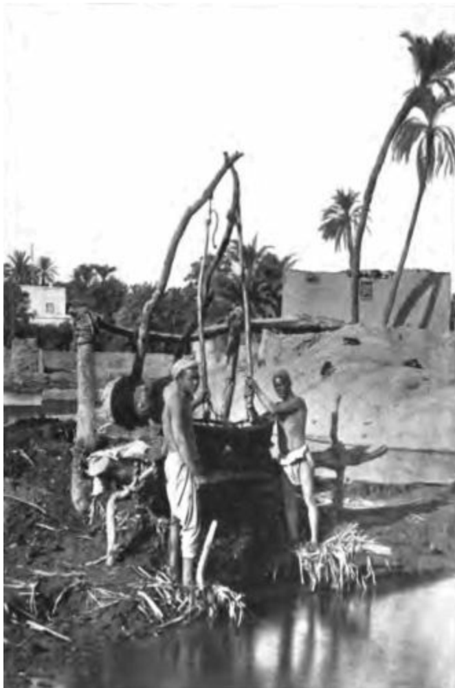
THINK OF WATERING A WHOLE WHEAT-FIELD WITH A WELL-SWEEP AND A PAIL

It is such a narrow land! Sometimes the lifeless hills close in on one side or the other to the water's edge. Nowhere is the fertile strip wide, for its fertility depends wholly on the water it receives from the Nile, and when that water is drawn up by hand with a goat-skin pail and a well-sweep—a shaduf , as they call it—it means that fields cannot be very extensive, even if there were room, which as a rule there is not.