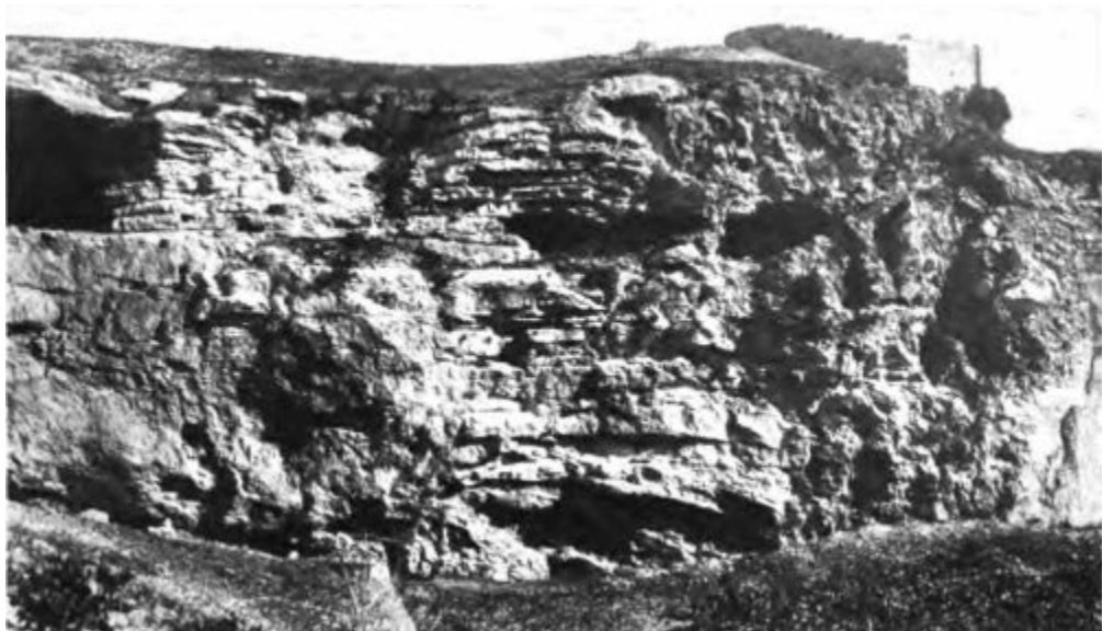
THE TRUE GOLGOTHA--THE PLACE OF THE SKULL

We were away immediately, all of us, hurrying for the Damascus gate, beyond which it lay. It was not far--nothing is far in Jerusalem--and presently we were outside, at the wicket of a