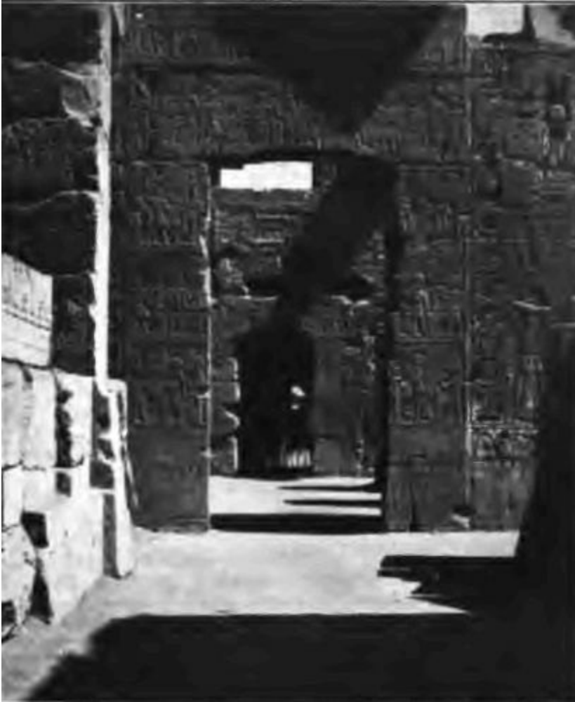
SANCTUARY IN KARNAK