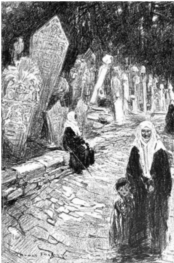
I WANTED TO CARRYAWAY ONE OF THOSE TOMBSTONES

There is a wonderful old Moslem cemetery near Bulgurlu—one of the largest in the world and the most thickly planted. It is favored by Moslems because it is on the side of the city nearest Mecca, and they are lying there three deep and have overflowed into the roads and byways. Their curiously shaped and elaborately carved headstones stand as thick as grain—some of them crowned with fezzes —some with suns—all of them covered with emblems and poetry and passages from the Koran. They are tumbled this way and that; they are lying everywhere along the road; they have been built into the wayside walls.