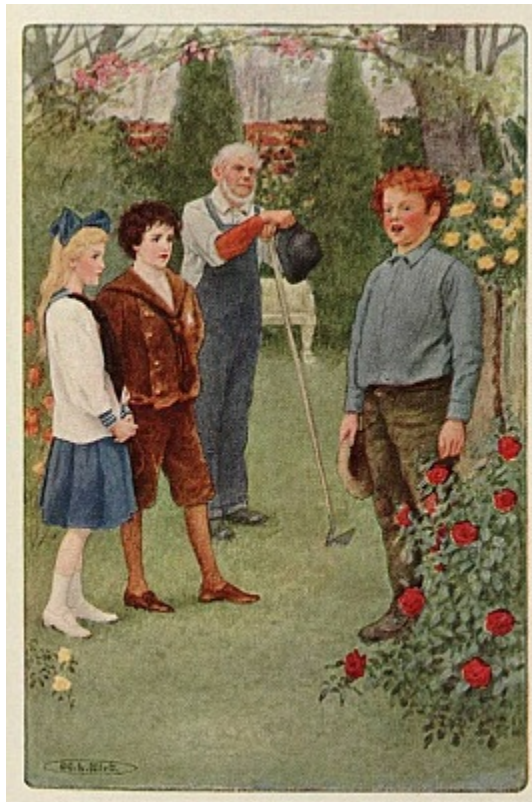
"PRAISE GOD FROM WHOM ALL BLESSINGS FLOW" -- Page 344

And they sang it again, and Mary and Colin lifted their voices as musically as they could and Dickon's swelled quite loud and beautiful--and at the second line Ben Weatherstaff raspingly cleared his throat and at the third he joined in with such vigor that it seemed almost savage and when the "Amen" came to an end Mary observed that the very same thing had happened to him which had happened when he found out that Colin was not a cripple--his chin was twitching and he was staring and winking and his leathery old cheeks were wet.