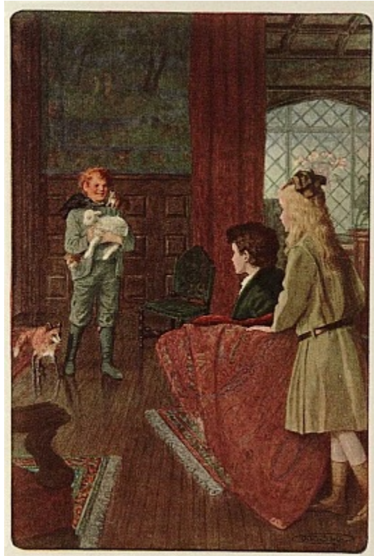
"DICKON CAME IN SMILING HIS NICEST WIDE SMILE."— Page 251

Dickon came in smiling his nicest wide smile. The new-born lamb was in his arms and the little red fox trotted by his side. Nut sat on his left shoulder and Soot on his right and Shell's head and paws peeped out of his coat pocket.