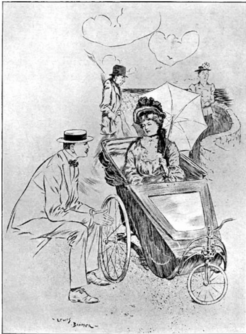
A little group about the Sea Lady's bath chair.

My cousin slackened his pace a little and came up and joined them. The conversation hung at his approach. Chatteris sat back a little, but there seemed no resentment and he sought a topic for the three to discuss in the books Melville carried.