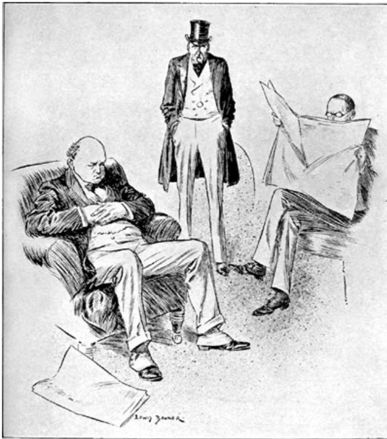
They seemed never to do anything but blow and sigh and rustle papers.

Melville had taken up Punch --he was in that mood when a man takes up anything--and was reading, he did not know exactly what. Presently he sighed, looked up, and discovered Chatteris entering the room.