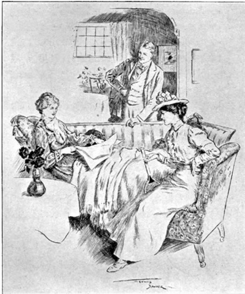
She positively and quietly settled down with the Buntings.

So far I have been very full, I know, and verisimilitude has been my watchword rather than the true affidavit style. But if I have made it clear to the reader just how the Sea Lady landed and just how it was possible for her to land and become a member of human society without any considerable excitement on the part of that society, such poor pains as I have taken to tint and shadow and embellish the facts at my disposal will not have been taken in vain. She positively and quietly settled down with the Buntings. Within a fortnight she had really settled down so thoroughly that, save for her exceptional beauty and charm and the occasional faint touches of something a little indefinable in her smile, she had become a quite passable and credible human being. She was a cripple, indeed, and her lower limb was most pathetically swathed and put in a sort of case, but it was quite generally understood--I am afraid at Mrs. Bunting's initiative--that presently they --Mrs. Bunting said "they," which was certainly almost as far or even a little farther than legitimate prevarication may go--would be as well as ever.