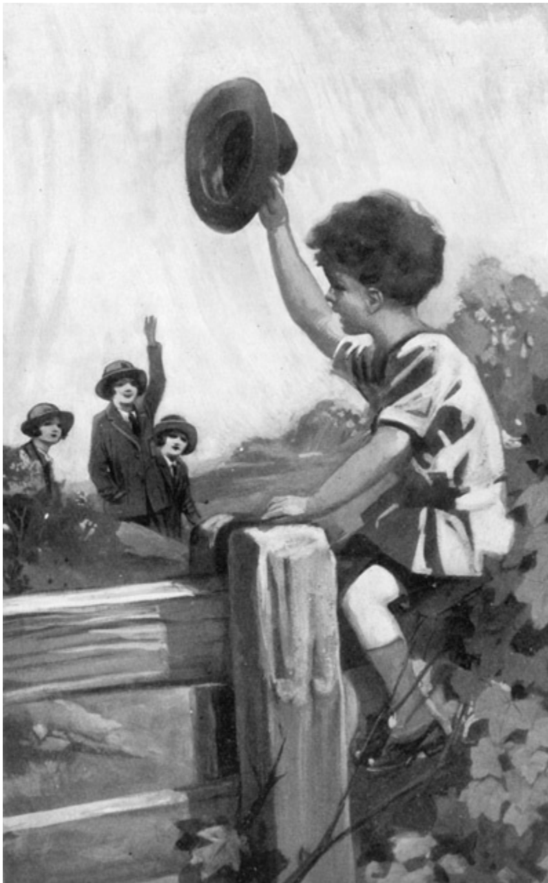
A SMALL BOY WAS WAVING HIS CAP IN FRANTIC WELCOME