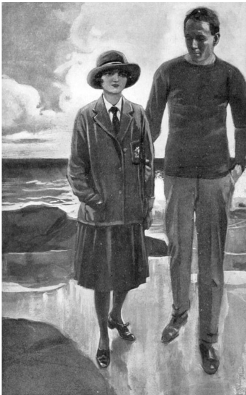
THE MAN APPEARED TO HAVE MANY DIRECTIONS TO GIVE