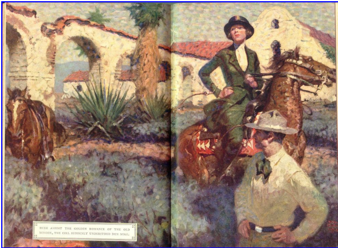
[Illustration: Here amidst the golden romance of the old mission, the girl suddenly understood Don Mike.]

While the Parkers returned to the hacienda to change into their riding-clothes, Miguel Farrel strolled over to the corral where Pablo Artelan, wearing upon his leathery countenance the closest imitation of a smile that had ever lighted that dark expanse, joined him and, with Farrel, leaned over the corral fence and gazed at the horses within. For a long time, neither spoke; then, while his glance still appraised the horses, Don Mike stiffened a thumb and drove it with considerable force into Pablo's ancient ribs. Carolina, engaged in hanging out the Parker wash in the yard of her casa , observed Don Mike bestow this infrequent accolade of approbation and affection, and her heart swelled with pride. Ah, yes; it was good to have the child back on the rancho again.