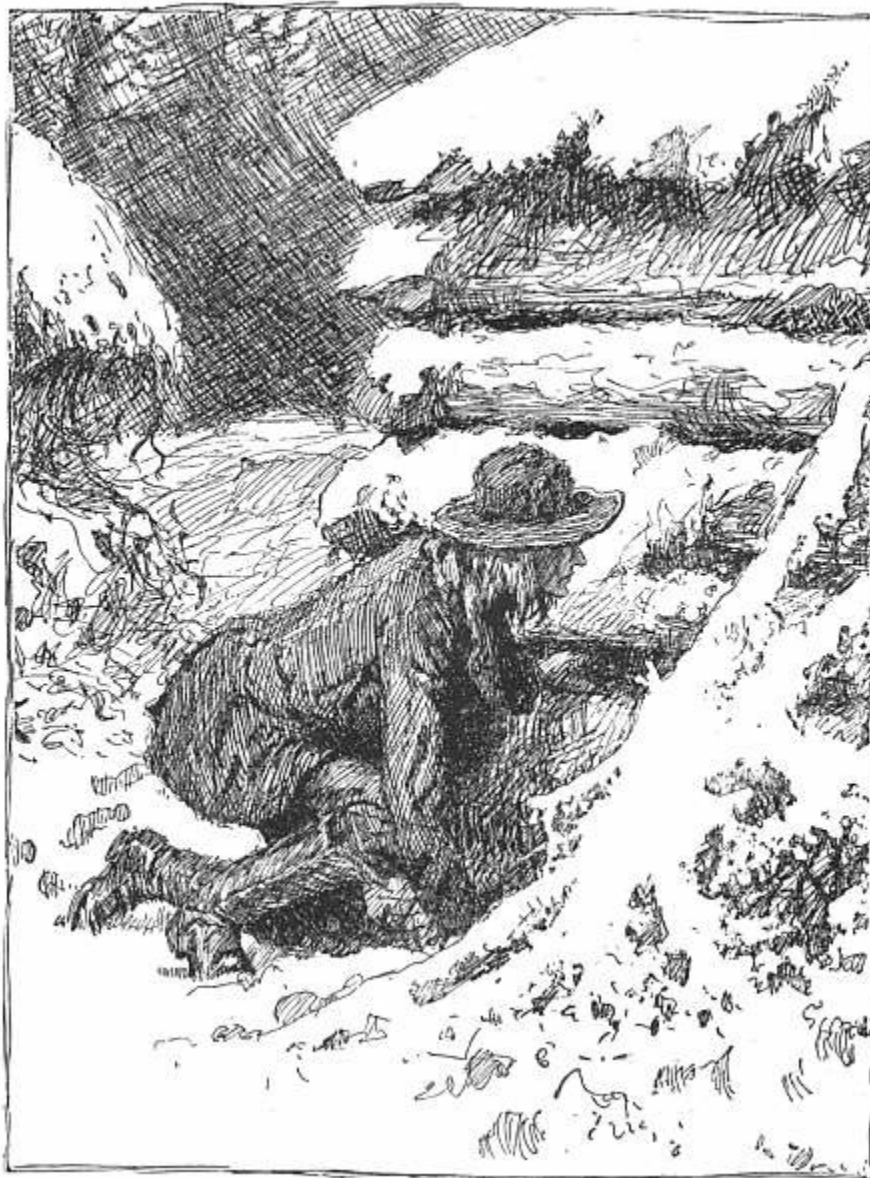
"HE STOLE NOISELESSLY IN THE SOFT SNOW"

Everything was deeply submerged in the snow before they reached the dark little cabin nestling in the Cove. Motionless and dreary it was; not even a blue and gauzy wreath curled out of the chimney, for the fire had died on the hearth in their absence. No living creature was to be seen. The fowls were huddled together in the hen-house, and the dogs had accompanied the family to town, trotting beneath the wagon with lolling tongues and smoking breath; when they nimbly climbed the fence their circular footprints were the first traces to mar the level expanse of the door-yard. The bare limbs of the trees were laden; the cedars bore great flower-like tufts amidst the interlacing fibrous foliage. The eaves were heavily thatched; the drifts lay in the fence corners.