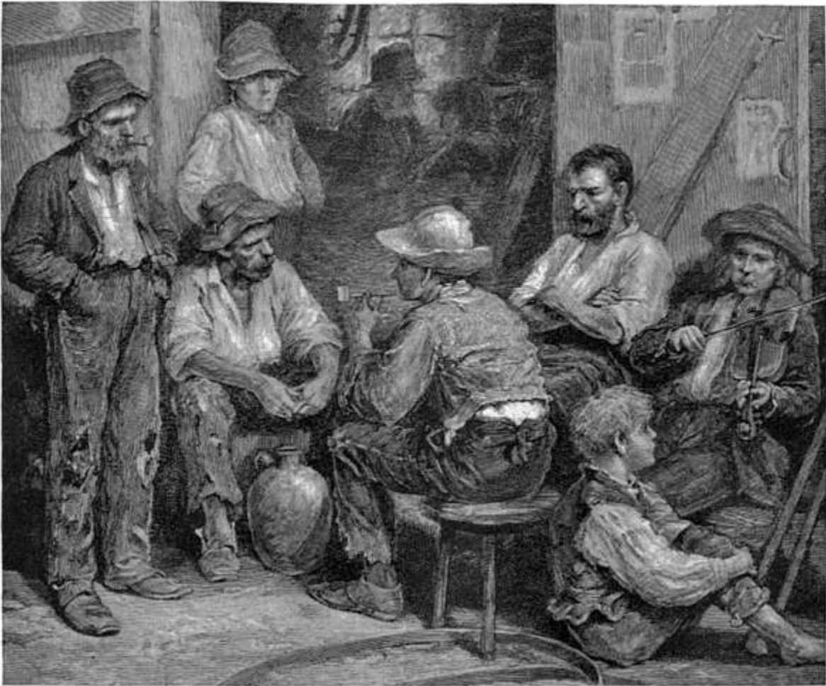
THE BLACKSMITH'S SHOP

Back of the cabin, which was situated on a limited terrace, the great altitudes of the mountain rose into the infinity of the night.