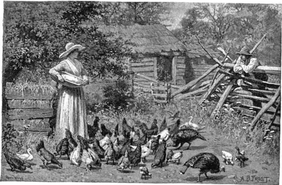
"WHY'NT YE GIN DAD THEM MESSAGES?"

But Steve was doubtful. "It be a powerful low-sperited gift fur them ez hev ter 'bide along of 'em. Eveliny never useter be tearful in nowise. Now she cries a heap mo' 'n that thar shoat"--his lips curled in contempt as he glanced toward the door, through which was visible a small rotund figure in pink calico, seated upon the lowest log of the wood-pile--"ez she fotched down hyar with her. He never hev hed a reg'lar blate but two or three times sence he hev been hyar, an' them war when that thar old tur-key gobbler teetered up ter him an' tuk his corn-dodger that he war a-eatin' on plumb out'n his hand. He hed suthin' to holler fur--hed los' his breakfus."