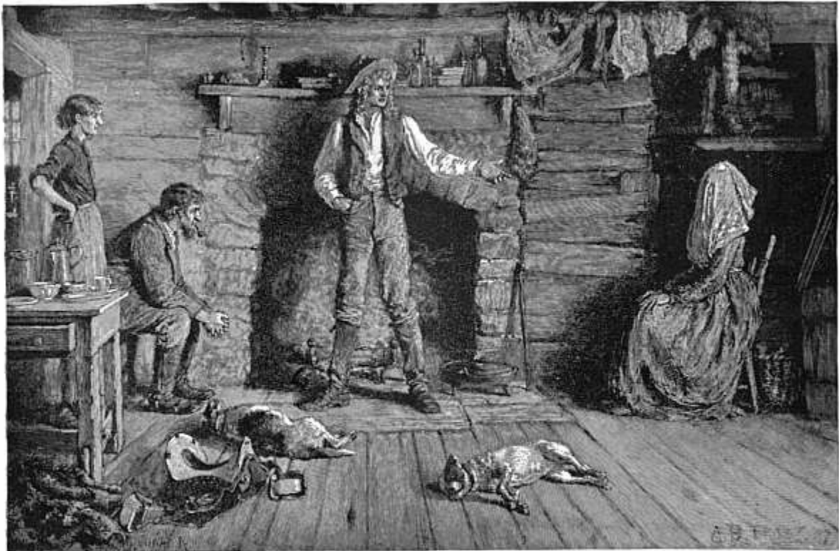
"SHE FLUNG HER APRON OVER HER HEAD"

"Eveliny," he quavered, at once flattered and furious, "dad-burned ef Abs'lom hain't gone an' got out a habeas corpus fur the baby!"