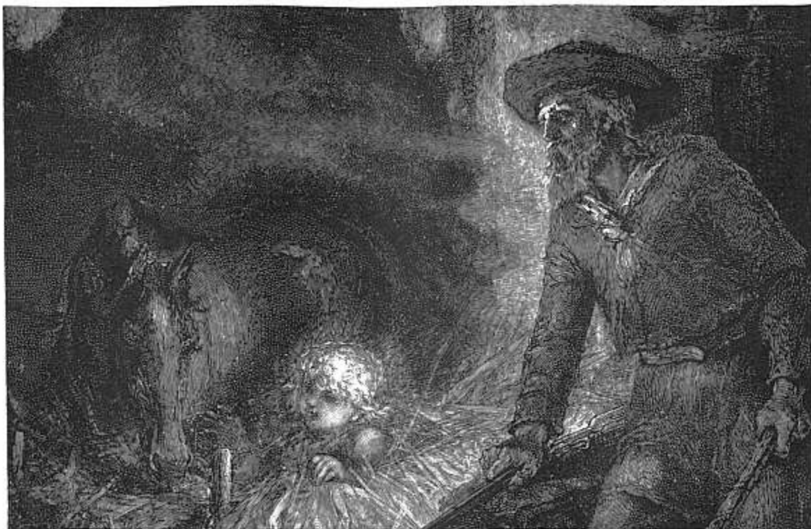
"YET THIS WAS CHRISTMAS EVE"

Perhaps it was well for him that his ignorant faith could accept the illusion as a vision charged with all the benignities of peace on earth, good-will toward men. With a keen thrill in his heart, on his knees he drew the charge from his rifle, and flung it down a rift in the rocks. "Chrismus Eve," he murmured.