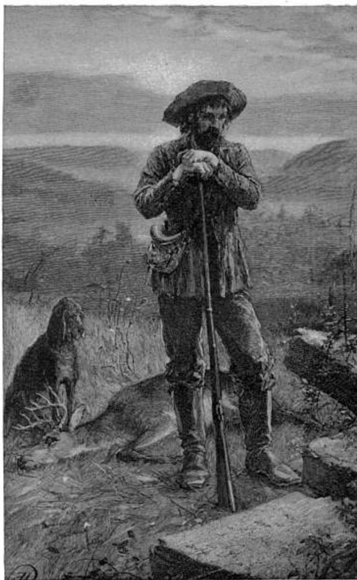
"THE TABLES OF THE LAW"

Alas! the corrugations of time, the fissile results of the frost; the wavering line of ripple-marks of seas that shall ebb no more; growth of lichen; an army of ants in full march; a passion-flower trailing from a crevice, its purple blooms lying upon the gray stone near where it is stamped with the fossil imprint of a sea-weed, faded long ago and forgotten. Or is it, alas! for the eyes that can see only this?