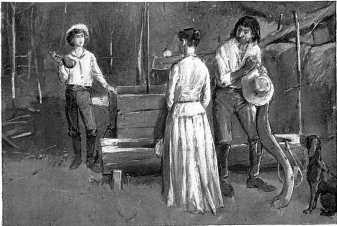
"HE HAD HAD AN ACTIVE DAY, INDUCING A KEEN THIRST"

"Mebbe he 'lows he mought make ye industrious an' git cornsider'ble work out'n ye," she faltered, flinching for him.