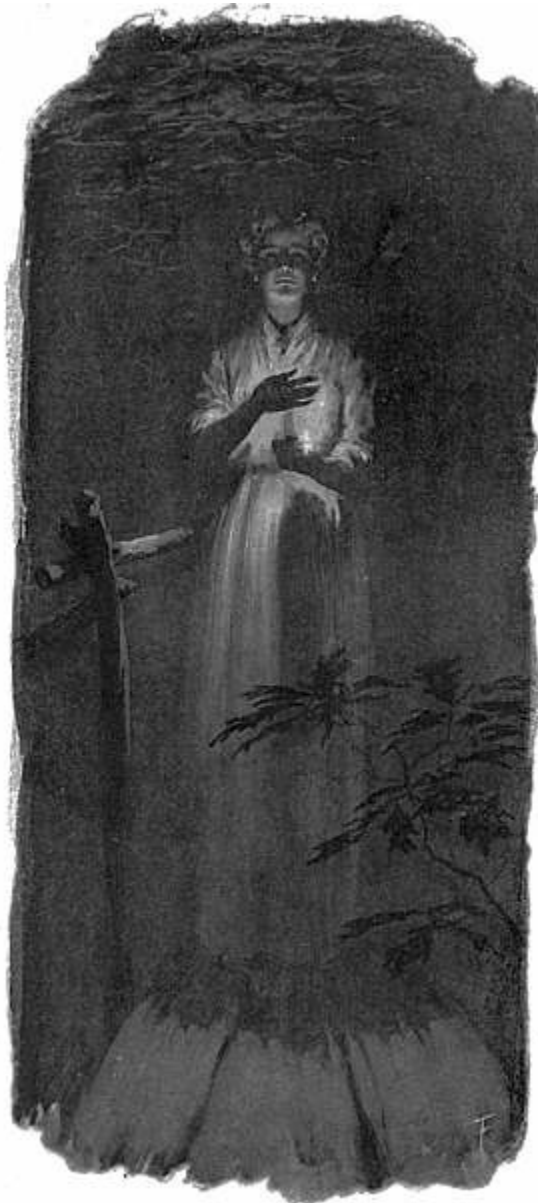
THE PHANTOM OF THE FOOT-BRIDGE

His companion looked with deepening interest at the bridge, although he followed his guide's surging pathway to the opposite bank. As the two dripping horses struggled up the steep incline he asked, "Did the man with her see the manifestation also?"