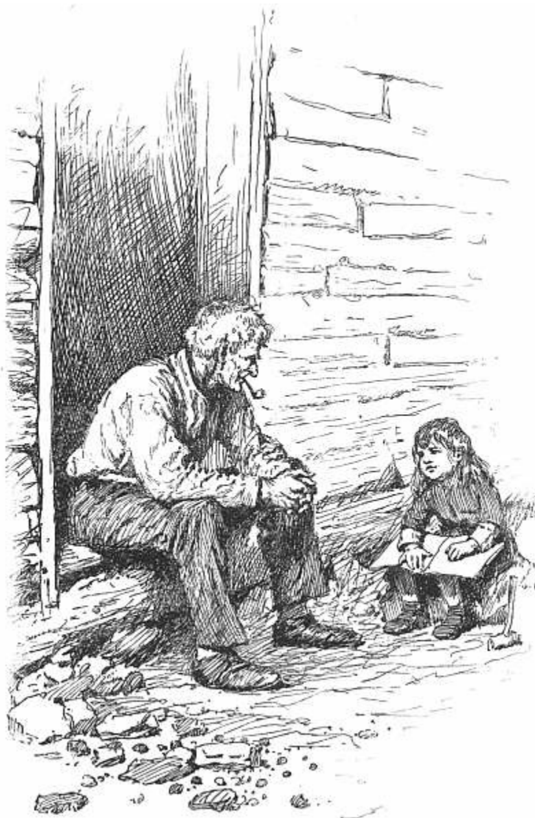
OLD QUIMBEY AND HIS GRANDSON

pommel of the saddle, lest Evelina should be out of her mind with fright because of his absence, how should he and old Mrs. Kittredge differ in their respective opinions of his vigorous growth, and grace of countenance, and peartness of manner? On the strength of this concurrence Tim was induced to "light an' hitch," and he even sat on the cabin porch and talked over the crops with Absalom, who, the next time he went to town, stopped at the cabin in the Cove to bring word how Elnathan Daniel was "thrivin'." The path that Evelina had worn to the crag in those first homesick days on the mountain rapidly extended itself into the Cove, and widened and grew smooth, as the grandfather went up and the grandson came down.