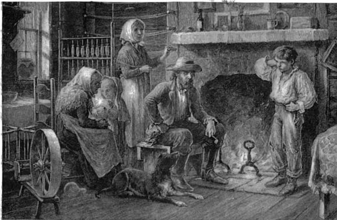
"WHAT WORD DID HE SEND TER--ME?"

The next moment he felt an infinite relief. He suddenly recognized the fact that he had been chiefly restrained from repeating the words by an unrealized terror lest they prove true--lest something his father claimed was not his, indeed.