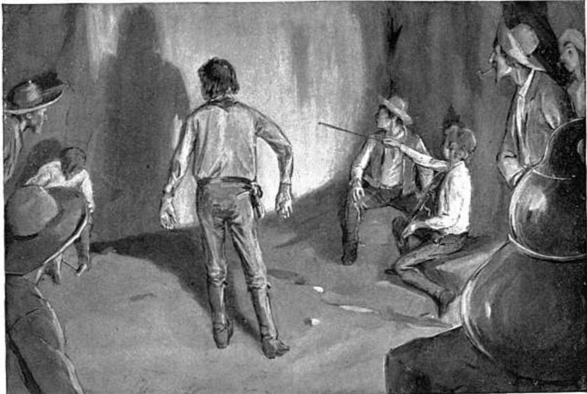
"LOOK OUT! SOMEBODY'S THAR!"

It was soon over. The whole occurrence, charged with all the definitiveness of fate, was scant ten minutes in transition. A laggard hoof-beat, a faint echo amidst the silent gathering of the moonlit mists, and the loud plaint of Hoho-hebee Falls were the only sounds that caught Nehemiah's anxious ear when he crept out from behind the empty barrels and tremulously took his way along the solitary ledges, ever and anon looking askance at his shadow, that more than once startled him with a sense of unwelcome companionship. The mists, ever thickening, received him into their midst. However threatening to the retreat of the raiders, they were friendly to him. Once, indeed, they parted, showing through the gauzy involutions of their illumined folds the pale moon high in the sky, and close at hand a horse's head just above his own, with wild, dilated eyes and quivering nostrils. Its effect was as detached as if it were only drawn upon a canvas; the mists rolled over anew, and but that he heard the subdued voice of the rider urging the animal on, and the thud of the hoofs farther away, he might have thought this straggler from the revenue party some wild illusion born of his terrors.