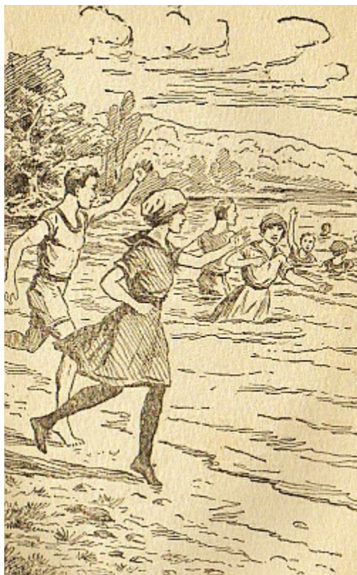
THEY RAN OUT INTO THE TEPID WATER.

"Let's run," suggested Mollie. "Somehow to-day I can't be sedate. I'll race everybody to the bank."