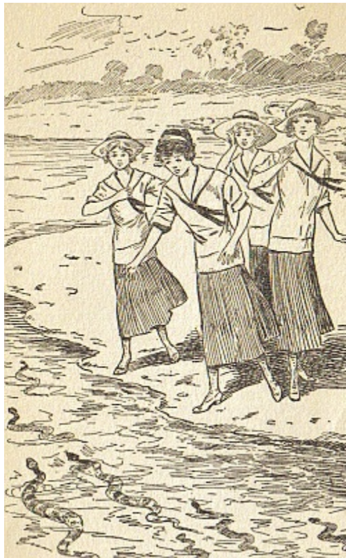
IN THE SHALLOW WATER OVER THE BAR WERE A NUMBER OF REPTILES.—Page 153.