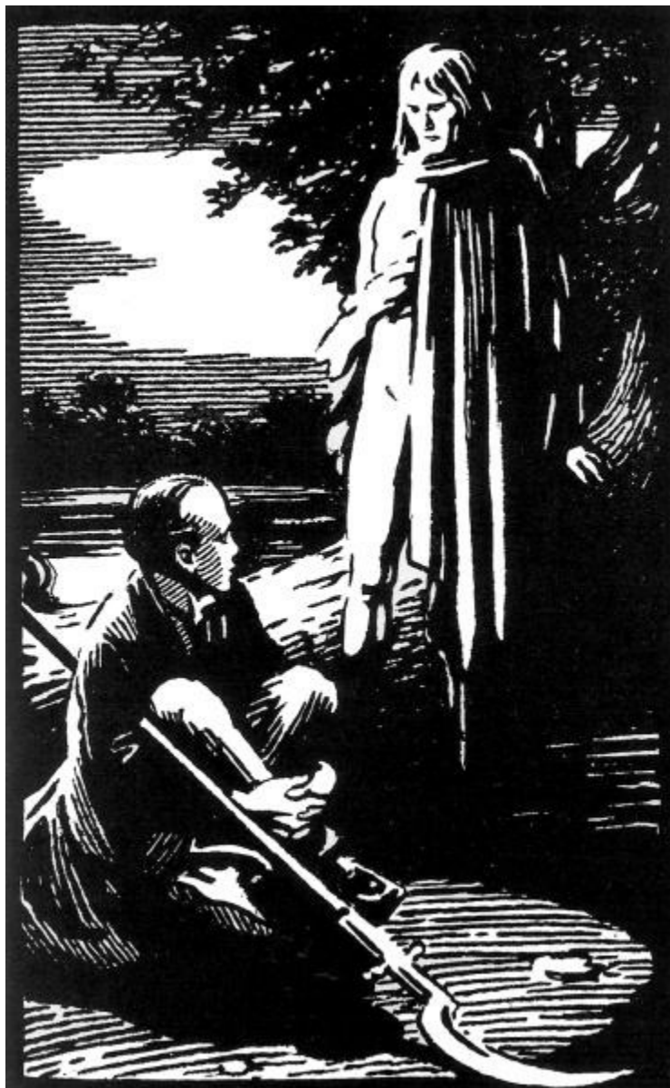
"WAYNE, IT WAS ALL A JOKE."

"Adam Wayne," it said, "there are men who confess only in articulo mortis ; there are people who blame themselves only when they can no longer help others. I am one of them. Here, upon the field of the bloody end of it all, I come to tell you plainly what you would never understand before. Do you know who I am?"