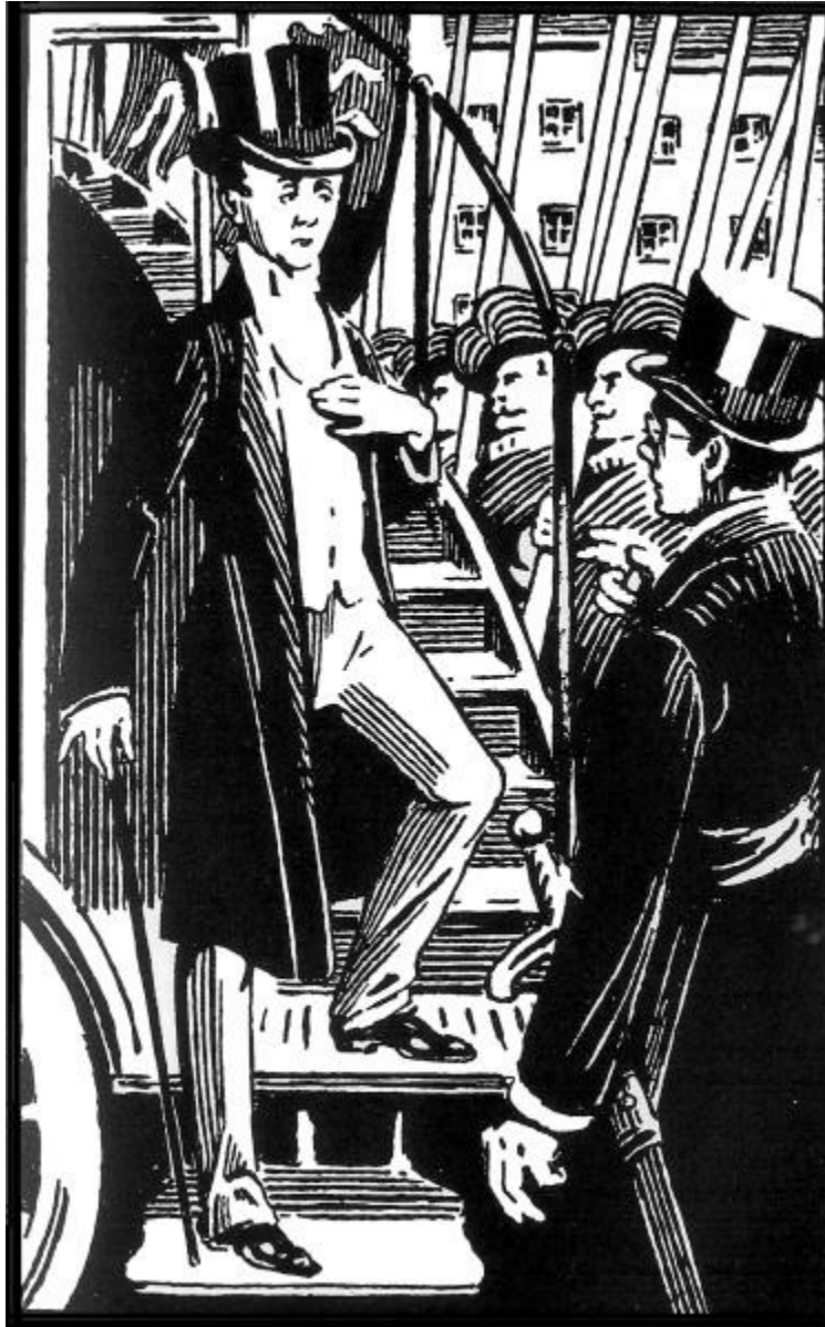
KING AUBERON DESCENDED FROM THE OMNIBUS WITH DIGNITY.

King Auberon descended from the omnibus with dignity. The guard or picket of red halberdiers who had stopped the vehicle did not number more than twenty, and they were under the command of a short, dark, clever-looking young man, conspicuous among the rest as being clad in an ordinary frock-coat, but girt round the waist with a red sash and a long seventeenth-century sword. A shiny silk hat and spectacles completed the outfit in a pleasing manner.