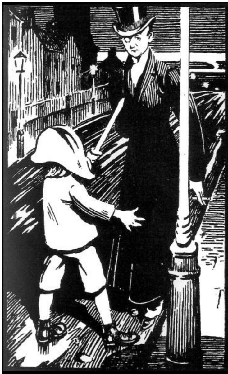
"I'M KING OF THE CASTLE."

"I will go," he said, "and mingle with the people."