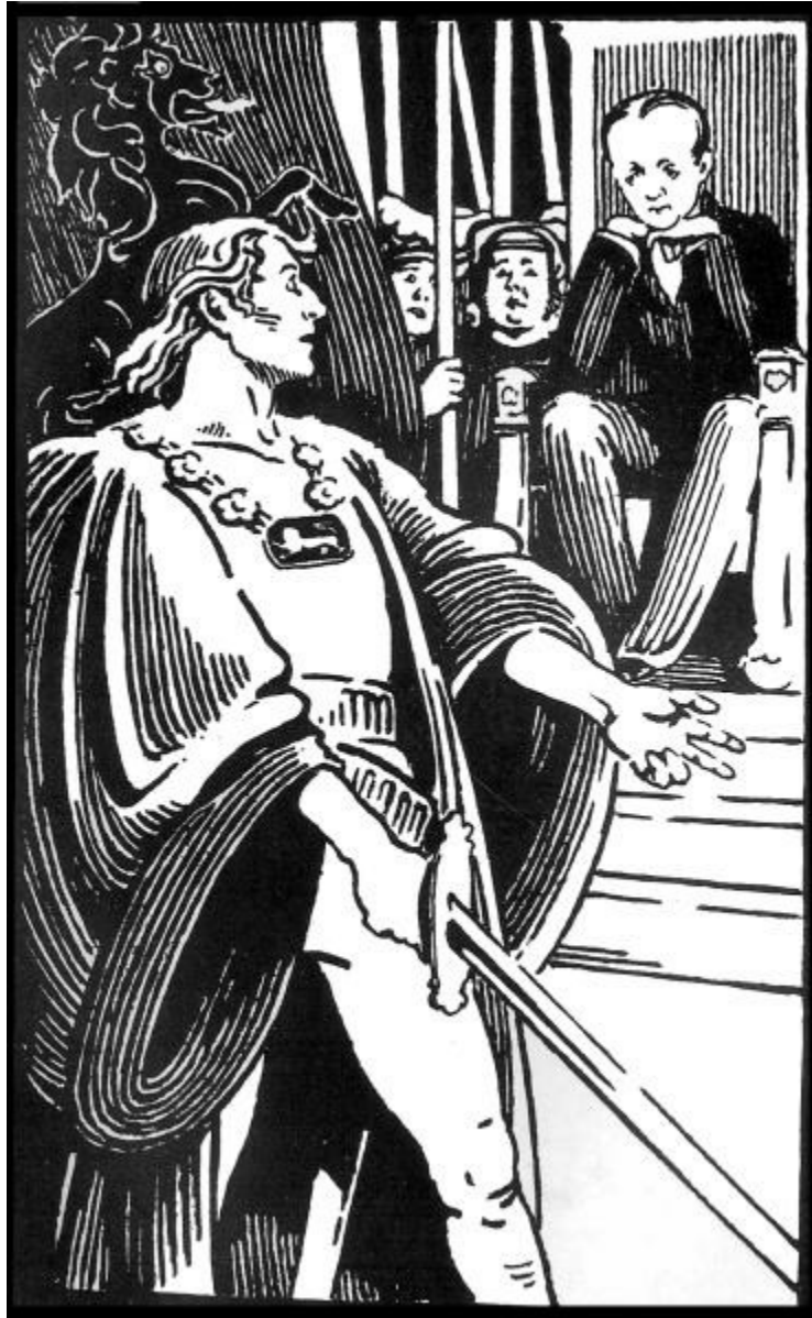
"I BRING HOMAGE TO MY KING."

The eyes of all five men stood out of their heads.