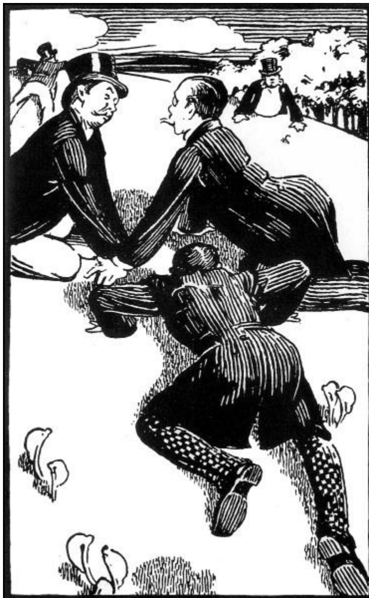
CITYMEN OUT ON ALL FOURS IN A FIELD COVERED WITH VEAL CUTLETS.