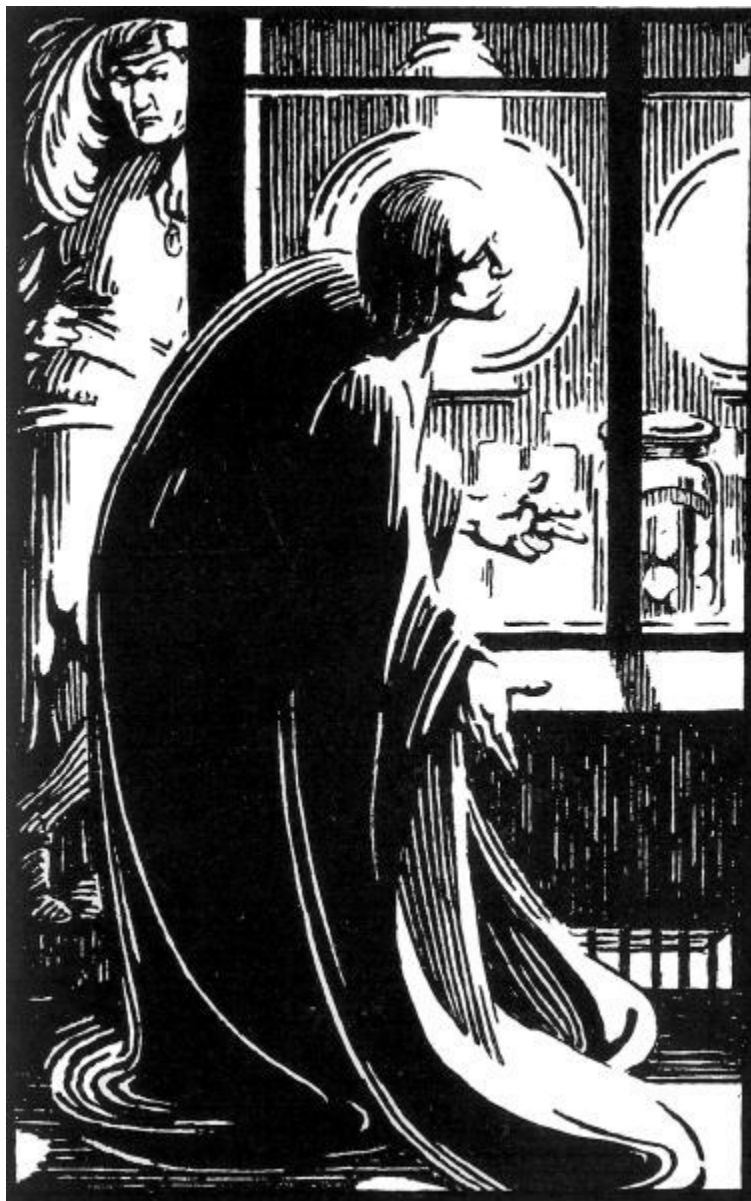
"A FINE EVENING, SIR," SAID THE CHEMIST.

"How uncommonly creepy this shop looks!" he said. "But yet somehow encouragingly creepy, invitingly creepy. It looks like something in a jolly old nursery story in which you are frightened out of your skin, and yet know that things always end well. The way those low sharp gables are carved like great black bat's wings folded down, and the way those queer-coloured bowls underneath are made to shine like giants eye-balls. It looks like a benevolent warlock's hut. It is apparently a chemist's."