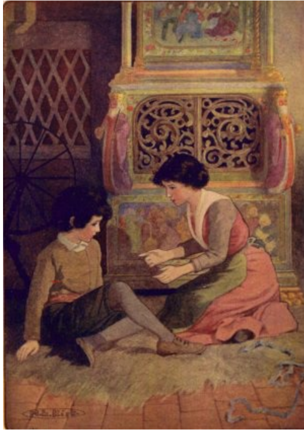
"IT IS A SIN, IT IS A THEFT, IT IS AN INFAMY," HE SAID