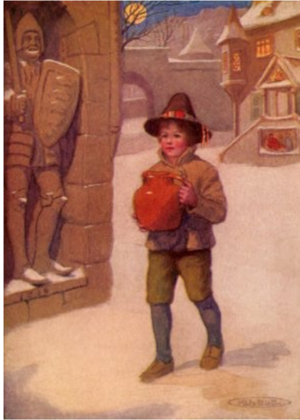
HE WENT ON THROUGH THE STREETS, PAST THE STONE MAN-AT-ARMS OF THE GUARD-HOUSE

He went on through the streets, past the stone man-at-arms of the guard-house, and so into the place where the great church was, and where near it stood his father, Karl Strehla's house, with a sculptured Bethlehem over the doorway, and the Pilgrimage of the Three Kings painted on its wall. He had been sent on a long errand outside the gates in the afternoon, over the frozen fields and the broad white snow, and had been belated, and had thought he had heard the wolves behind him at every step, and had reached the town in a great state of terror, thankful with all his little panting heart to see the oil-lamp burning under the first house-shrine. But he had not forgotten to call for the beer, and he carried it carefully now, though his hands were so numb that he was afraid they would let the jug down every moment.