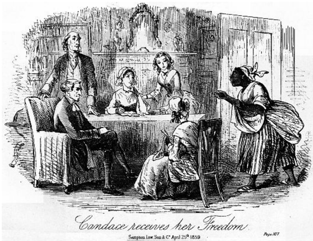
Candace receives her Freedom.

Candace stood still a moment, and the spectators saw a deeper shadow roll over her sable face, like a cloud over a dark pool of water, and her immense person heaved with her laboured breathing.