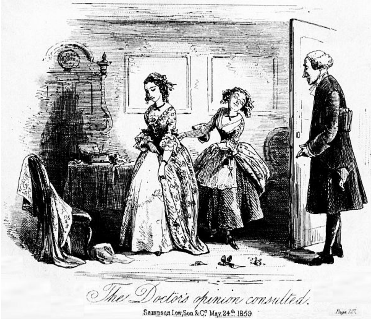
The Doctor's opinion consulted.

WELL, let us proceed to tell how the eventful evening drew on,—how Mary, by Miss Prissy's care, stood at last in a long-waisted gown flowered with rosebuds and violets, opening in front to display a white satin skirt trimmed with lace and flowers,—how her little feet were put into high-heeled shoes, and a little jaunty cap with a wreath of moss rosebuds was fastened over her shining hair,—and how Miss Prissy, delighted, turned her round and round, and then declared that she must go and get the Doctor to look at her. She knew he must be a man of taste, he talked so beautifully about the Millennium; and so, bursting into his study, she actually chattered him back into the visible world, and, leading the blushing Mary to the door, asked him, point blank, if he ever saw anything prettier.