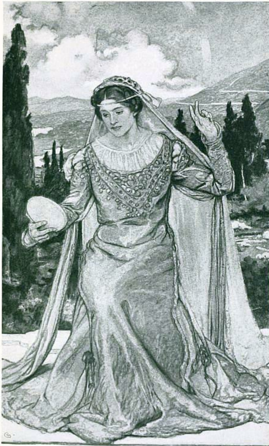
HER ONLY CARE WAS TO GAZE ALL DAY AT HER OWN FACE.