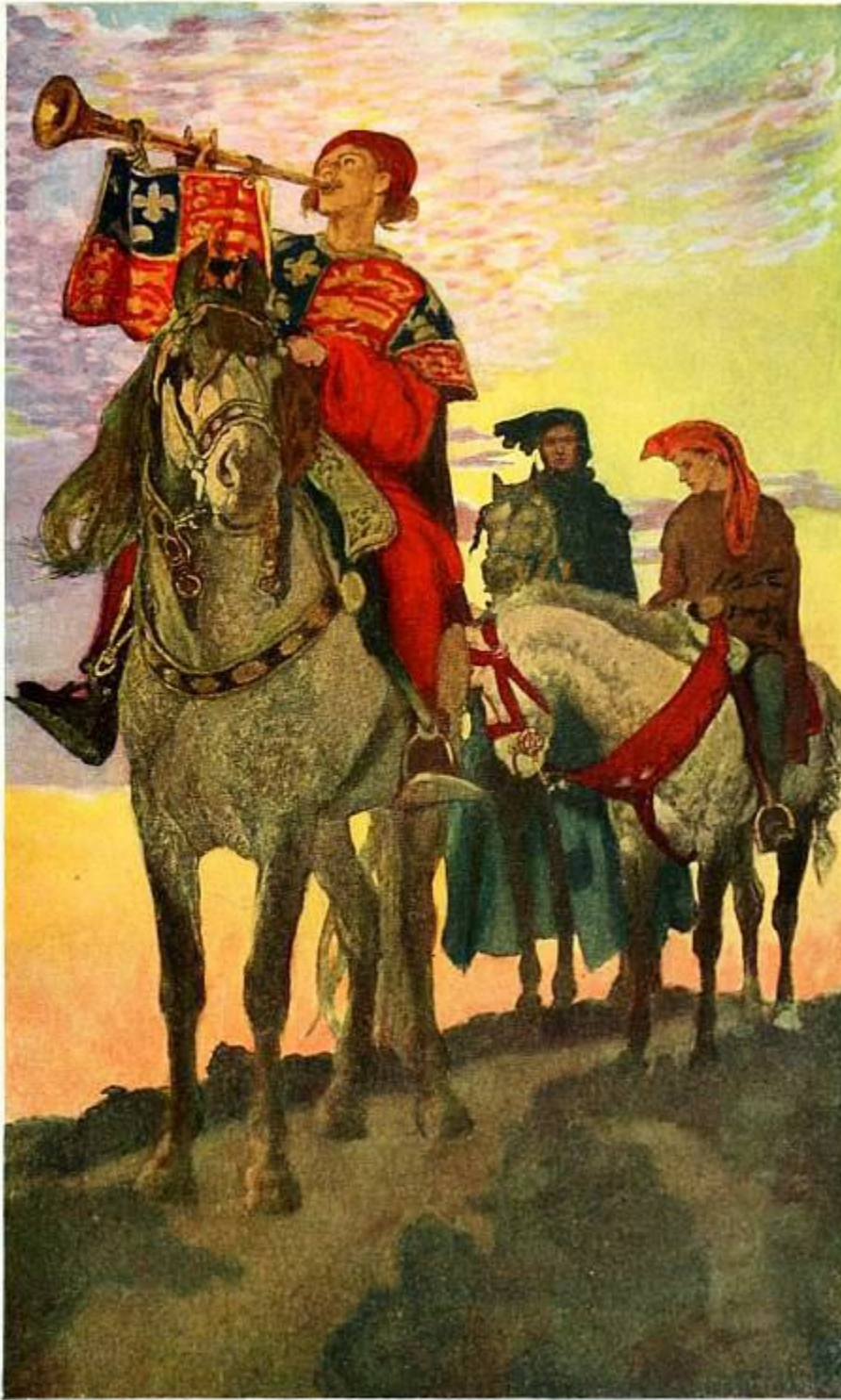
THE HERALD ONCE MORE SET THE TRUMPET TO HIS LIPS AND BLEW