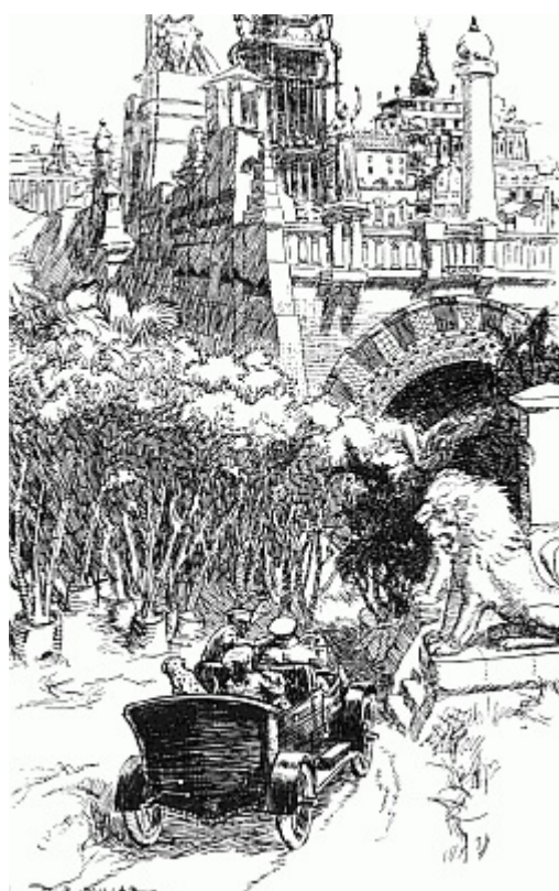
Philip felt that it was best to stop the car among the suburban groves of southernwood.

And so, at last, they came close to Polistopolis. Philip never could tell how it was that he stopped the car outside the city. It must have been some quite unaccountable instinct, because naturally, you know, when you are not used to being driven in motors, you like to dash up to the house you are going to, and enjoy your friends' enjoyment of the grand way in which you have travelled. But Philip felt--in that quite certain and quite unexplainable way in which you do feel things sometimes--that it was best to stop the car among the suburban groves of southernwood, and to creep into the town in the disguise afforded by motor coats, motor veils and motor goggles. (For of course all these had come with the motor car when it was wished for, because no motor car is complete without them.)