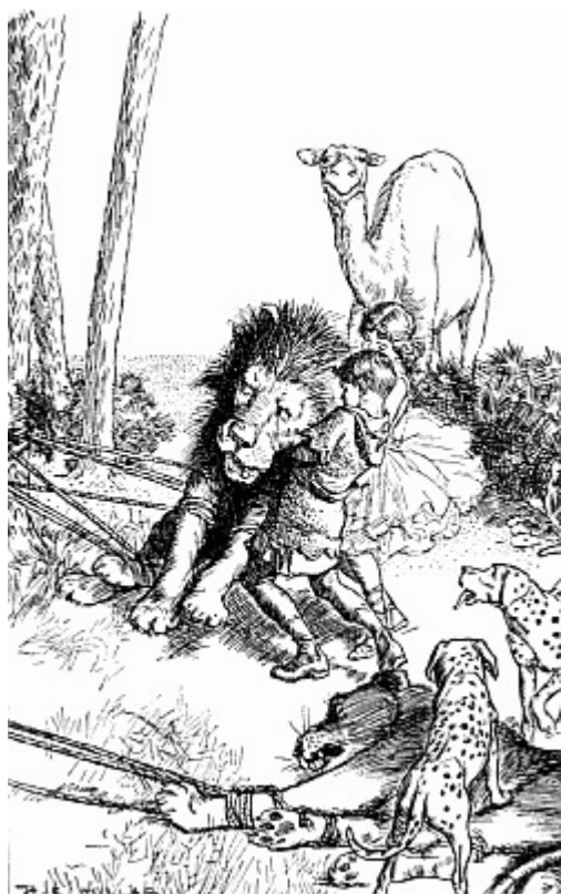
It was heavy work turning the lions over.

'They asked if you're sure the ropes will hold, and I've told them of course. So now they're going to begin. I only hope the paint won't make them ill.'