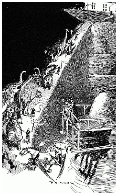
Along procession toiled slowly up it of animals in pairs.

'Are you frightened?' Lucy whispered, as he turned to go back to his overseeing.