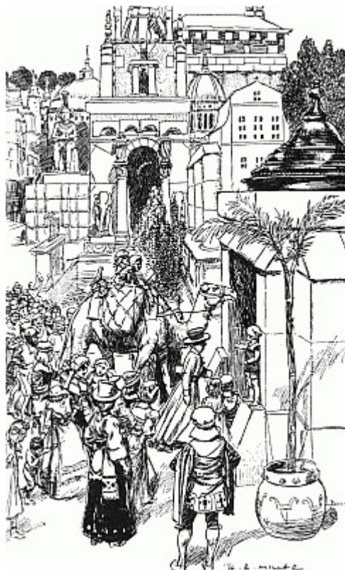
On the top of a very large and wobbly camel.

And presently dawn came, not slow and silvery as dawns come here, but sudden and red, with strong level lights and the shadows of the palm trees stretching all across the desert.