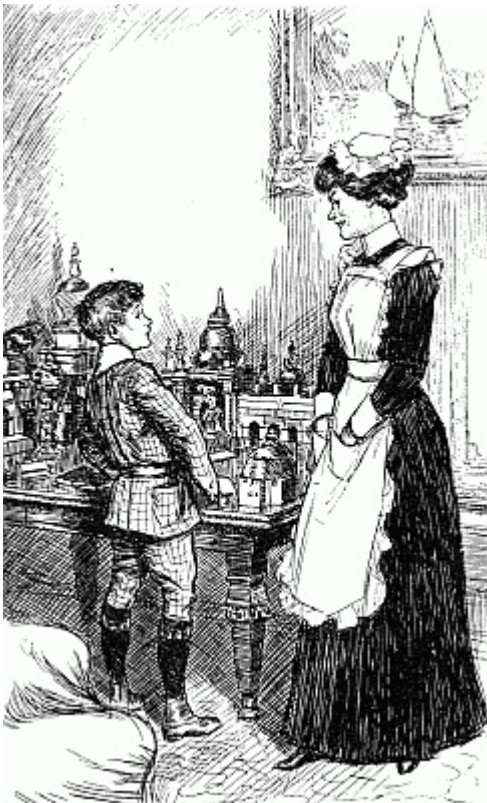
'Lor', ain't it pretty!' said the parlour-maid.

'Well, it's as good as a peep-show,' said the parlour-maid; 'it's just like them picture post-cards my brother in India sends me. All them pillars and domes and things--and the animals too. I don't know how you fare to think of such things, that I don't.'