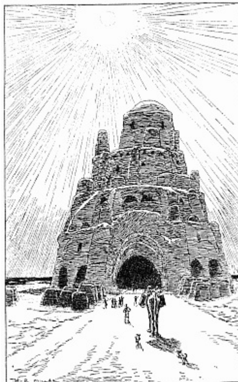
Slowly they came to the great gate of the castle.

'All the little animals in the Noah's ark that haven't any names,' the parrot told him. 'All those are considered fair