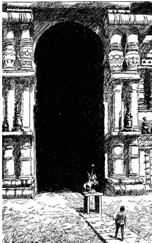
The gigantic porch lowered frowningly above him.