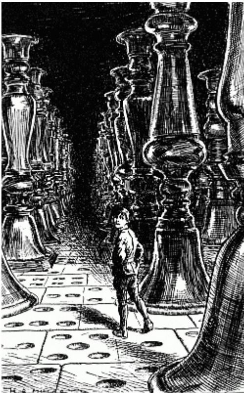
He walked on and on and on.

'But I'm tired and it's so lonely,' said Philip.