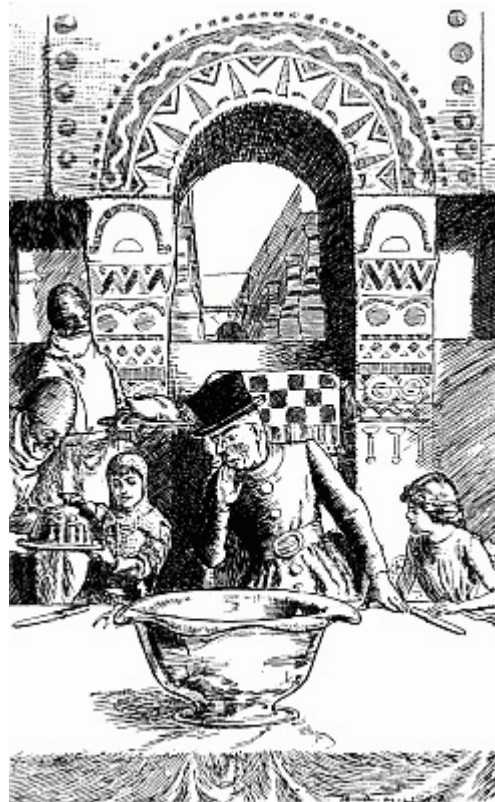
Mr. Noah whispered ardently, 'Don't!'

'Oh! I remember, Perrin told me,' said he.