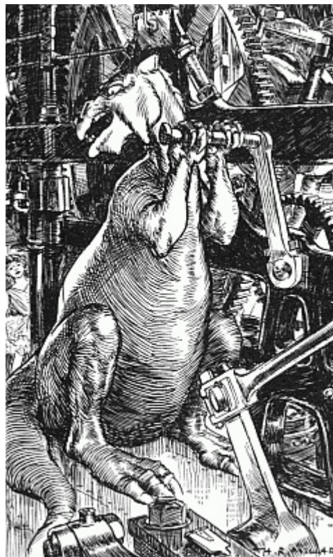
And all the while it had to go on turning that handle.

'It is,' said the oldest woman of all; 'very!'