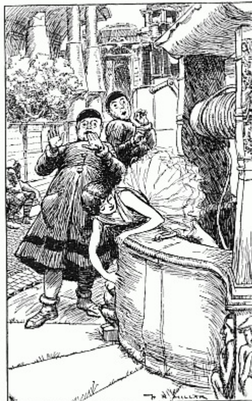
Lucy threw herself across the well parapet.

Lucy determined that they should hear that name pretty often; but before she could speak it again the woman