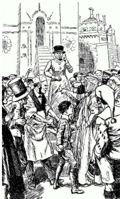
'Silence, trespasser,' said Mr. Noah, with cold dignity.

His first act was to go up to the top of the tower and look out to see if he could see the dragon. He looked east and north and south and west, and he saw the ramparts of the fort where Mr. Noah and the others were now safely bestowed. He saw also other towers and cities in the distance, and he saw the ruins where he had met Mr. Perrin.