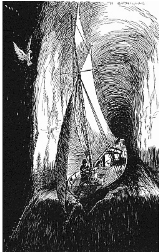
Plunged headlong over the edge.

And then there was silence in the cavern--only the rushing sound of the great waterfall echoed in the rocky arch.