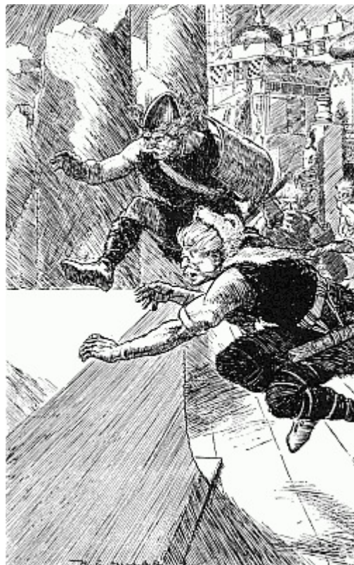
They leapt in and disappeared.

'You go too deep for me,' said Caesar, with the ghost of a smile. 'I now pronounce your sentence. But life has pronounced on you a sentence worse than any I can give you. Nobody loves you.'