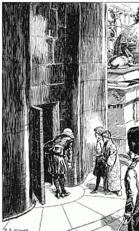
'Top floor, if you please,' said the gaoler politely.

'Of course I know it's magic,' said he impatiently; 'but it's quite real too.'