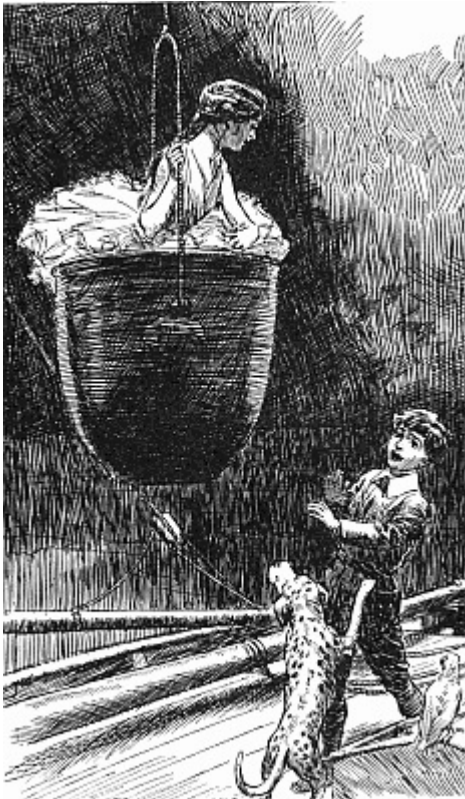
The bucket began to go up.

'I feel a little faint,' said the parrot; 'if some one would make a cup of cocoa.'