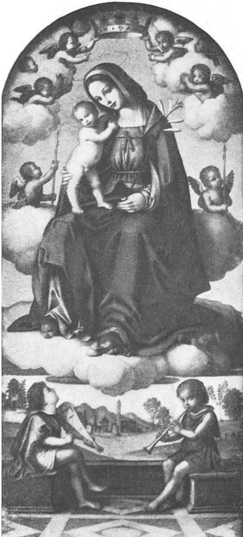
Umbrian School.—Glorification of the Virgin.

The Virgin appears in a cloud of cherub heads, or accompanied by a few child-angels. There are a few pictures in which