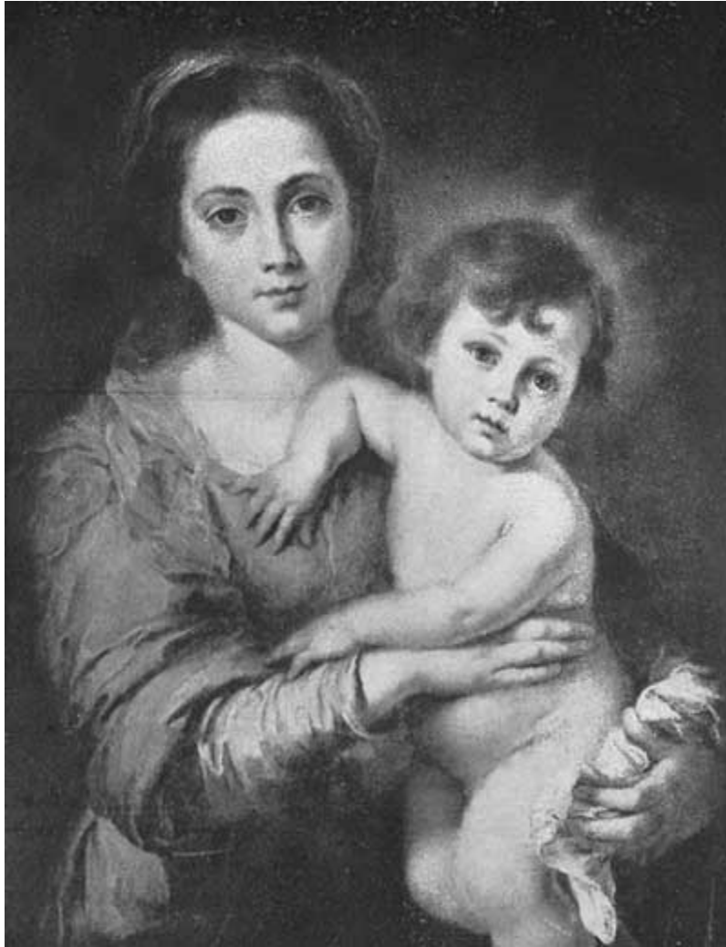
Murillo.—Madonna and Child.

It is a long leap from the fifteenth to the seventeenth centuries, taking us from a period of genuine religious fervor in art, into an age of artificial imitation. In the midst of the decadence of old ideals and the birth of art methods entirely new, arose one who seemed to be the reincarnation of the old spirit in a form peculiar to his age and race. This was Murillo, the peasant-painter of Spain, than whom was never artist more pious, not even excepting the angelic brother of San Marco. He alone in the seventeenth century kept alive the pure flame of religious fervor, which had burned within the devout Italians of the early school. Through all his pictures of the Virgin and child we can see that the Madonna as the Christ-bearer is the ideal he always has in view. He falls short of it, not through any lack of earnestness, but because his type of womanhood is incapable of expressing such lofty idealism. His virgins are modelled upon the simple Andalusian maidens, sweet, timid, dark-eyed creatures. Their faces glow with gentle affection as they look wistfully out of the picture, or raise their eyes to heaven, as if dimly discerning the heights which they have never reached.