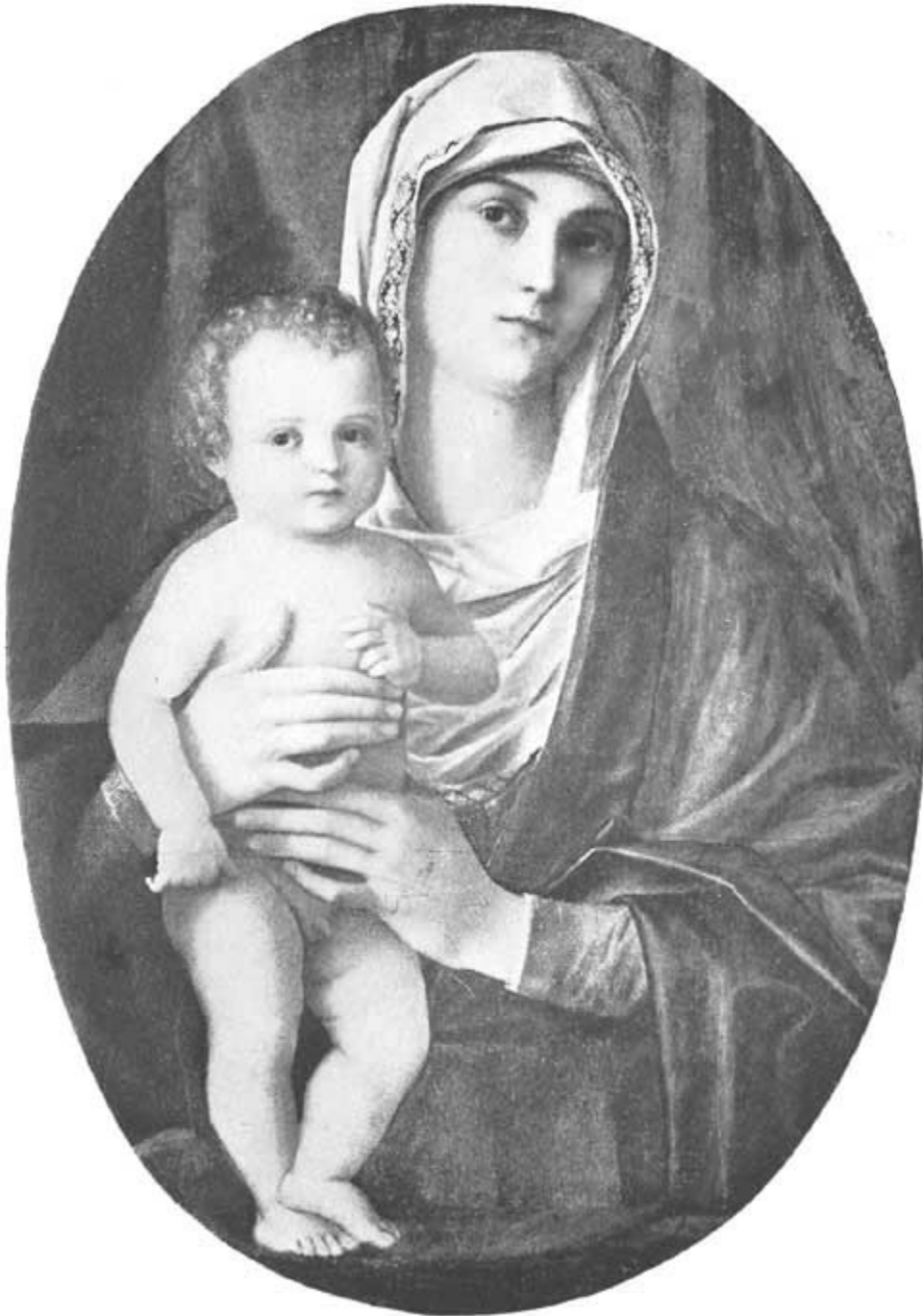
Giovanni Bellini.—Madonna between St. George and St. Paul. (Detail.)

The three enthroned Madonnas which have already been noticed are not less remarkable for religious significance. There is a peculiar freshness and vivacity in the San Giobbe picture. Both Virgin and child are alert and eager, welcoming the future with smiling and youthful enthusiasm.