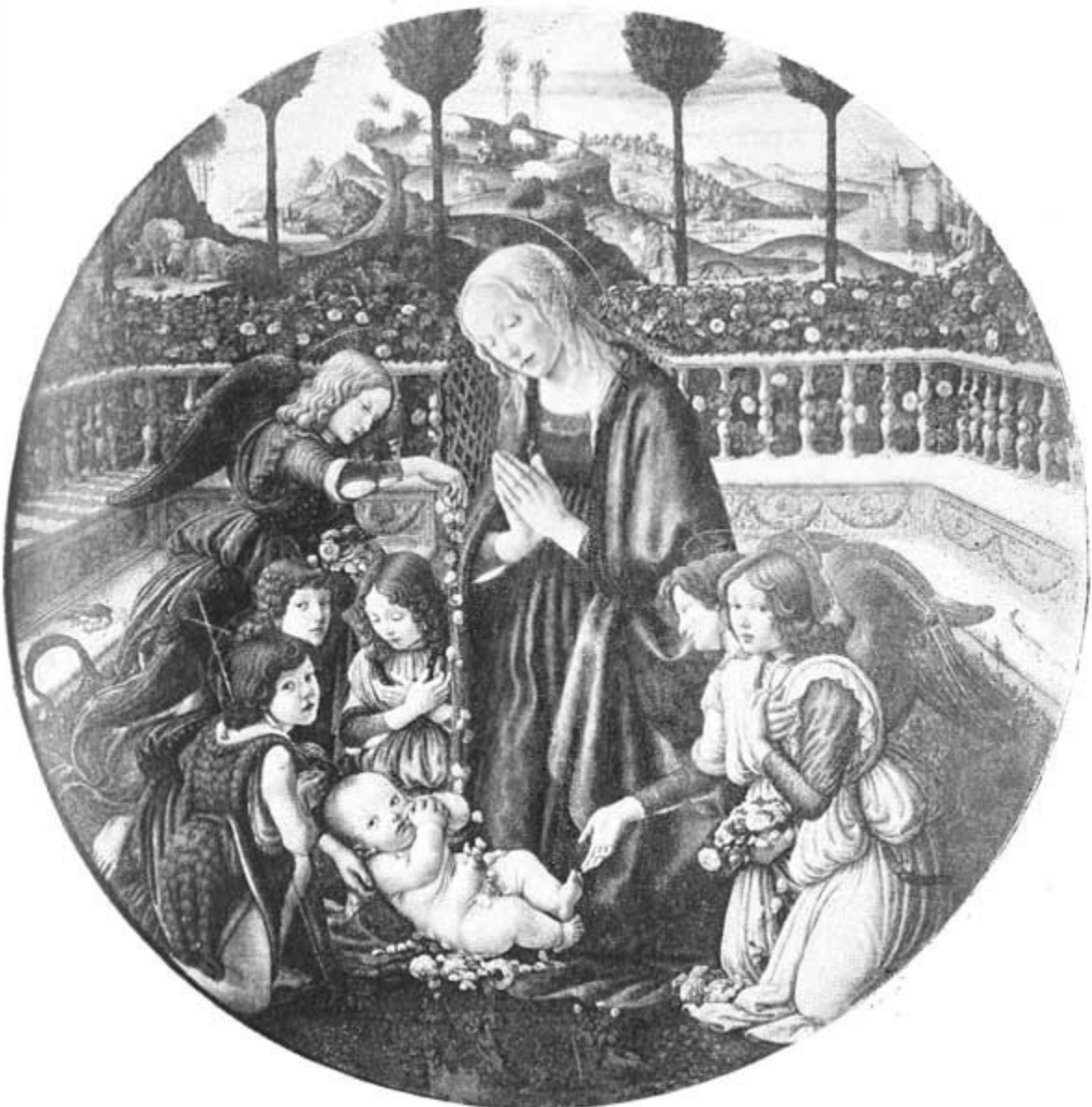
Filippino Lippi.—Madonna in a Rose Garden.

Of all schools of painting, the Venetian is the least translatable into black and white, so rich in colors is the palette which composed it. This is especially true of Palma, and to understand aright his Santa Conversazione, we must read into it the harmony of colors which it expresses, the chords of blue, red, brown, and green, the shimmering lights and brilliant atmosphere.