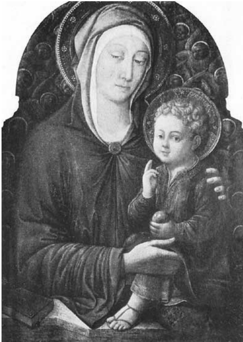
Jacopo Bellini.—Madonna and Child.

With the dawn of the Italian Renaissance, the old style of portrait Madonna passed out of vogue. More elaborate backgrounds were introduced from the growing resources of technique. In the fifteenth and sixteenth centuries, pictures of the portrait style were comparatively rare. Raphael, however, was not above adopting this method, as every lover of the Granduca Madonna will remember. His friend Bartolommeo also selected this style of composition for some of the loveliest of his works.