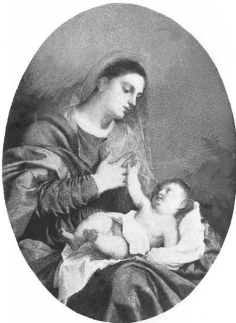
Titian.—Madonna and Saints. (Detail.)

See the Madonna of the Cherries in the Belvedere at Vienna, and the Madonna and Saints in the Dresden Gallery.