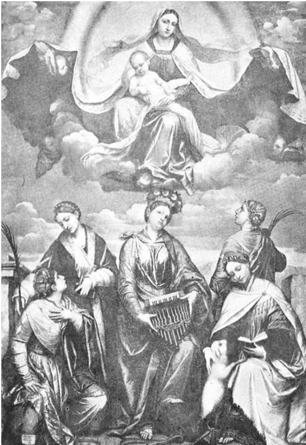
Moretto.—Madonna in Glory.

In the glorified Madonna of St. John the Evangelist, Brescia, the pyramidal effect is accentuated by curtains draped back on either side of the upper part of the composition. In the Madonna of San Giorgio Maggiore, at Verona, we have a much more attractive picture. The "gloria" encompassing the vision is clearly defined, giving so strong an effect of the supernatural that we cease to judge the composition by ordinary standards of natural law. The Virgin's white veil flutters from her head as if caught by some heavenly breeze. Her cloak floats about her by the same mysterious force, held in graceful festoons by winged cherub heads.