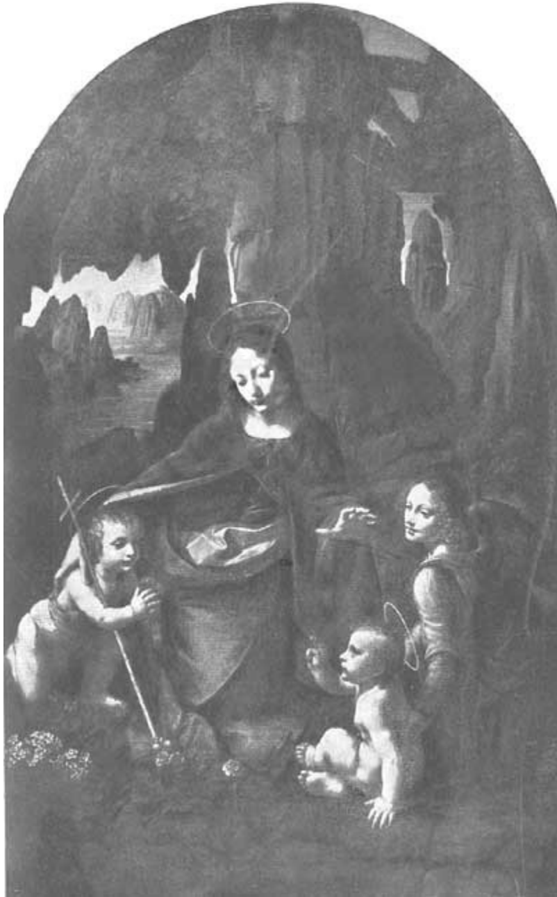
Leonardo da Vinci.--Maiden of the Rocks.

We do not need to be told, though the historian has taken pains to record it, that a feature of personal beauty by which Leonardo was always greatly pleased was "curled and waving hair." We see it in the first touch of his hand when, as a boy in the workshop of Verrochio, he painted the wavy-haired angel in his Master's Baptism; and here, again, in the Virgin, we find it the crowning element of her mysterious loveliness. We try in vain to penetrate the secret of her smile,--it is as evasive as it is enchanting. And herein lies the distinguishing difference between Leonardo and Raphael. The former is always mysterious and subtle; the latter is always frank and ingenuous. While both are true interpreters of nature, Leonardo reveals the rare and inexplicable, Raphael chooses the typical and familiar. Both are possessed of a strong sense of the harmony of nature with human life. The smile of the Virgin of the Rocks is a part of the mystery of her shadowy environment; [2] the serenity of the Madonna in the Meadow belongs to the atmosphere of the open fields.