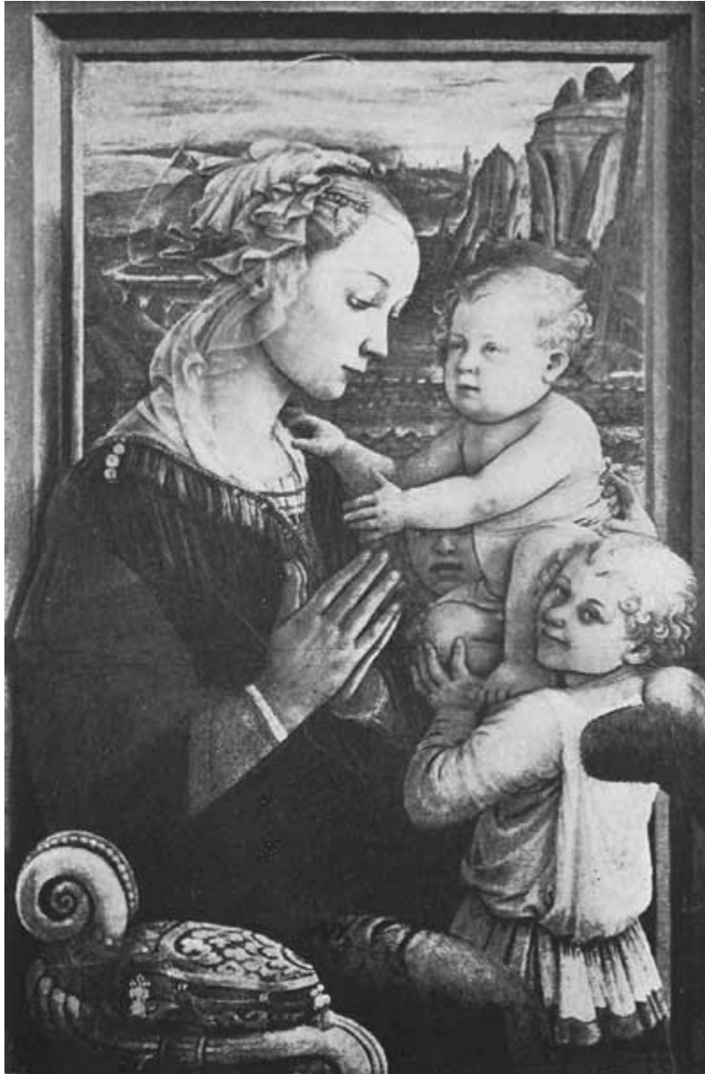
Filippo Lippi.--Madonna in Adoration.

rules of art laid down by ecclesiastical authorities. They insist that his business is "to the souls of men," and that it is "quite from the mark of painting" to make "faces, arms, legs, and bodies like the true." On his part, he claims that it will not help the interpretation of soul, by painting body ill. An intense lover of every beautiful line and color in God's world, he believes that these things are given us to be thankful for, not to pass over or despise. Obligated to devote himself to a class of subjects with which he had little sympathy, he compromised with his critics by adopting the traditional forms of composition, and treating them after the manner of genre painters, in types drawn from the ordinary life about him. The kneeling Madre Pia he painted three times: two of the pictures are in the Florence Academy, and the third and best is in the Berlin Gallery.