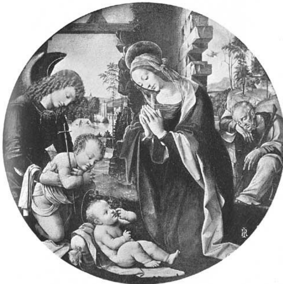
Lorenzo di Credi.—Nativity.

Passing from the sculpture of Florence to its painting, it is fitting that we mention first of all the friend and fellow-pupil of the Umbrian Perugino, Lorenzo di Credi. The two had much in common. Trained together in the workshop of the sculptor Verrocchio, in those days of intense religious stress, they both became followers of the prophet-prior of San Marco, Savonarola. Their religious earnestness naturally found expression in the beautiful subject of the Madre Pia . The Florentine artist, though not less devout than his friend, introduces into his work an element of joy, characteristic of his surroundings, and more attractive than the somewhat melancholy types of Umbria. His Adoration , in the Uffizi, is an admirable example of his best work. Following the fashion made popular by the Della Robbias, the artist chose for his composition the round picture, or tondo . By this elimination of unnecessary corners, the attention centres in the beautiful figure of the Virgin, which occupies a large portion of the circle. In exquisite keeping with the modest loveliness of her face, a delicate, transparent veil is knotted over her smooth hair, and falls over the round curves of her neck. In expression and attitude she is the perfect impersonation of the spirit of humility, joyfully submissive to her high calling, reverently acknowledging her unworthiness.