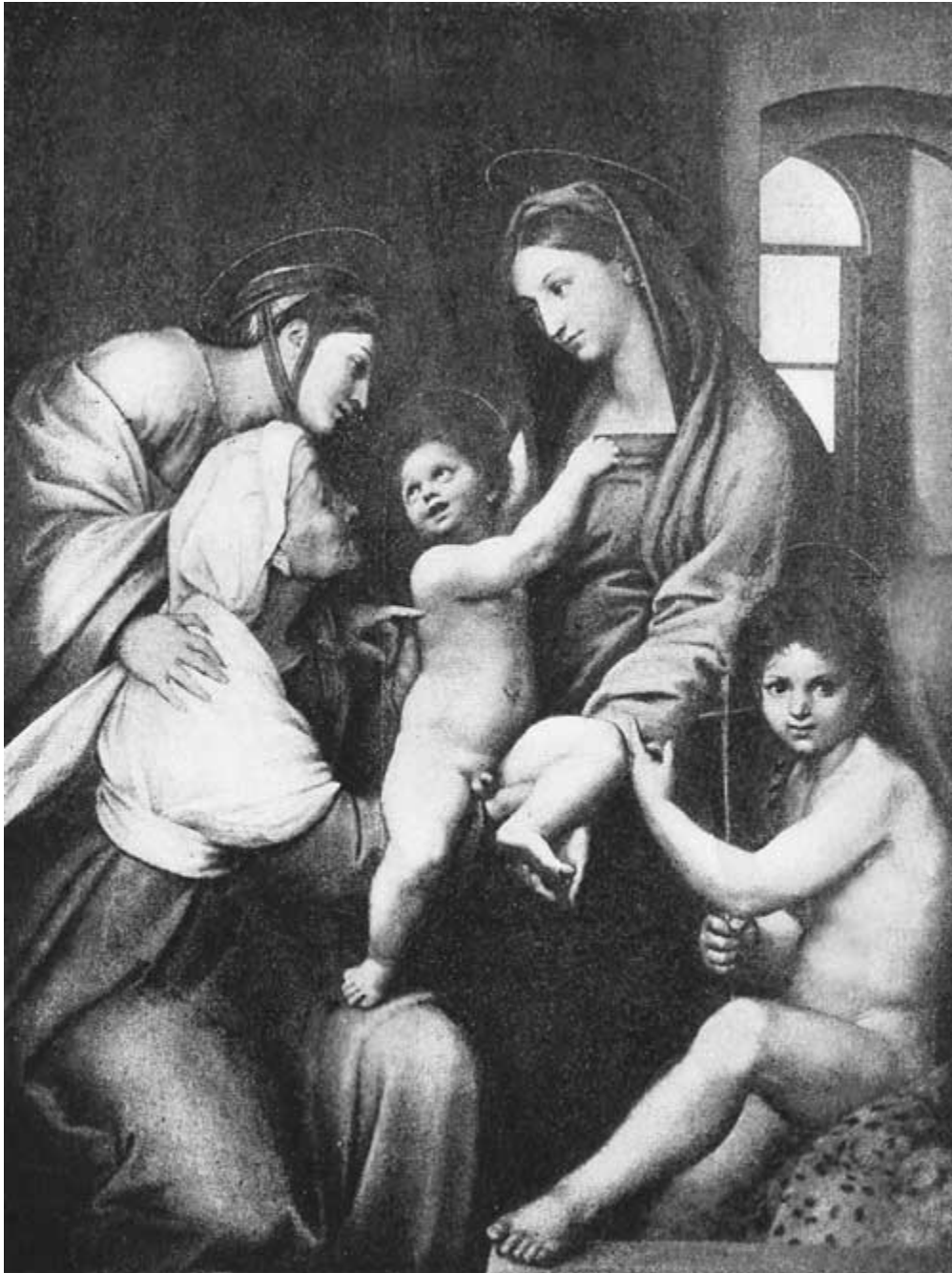
Raphael.—Madonna dell' Impannata.

Schongauer's work belongs to the latter part of the fifteenth century, and there was nothing similar to it in Italy at the same period. It is true that Madonnas in domestic settings have been attributed to contemporaneous Italians, but they were probably by some Flemish hand.