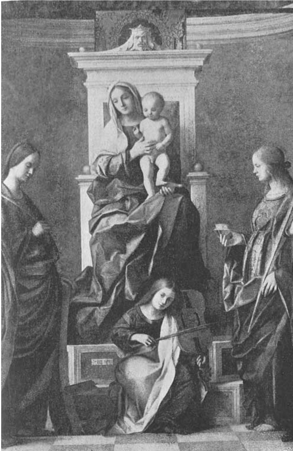
Giovanni Bellini.—Madonna of San Zaccaria. (Detail.)

The San Zaccaria Madonna was painted when Bellini was over eighty years old, and has certain technical qualities surpassing any the artist had previously attained. The depth of light and shade is particularly remarkable; the colors rich and harmonious. The attendant saints are St. Lucy on the right, a pretty blonde girl, with St. Jerome beyond her, absorbed in his Bible; opposite, stand St. Catherine, pensively looking down, and St. Peter, in profound meditation. The entire picture, both in conception and execution, may be considered a representative example of the times.