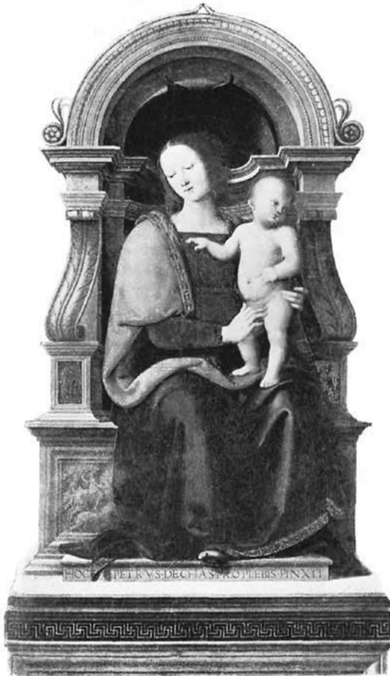
Perugino.—Madonna and Saints. (Detail.)

Bartolommeo was specially successful in the subject of the enthroned Madonna, having fine gifts of composition united with profound religious earnestness. The great picture in the Pitti gallery at Florence may serve as a typical example. Andrea del Sarto's chef-d'oeuvre --the Madonna di San Francesco (Uffizi)--may also be assigned to this class, although the arrangement is entirely novel. The Virgin, holding the babe in her arms, stands on a sort of pedestal, carved at the corners with a design of harpies, from which the picture is often known as the Madonna of the Harpies. The pedestal throne is also seen in two of Correggio's Dresden pictures, but here the Virgin is seated, with the child on her lap. An exceedingly simple throne Madonna is that of Luini, in the Brera at Milan, where the Virgin sits on a plain coping not at all high.