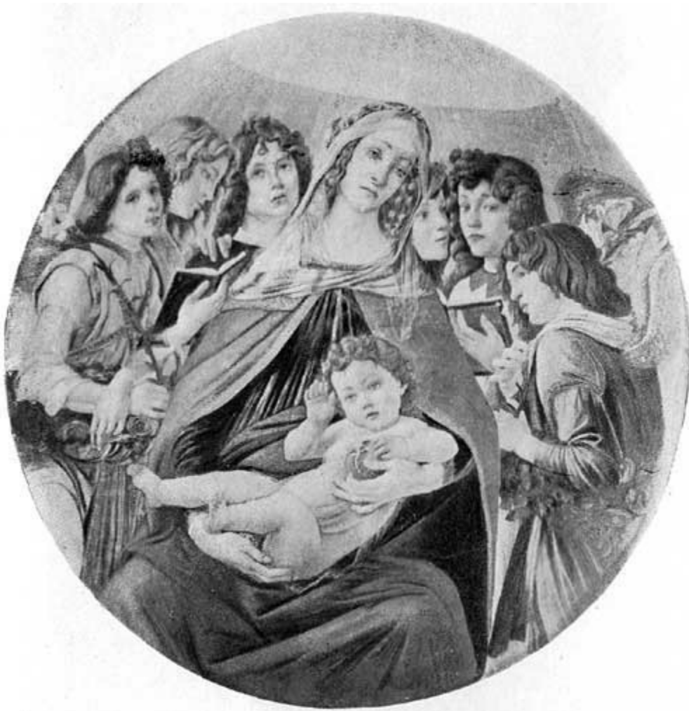
Botticelli.—Madonna of the Pomegranate.

Her face is inexpressibly sad, and the child shares her mood, as he raises his little hand to bless the spectator. Two angels bear the Virgin's flowers, roses and lilies; two others hold books. They bend towards the queen as the petals of a rose bend towards the centre, with the serious grace peculiar to Botticelli.