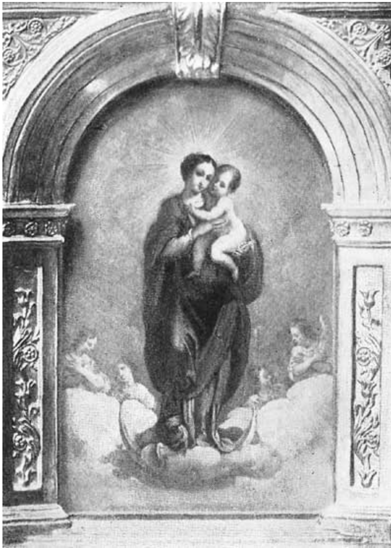
Spanish School.—Madonna on the Crescent Moon.