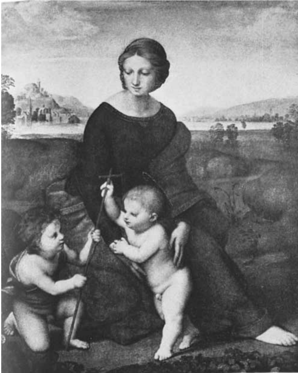
Raphael.—Madonna in the Meadow.

Almost identical in general style of composition, the three pictures show many points of dissimilarity when we come to a closer study of the figures. Considered as a type of womanly beauty, the Belle Jardiniere is perhaps the most commonplace of the three Virgins, or, to put it negatively, the least attractive. She is distinctly of the peasant class, gentle, amiable, and entirely unassuming. The Madonna in the Meadow is a maturer woman, more dignified, more beautiful. The smooth braids of her hair are coiled about the head, accentuating its lovely outline. The falling mantle reveals the finely modelled shoulders. The Madonna of the Goldfinch is a still higher type of loveliness, uniting with gentle dignity a certain delicate, high-bred grace, which Raphael alone could impart. Her face is charmingly framed in the soft hair which falls modestly about it. One wonders if any modern coiffeur could invent so many styles of hair dressing as does this gifted young painter of the sixteenth century.