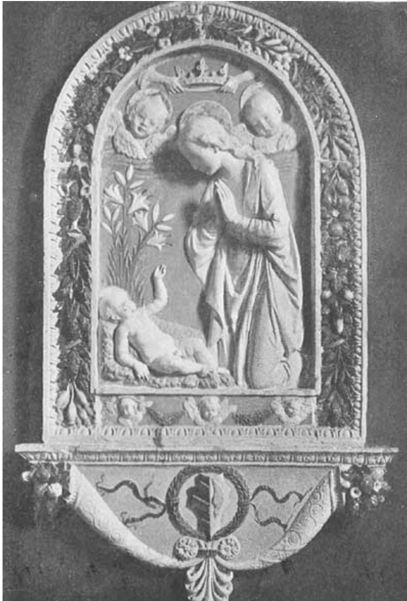
Andrea della Robbia.--Madonna in Adoration.

We may see all this in the popular tabernacle which he designed, and of which there are at least five, and probably more, copies. The Madonna kneels prayerfully before her babe, who lies on the ground by some lily stalks. In the sky above are two cherubim and hands holding a crown. There is a girlish grace in the kneeling figure, and a rare sweetness in the face, entirely free from sentimentality. A severe simplicity of drapery, and the absence of all unnecessary accessories, are points of excellence worth noting. The composition was sometimes varied by the introduction of different figures in the sky, other cherubim, or the head of the Almighty, with the Dove.