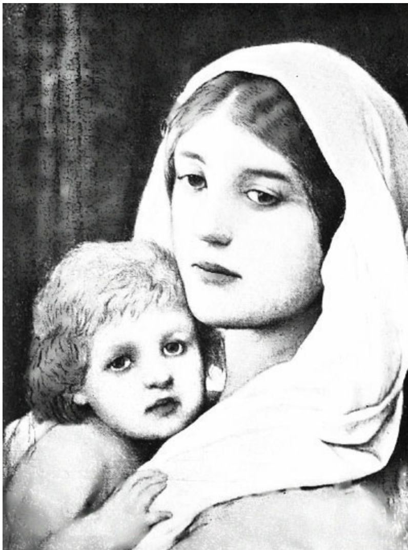
Gabriel Max.--Madonna and Child.

Stirling-Maxwell, in "Annals of the Artists of Spain."