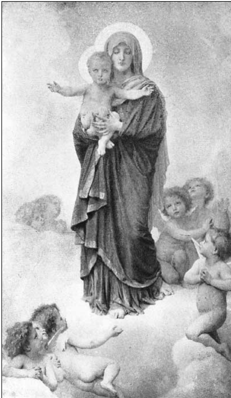
Bouguereau.—Madonna of the Angels.

After the time of Raphael, a pretty form of Madonna in glory was occasionally painted, showing the Virgin with her babe sitting above the crescent moon. The conception appears more than once in the paintings of Albert Durer, and later, artists of all schools adopted it. Sassoferrato's picture in the Vatican Gallery is a popular example. Tintoretto's, in Berlin, is not so well known. In the Dresden Gallery is a work, by an unknown Spanish painter of the seventeenth century, differing from the others in that the Virgin is standing, as in the oft-repeated Spanish pictures of the Immaculate Conception.