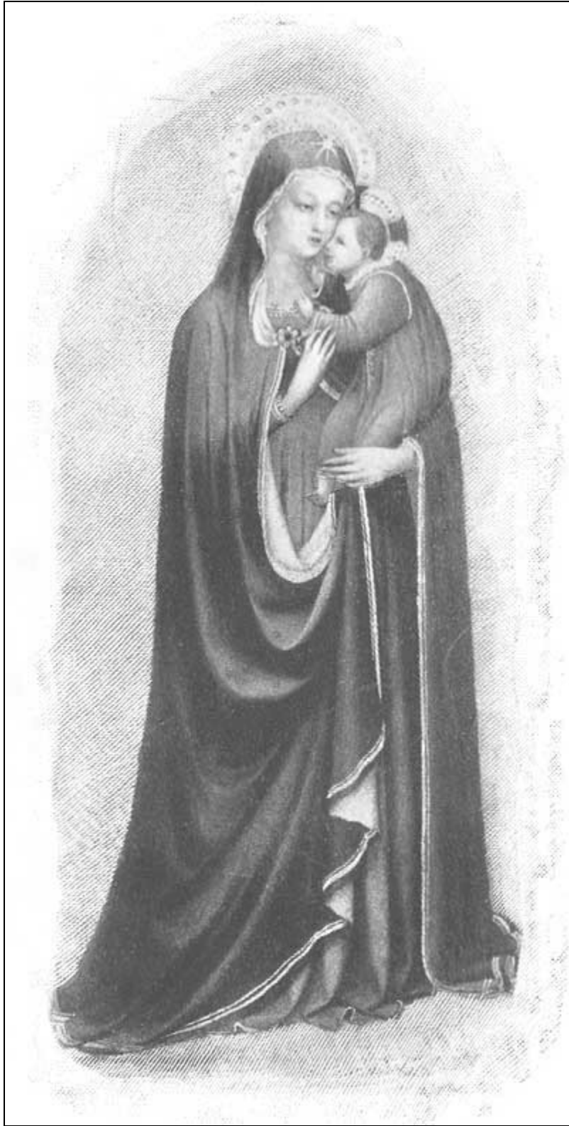
Fra Angelico.—Madonna della Stella.

A single star gleams above her brow, from which is derived the title of the picture. She holds her child fondly, and he, with responsive affection, nestles against his mother, pressing his little face into her neck. Faithful to the standards of his predecessors, and untouched by the new spirit of naturalism all about him, the monk painter preserves, in his conception, the most sacred traditions of past ages, and yet unites with them an element of love and tenderness which appeals strongly to every human heart.