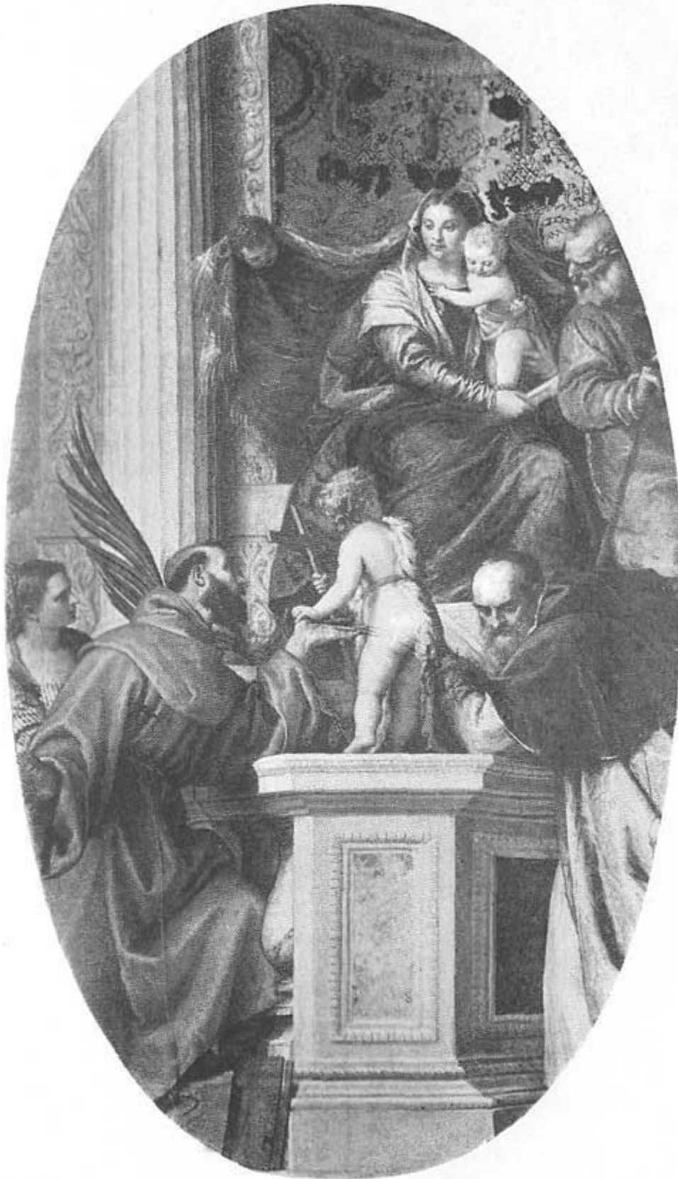
Veronese.—Madonna and Saints.

The reader must have remarked that, though the fundamental idea of the enthroned Madonna is that of queenship, the Virgin wears no crown in any of the pictures thus far cited; the crowned Madonna is not characteristic of Italian art. It is found occasionally in mosaics from the eighth to the eleventh centuries, and in some of the early votive pictures, but does not appear in the later period except in a few Venetian pictures by Giovanni da Murano and Carlo Crivelli. The