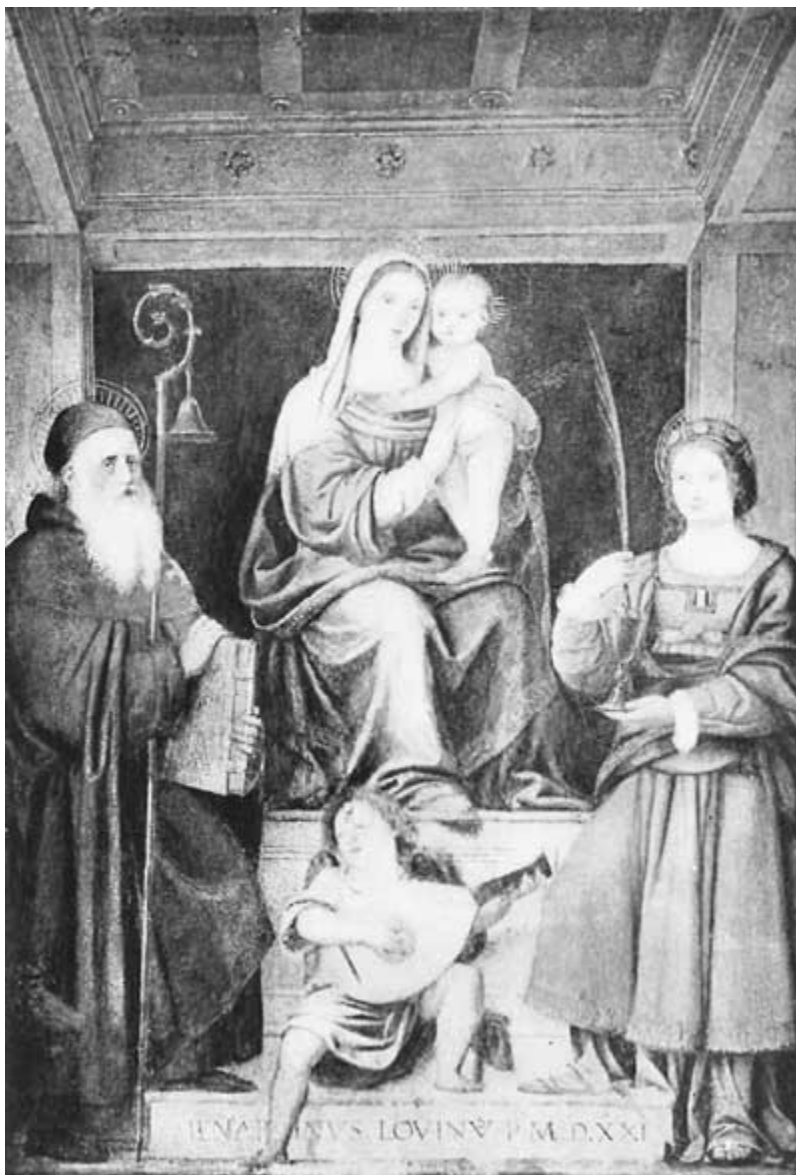
Luini.--Madonna with St. Barbara and St. Anthony.

of self-reliance. The two understand each other well.