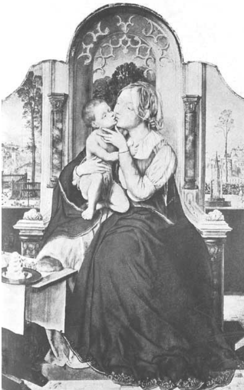
Quentin Massys.—Madonna and Child.

A simple and lovely form for the Madonna's crown is the narrow golden fillet set with pearls, singly or in clusters. This is placed over the Virgin's brow just at the edge of the hair, which is otherwise unconfined. This is seen on Madonnas by Van Eyck (Frankfort), Durer (woodcut of 1513), Memling (Bruges), Schongauer (Munich).