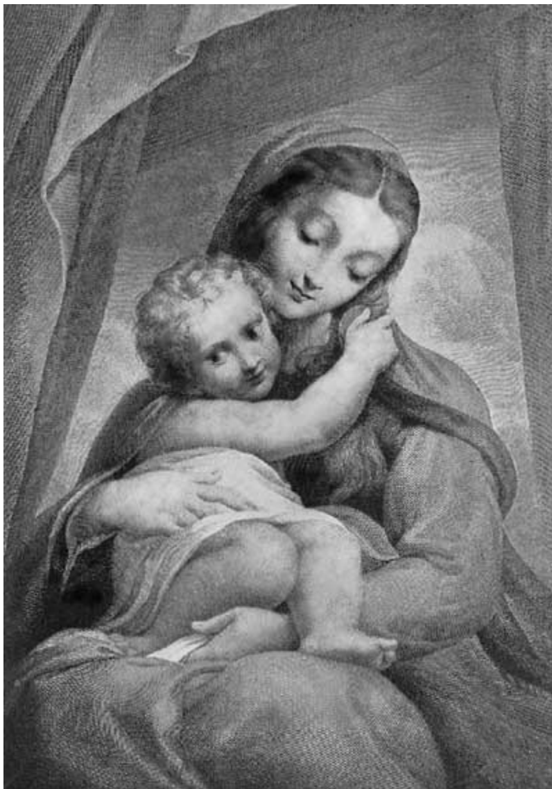
Correggio.—Madonna della Scala.

The picture has an interesting history. It was originally painted in fresco over the eastern gate of Parma, where Vasari saw and admired it. In after years, the wall which it decorated was incorporated into a small new church, of which it formed the rear wall. To accommodate the high level of the Madonna, the building was somewhat elevated, and, being entered by a flight of steps, was known as S. Maria della Scala (of the staircase).