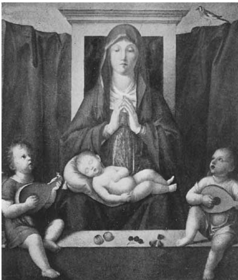
Luigi Vivarini.--Madonna and Child.

setting is a landscape, in the foreground of which the Madonna sits adoring the babe lying on her lap. Examples are by Basaiti (Paduan), in the National Gallery, and by a painter of Titian's school, in Berlin. Much more common is the enthroned Madonna in Adoration, and for this we may turn to the pictures of the Vivarini, Bartolommeo and Luigi, or Alvise. These men were of Muranese origin, and in the very beginning of Venetian art-history were at the head of their profession, until finally eclipsed by the rival family of the Bellini. Among their works, we find by each one at least three pictures of the type described. As the most worthy of description, we may select the altar-piece by Luigi, in the Church of the Redentore. As it is one of the most popular Madonnas in Venice, no collection is complete without it. A green curtain forms the background, against which the plain marble throne-chair is brought into relief. The Virgin sits wrapt in her own thoughts, an impersonation of tranquil dignity.