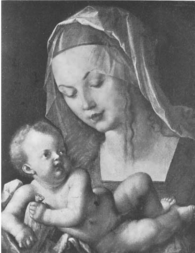
Durer.—Madonna and Child.

This entire absence of posing on the part of the German Virgin is one of the most admirable elements in this art. This characteristic is perfectly illustrated in Durer's portrait Madonna of the Belvedere Gallery, at Vienna. This is an excellent specimen of the master, who, alone of the Germans, is considered the peer of his great Italian contemporaries. Frankly admired both by Titian and Raphael, he has in common with them the supreme gift of seeing and reproducing natural human affections. His work, however, is as thoroughly German as theirs is Italian. The Madonna of this picture has the round, maidenly face of the typical German ideal. A transparent veil droops over the flowing hair, covered by a blue drapery above. The mother holds her child high in her arms, bending her face over him. The babe is a beautiful little fellow, full of vivacity. He holds up a pear gleefully, to meet his mother's smile. The picture is painted with great delicacy of finish.