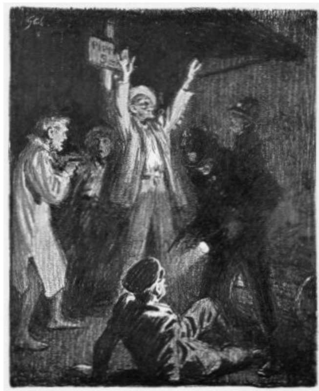
"Throw up your hands, boys; it's no use!" cried Hood in mock despair.

report to the magistrate Monday morning, and they parted, but only after Hood had shaken the crestfallen grocer warmly by the hand, warning him with the greatest solicitude against further exposure to the night air. Two other policemen appeared; the whole force was doing them honor, Hood declared proudly. He lifted his voice in song, but the lyrical impulse was hushed by a prod from a revolver. He continued to talk, however, assuring his captors of his heartiest admiration for their efficiency. He meant to recommend them for positions in the secret service--men of their genius were wasted upon a country town.