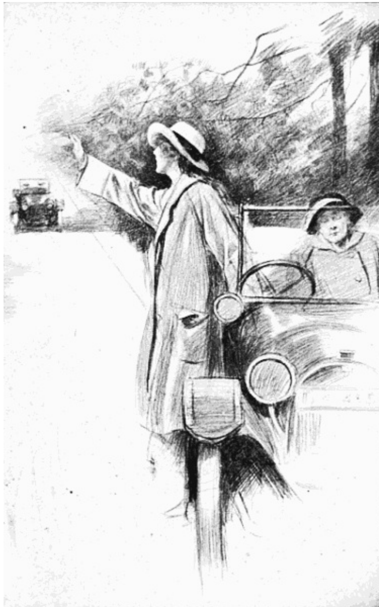
"WINONA STOPPED THE CAR BESIDE THE HEDGE, AND, STANDING UP, WAVED HER HANDKERCHIEF AS A SIGNAL OF DISTRESS"

"Can I be of any assistance?" he asked politely.