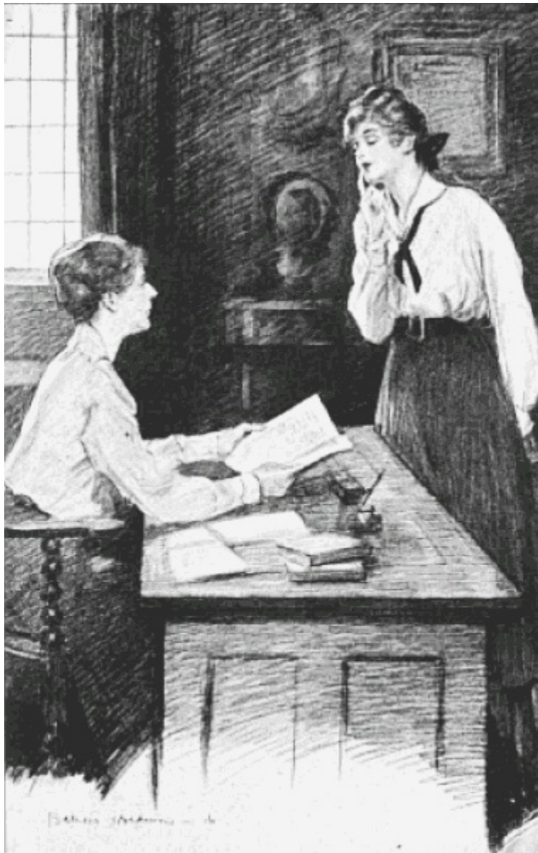
"THOSE AREN'T MY PAPERS,' WINONA FALTERED"