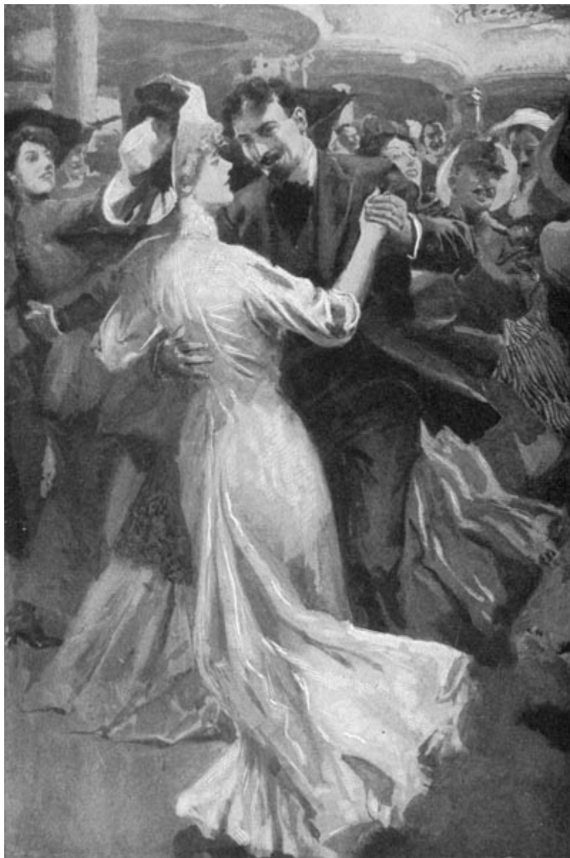
FLEURETTE DANCED WITH ARISTIDE, AS LIGHT AS AN AUTUMN LEAF TOSSED BY THE WIND

"A fortnight ago she was being killed in a Bloomsbury boarding-house. There were two of 'em--she and a girl called C call 'em Fetch and Carrie. This one was Fetch. Well, she fetched me, didn't you, old girl? And now you're Mrs. Reg living at your ease, eh?"