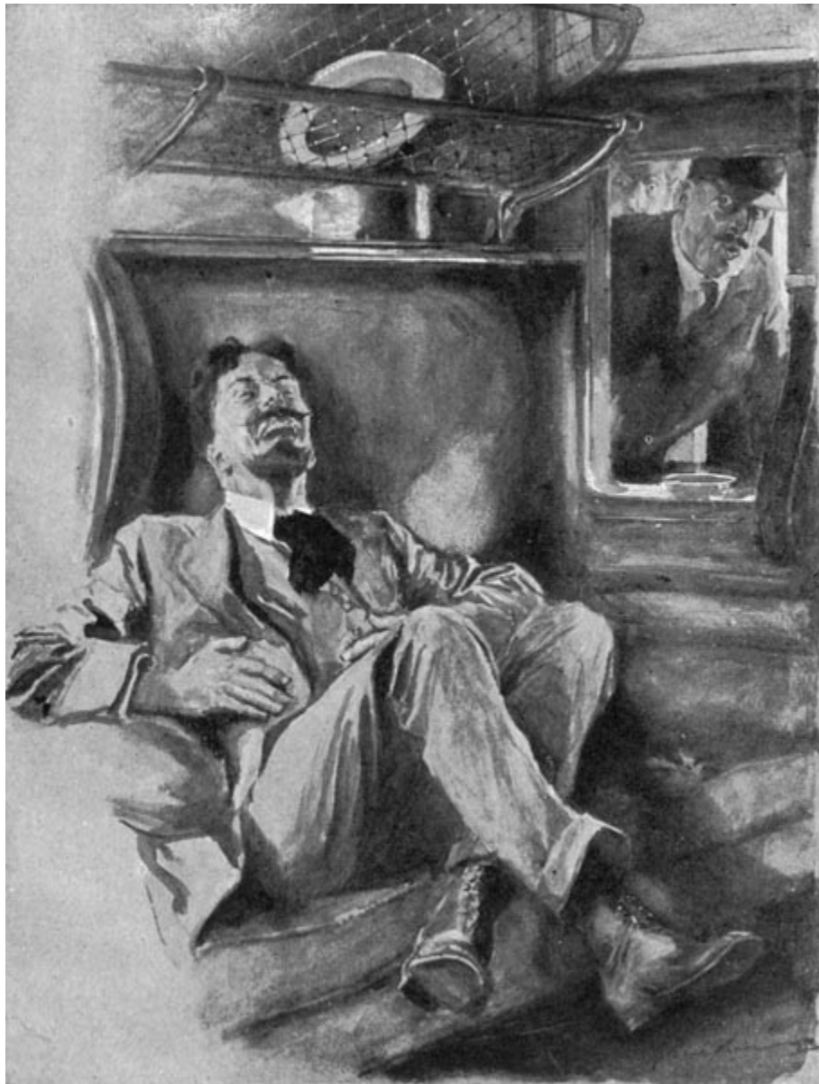
HE BURST INTO SHRIEKS OF LAUGHTER

Early the next morning Aristide started on his quest, without informing the good Bocardon of his intentions. He went to Avignon, as the more likely place. Inquiries at the various hotels would soon enable him to hunt down his quarry. He did not quite know what would happen then—but it would be something picturesque, something entirely unforeseen, something to be thrillingly determined by the inspiration of the moment. In any case he would wipe the stain from the escutcheon. By this time he had convinced himself that he belonged to the Bocardon family.