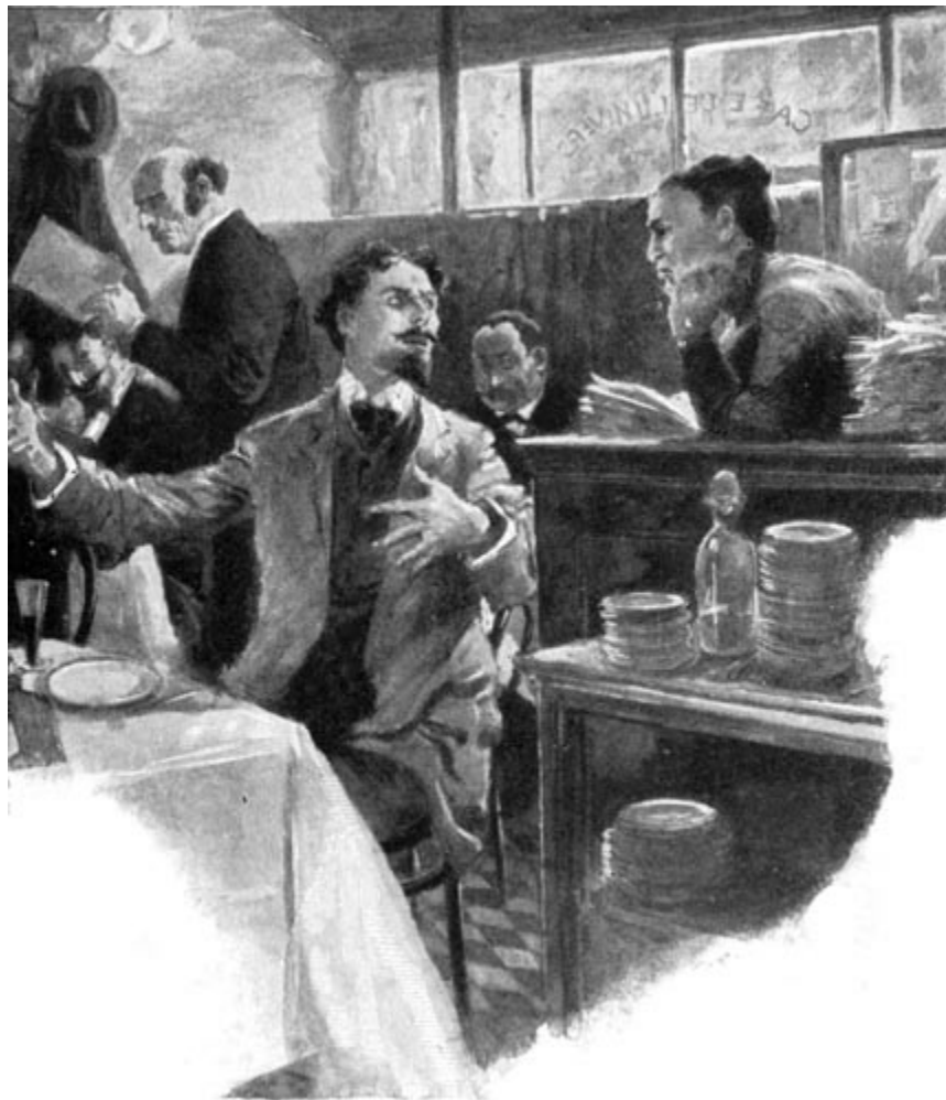
HAD STRAIGHTWAY Poured HIS GRIEVANCES INTO A FEMINE EAR

The mistral blew bitterly. I snuggled beneath the rug and hunched up my shoulders so as to get my ears protected by the collar. Aristide, sufficiently protected by his goat's hide, talked like a shepherd on a May morning. Why he took so much interest in his unromantic, not to say sordid, courtship I knew not; but he gave me the whole history of it from its beginnings to its now penultimate stage. From what I could make out--for the mistral whirled many of his words away--he had entered the Cafe de l'Univers one evening, a human derelict battered by buffeting winds from the westward, and, finding a seat immediately beneath Mme. Gougasse's comptoir , had straightway poured his grievances into a feminine ear, and, figuratively speaking, rested his weary heart upon a feminine bosom. And his buffetings and grievances and weariness came they? I asked the question point-blank.