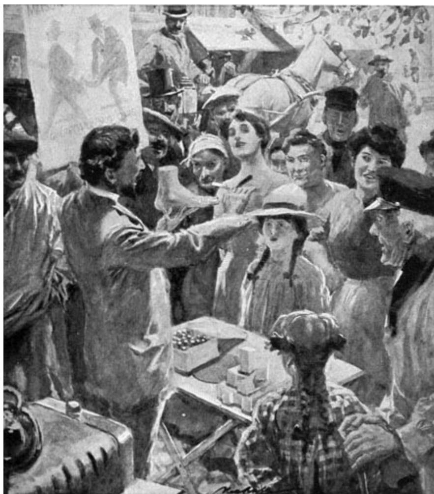
HE DEMONSTRATED THE PROPER APPLICATION OF THE CURE

" Mon Dieu! " she said. "To think that there are Christians who dress their children like this!" She sighed exhaustivel; the grotesque infant close to her breast, disappeared indignantly to administer the very greatly needed motherment.