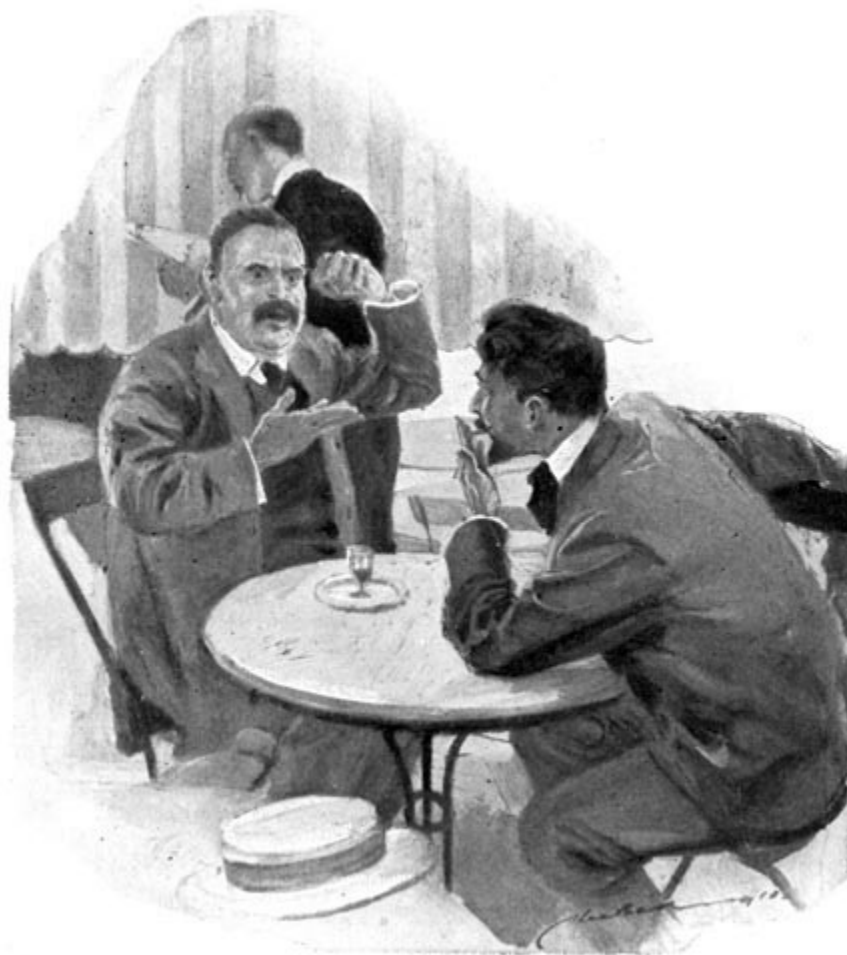
"THE VILLAIN WAS A TRAVELLER IN BUTTONS—BUTTONS!"

It was a crude, flaming, reprehensible, and entirely damning epistle. Aristide turned cold, shivering at the idea of the dainty Zette coming in contact with such abomination. He hated Bondon with a murderous hate. He drank a great glass of wine and wished it were Bondon's blood. Great tears rolled down Bocardon's face, and gathering at the ends of his scruff, they dripped in splashes on the marble table.