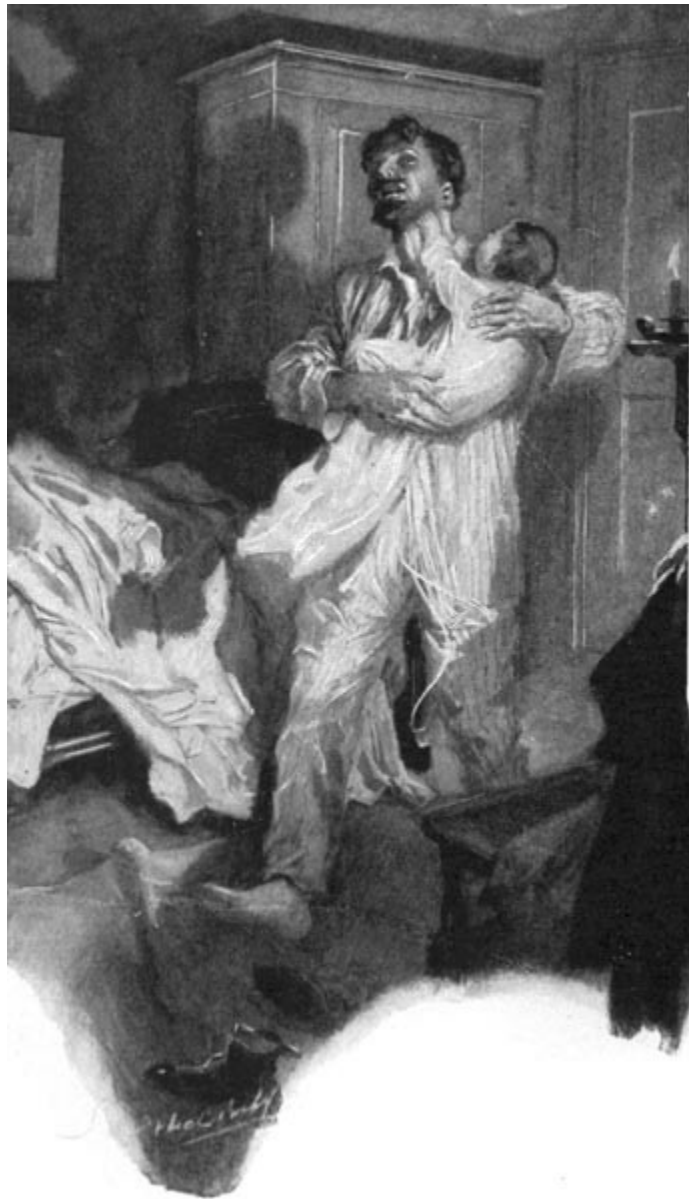
IT IS A FEARSOME THING FOR A MAN TO BE LEFT ALONE IN THE DEAD OF NIGHT WITH A YOUNG BABY

Together they had many wanderings and many adventures. The wheezy, crazy mechanism of the car went to bits in places. They tobogganed down hills without a brake at the imminent peril of their lives. They suffered the indignity of being towed by wine-wagons. They spent hours by the wayside while Aristide took her to pieces and, sometimes with the help of a motorist, put her together again. Sometimes, too, an inn boasted no landlady, only a dishevelled and over-driven character who refused to wash Jean. Aristide washed and powdered Jean himself, the landlord lounging by, pipe in mouth, and making suggestive remarks. Once Jean grew ill, and Aristide in terror summoned the doctor, who told him that he had filled the child's stomach to bursting-point. Yet, in spite of heterogeneous nursing and exposure to sun and rain and piercing mistral, Jean threw off his illness, and, to Aristide's delight, began to cut another tooth. The vain man began to regard himself as an expert in denticulature.