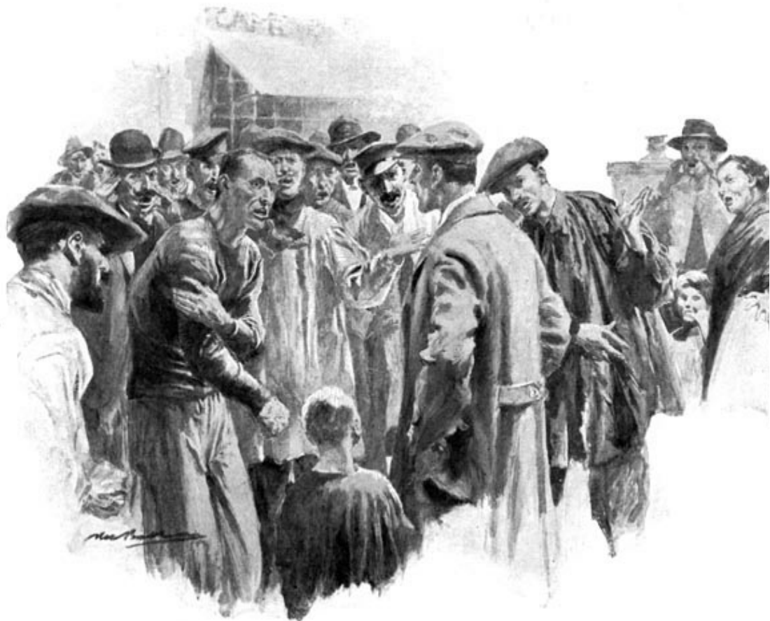
HAD KNOCKED HIM DOWN ON PURPOSE. HE WAS CRIPPLED FOR LIFE