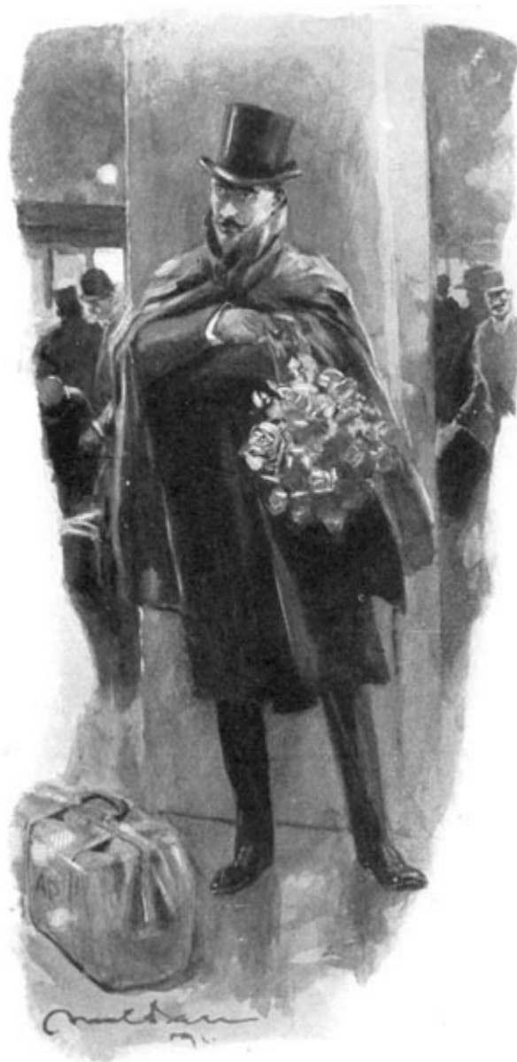
STANDING ON THE ARRIVAL PLATFORM OF EUSTON STATION

"Then, sir, Mr. Smith has sent the carriage for you."