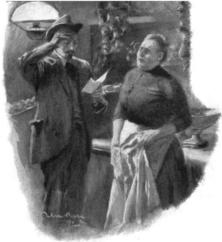
HE READ IT, AND BLINKED IN AMAZEMENT

"She died for want of love, parbleu ," said Aristide, "and there was mine quivering in my heart and trembling on time.... She had des yeux de pervenche . Ah! nom d'un chien! It is only with me that Providence plays such tricks."