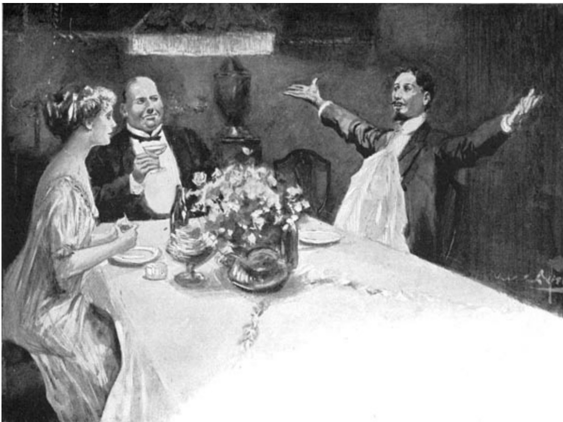
THE PICTURES," CRIED ARISTIDE, WITH A WIDE SWEEP OF HIS ARMS

"You've forgotten the pictures," said Mr. Smith.