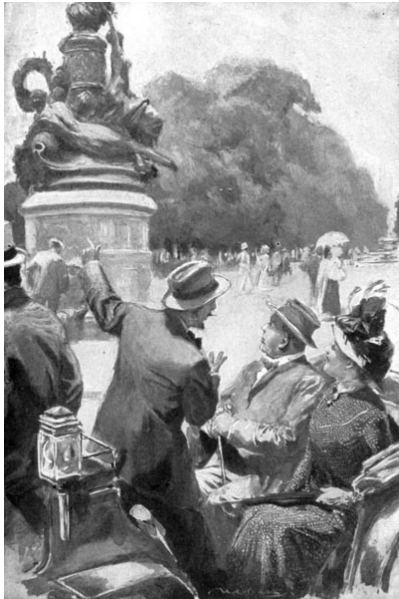
HE MIGHT AS WELL HAVE POINTED OUT THE MARVELS OF KUBLA KHAN'S PLEASURE-DOME TO A COUPLE OF GUINEA-PIGS

He entered the waiting victoria. His wife meekly followed.