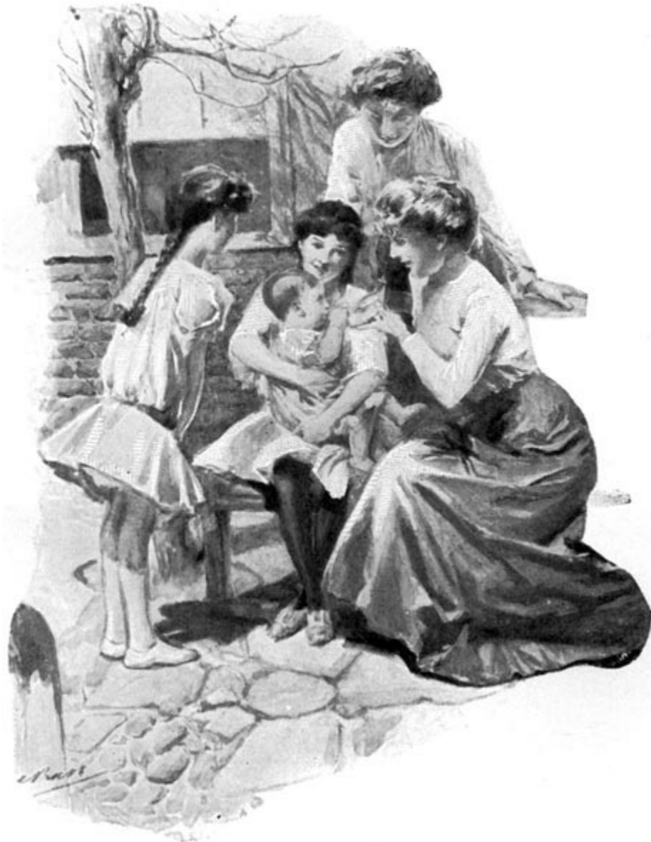
ONE OF THE LITTLE GIRLS IN PIGTAILS WAS HOLDING HIM, WHILE MISS ANNE ADMINISTERED THE FEEDING-BOTTLE

She laughed, holding the feeding-bottle. "The Palace of the Popes has been standing for six centuries, and it will be to-morrow; whereas Jean----" Here Jean, for some reason known to himself, grinned wet and wide. "Isn't he the thing of the twentieth century?" she cried, logically inconsequential, like most of her sex. "You go to Marseilles, M. P