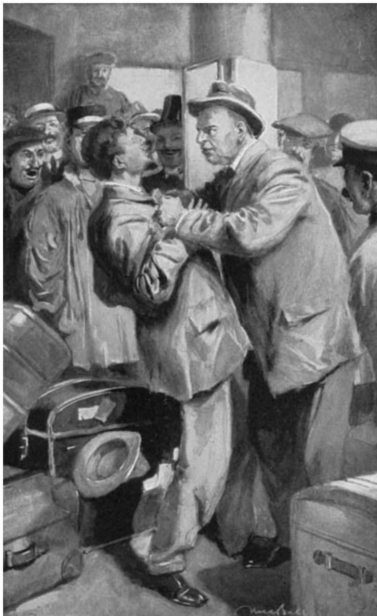
MR. DUCKSMITH SEIZED HIM BY THE LAPELS OF HIS COAT

"You swear that?" asked Aristide, with lightning quickness.