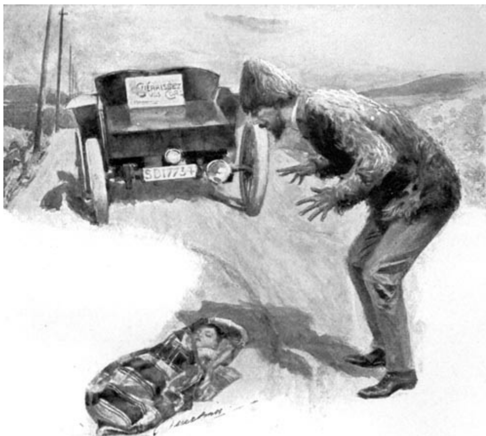
BETWEEN THE FOLDS OF THE BLANKET PEEPED THE FACE OF A SLEEPING CHILD

To walk through it would be a task as depressing as mortal could execute. But to the speed-drunken motorist it is a rare and tremulous visions of Paradise. What need to look to right or left when you are swallowing up free mile after mile road? Aristide looked neither to right nor left, and knew this was heaven at last.