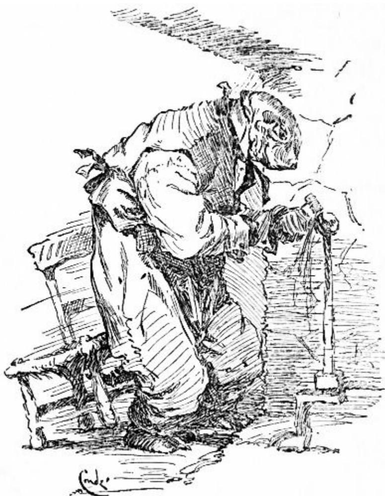
MR. TURTLE SAID THAT WHAT MR. 'POSSUM HAD TOLD THEM WAS TRUE

Then they all remembered that they were hungry now, and Mr. Crow and Mr. Squirrel and Mr. Robin hustled around to get a bite to eat before bedtime, and Mr. 'Possum hurried down to bring up the stove-wood, and was gone quite awhile, though nobody spoke of it--not then--even if they did wonder about it a little--and after supper they all sat around the fire again and smoked and dropped off to sleep while the clock ticked and the blaze flickered about and made queer shadows on the wall of the Hollow Tree.