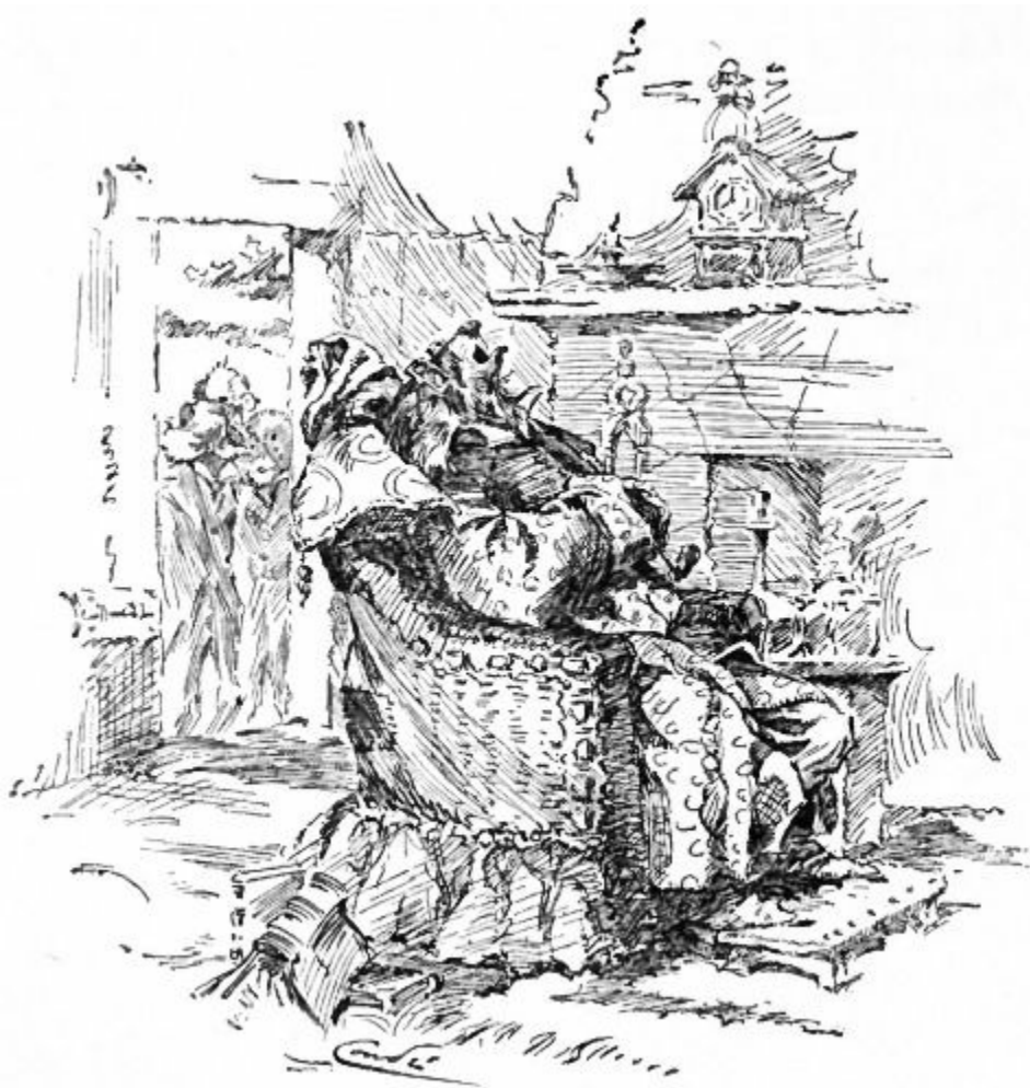
MR. BEAR MUST HAVE BEEN VERY TIRED AND GONE TO SLEEP RIGHT WHERE HE WAS

Well, they couldn't say a word at first, but only just looked at one another and at all the things they saw in that pantry.