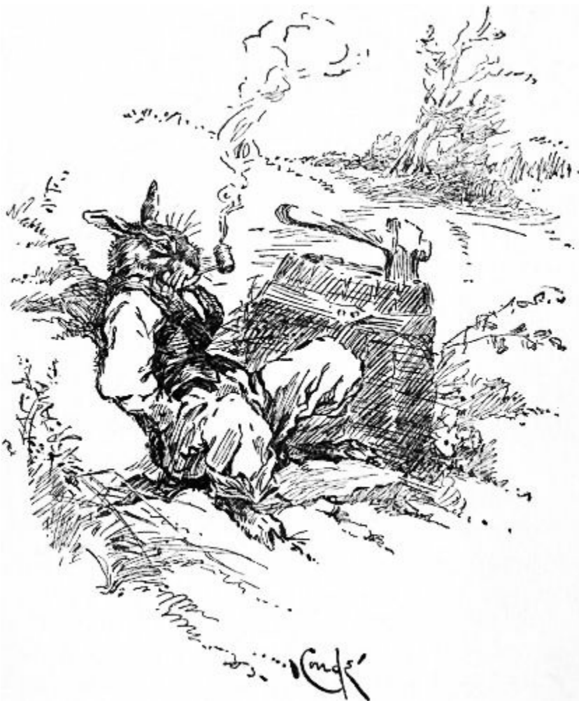
GRANDFATHER WOULD LIGHT HIS PIPE AND THINK IT OVER

"Then King Lion said that my twenty-seventh great-grandfather was plenty young enough and plenty plump enough, and that he'd never heard of any prophecy about a cotton-tailed rabbit, and that he'd never heard of a cotton-tailed rabbit, either.