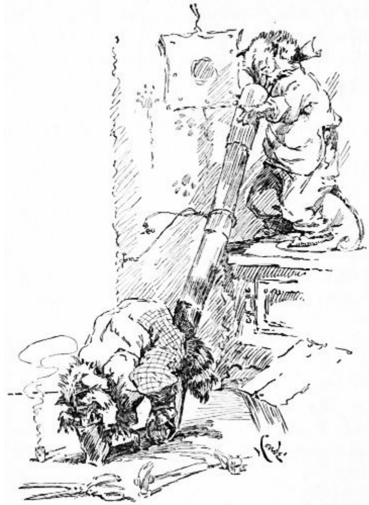
MR. 'POSSUM AND MR. 'COON TRIED TO PUT UP THE STOVE