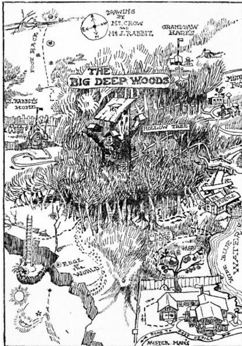
MAP OF THE HOLLOW TREE AND DEEP WOODS COUNTRY