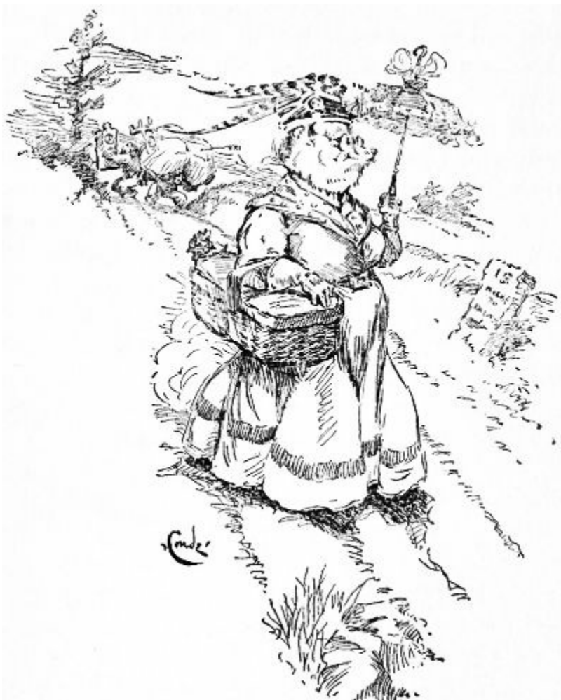
DIDN'T LOOK AS IF SHE BELONGED TO THE REST OF OUR CROWD

"We shut our eyes and held on, and some of our furniture was brushed off of Uncle Silas and the hired man, and Aunt Melissy lost her umbrella, and I lost a toy chicken, which I could never find again. Then all at once there was a big sudden jerk that jarred Uncle Silas loose, and made Aunt Melissy holler that she was killed, and knocked the breath out of the rest of us for a few minutes.