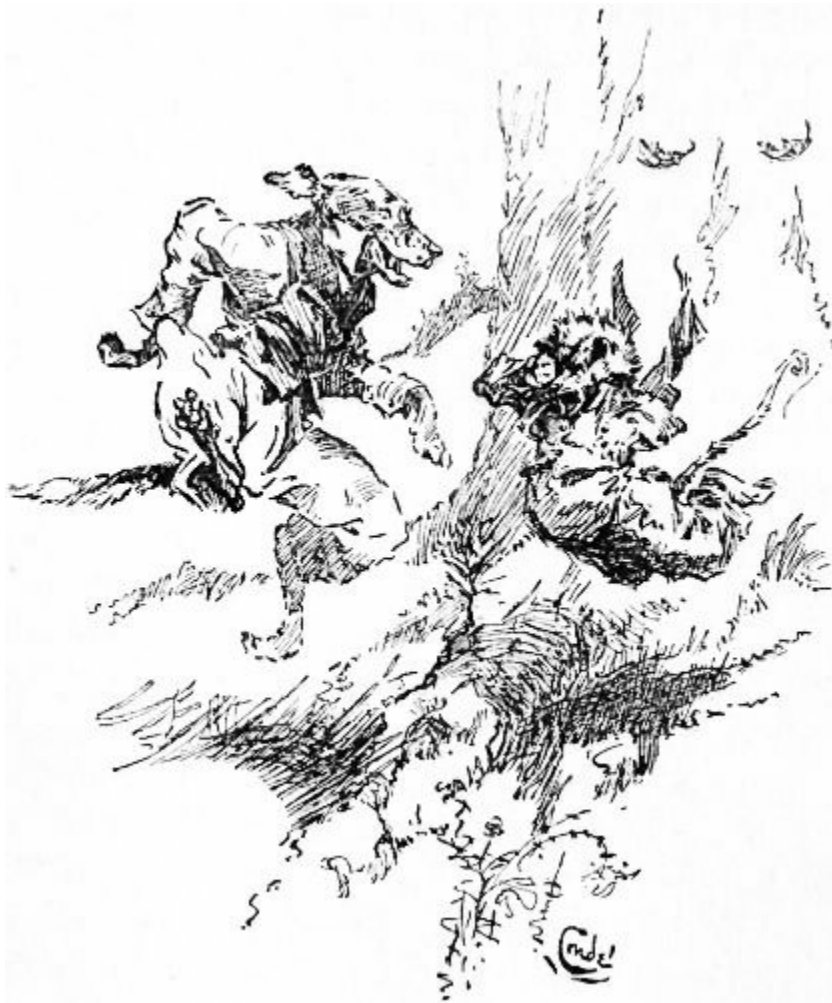
CAME CLATTERING DOWN RIGHT IN FRONT OF MR. DOG

And then Mr. Dog would remember that he was a good ways from home, and that if he wasn't there in time to help Mr. Man get up the cows there might be trouble; and he would set out lickety-split for home, with Mr. 'Possum calling to him as he ran.