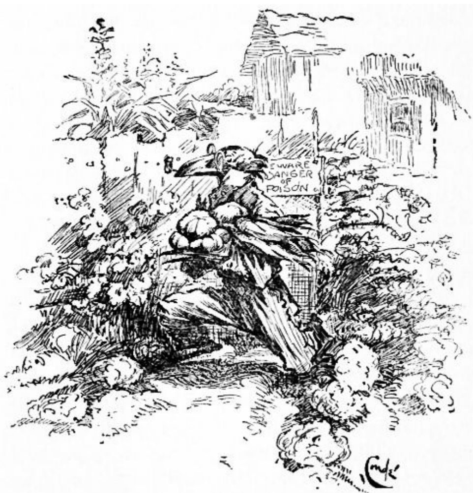
MR. CROW DECIDED TO THIN OUT A FEW OF JACK RABBIT'S THINGS

So Mr. Crow picked some large ears of corn and some of Mr. Rabbit's best pease and beans and salads, and filled his apron with all he could carry, and climbed through the back fence again, and took out for home without wasting any more time. And when he got there Mr. 'Coon and Mr. 'Possum were just getting up, and he didn't bother to tell them about borrowing from Mr. Rabbit's garden, but set out some breakfast, and as soon as it was over pitched in to get ready for company. Mr. 'Coon and Mr.