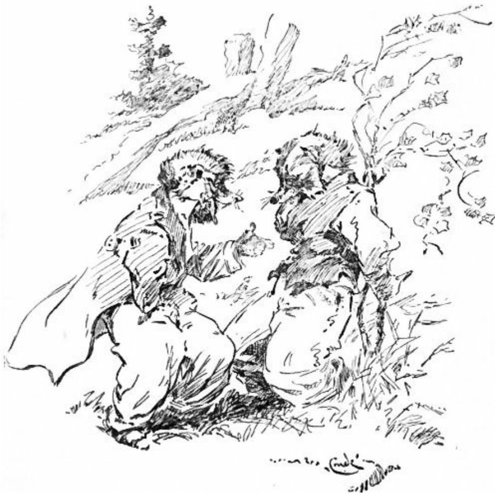
MR. COON SCRATCHED HIS BACK AGAINST A LITTLE BUSH

But when they got into some thick hazel brush they stopped a minute to breathe, and then they all heard Mr. Bear calling "Help! Help!" as loud as he could, and when they listened they heard him mention something about an earthquake and that the world was coming to an end.