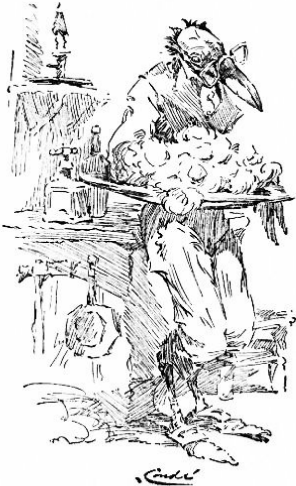
MR. CROW WAS ALMOST AFRAID TO BRING ON THE SALAD

swallowed two or three times, and tried to smile, though it was a sickly smile. He said that Mr. Rabbit was very kind, but that Mr. 'Possum and Mr. 'Coon had done a good deal of the work, too.