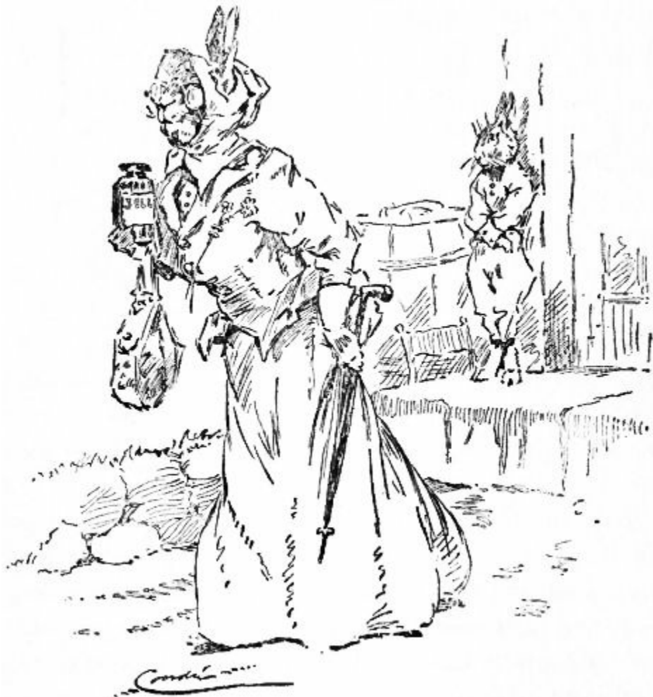
TOOK HER PARASOL AND HER RETICULE AND A CAN OF BERRIES, AND STARTED

Then little Jack forgot all about putting up blackberries, admiring that beautiful red spot on the shiny black stove, and