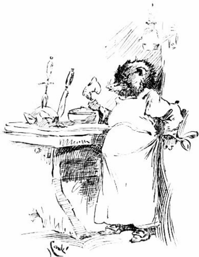
AND HE TASTED OF THAT A LITTLE, TOO

'Possum said they ought to come here every day and eat dinner as long as the hot weather lasted. Then they were all so hungry that they began on the chicken right away, and Mr. 'Possum said that maybe he might have picked out a tenderer one, but that he didn't think he could have found a bigger one, or one that would have lasted longer, and that, after all, size and lasting were what one needed for a picnic.