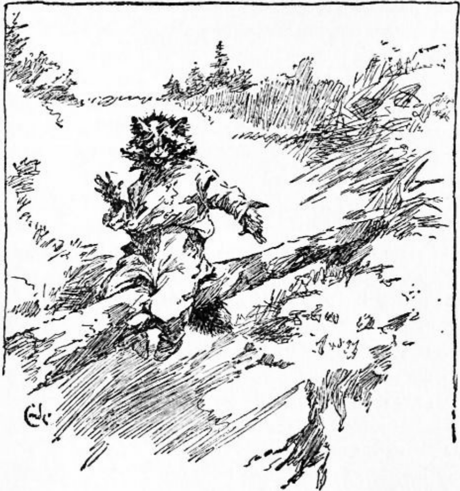
ALL AT ONCE HE HEARD A FIERCE BARK CLOSE BEHIND HIM

"Well, he didn't go, but just sat there, barking up that tree, and after a long time I heard somebody coming again, and I