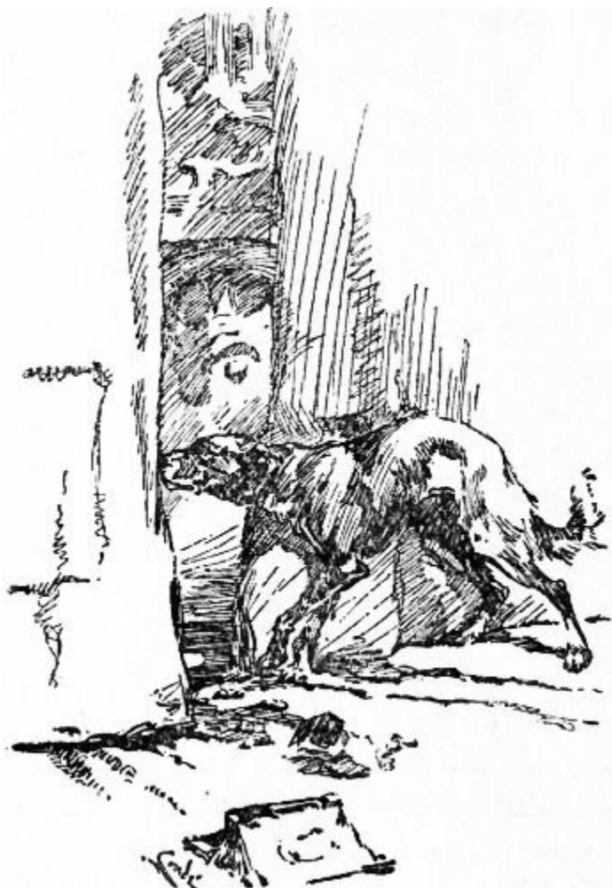
"SLIPPED IN BEHIND HIM WHEN HE WENT INTO THE TENT"

"They just keep them for Mr. Man and his friends to look at and talk about, and if Mr. Turtle will take my advice he will keep out of a menagerie and live in the Wide Blue Water where he was born. I wouldn't have gone there again unless I had been tied and dragged there, or unless they had put those tame animals into cages with the others. No doubt there are some very fine,