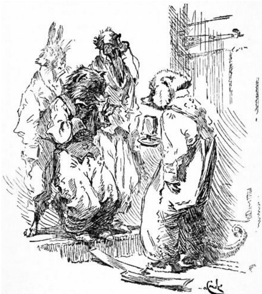
LOOKED STRAIGHT AT MR. 'POSSUM AND SAID, "WHAT WAS THAT YOU

"Why is it you never hear the bark of Old Hungry-Wolf?"