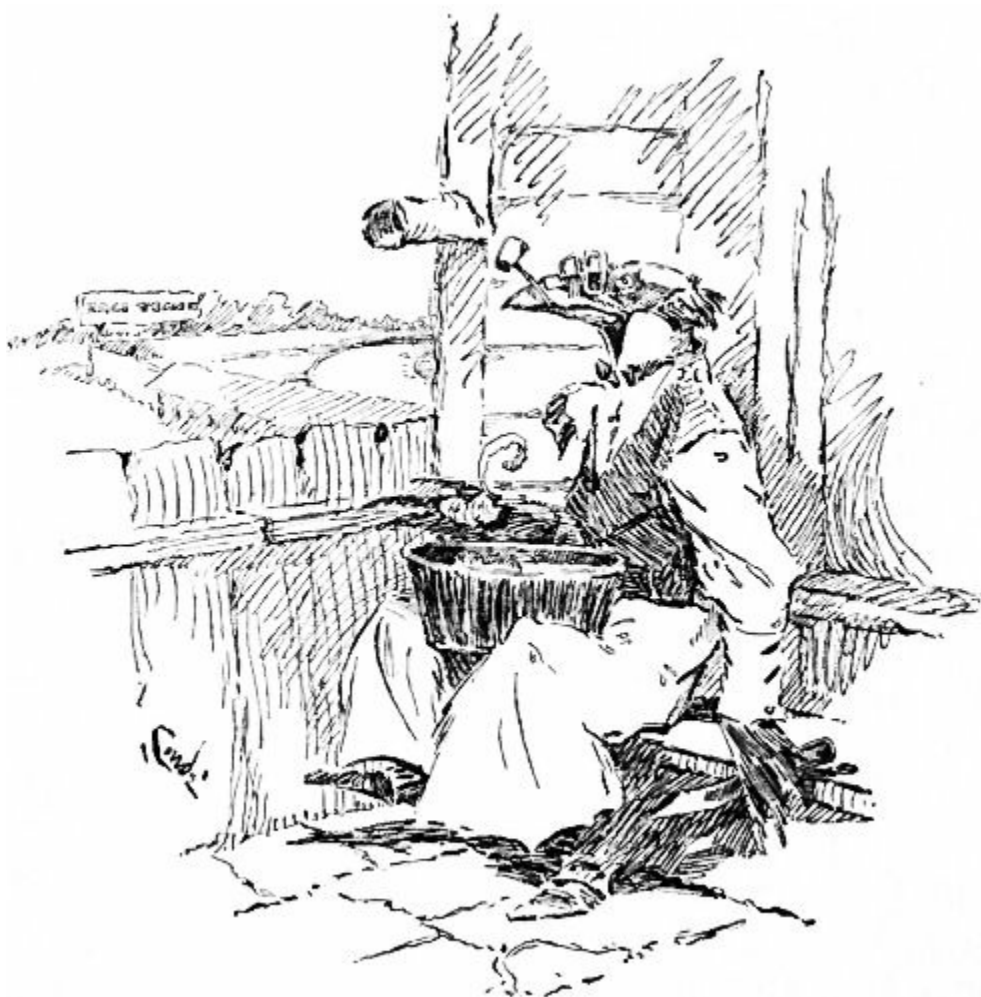
HAD TO STAY AT HOME AND PEEL POTATOES

And by-and-by, Mr. 'Possum and Mr. 'Coon didn't like it so much, either. Widow Crow got so she scolded them, too, about their habits, especially about being out nights and lying in bed next morning, and she wouldn't give them any breakfast unless they got up in time.