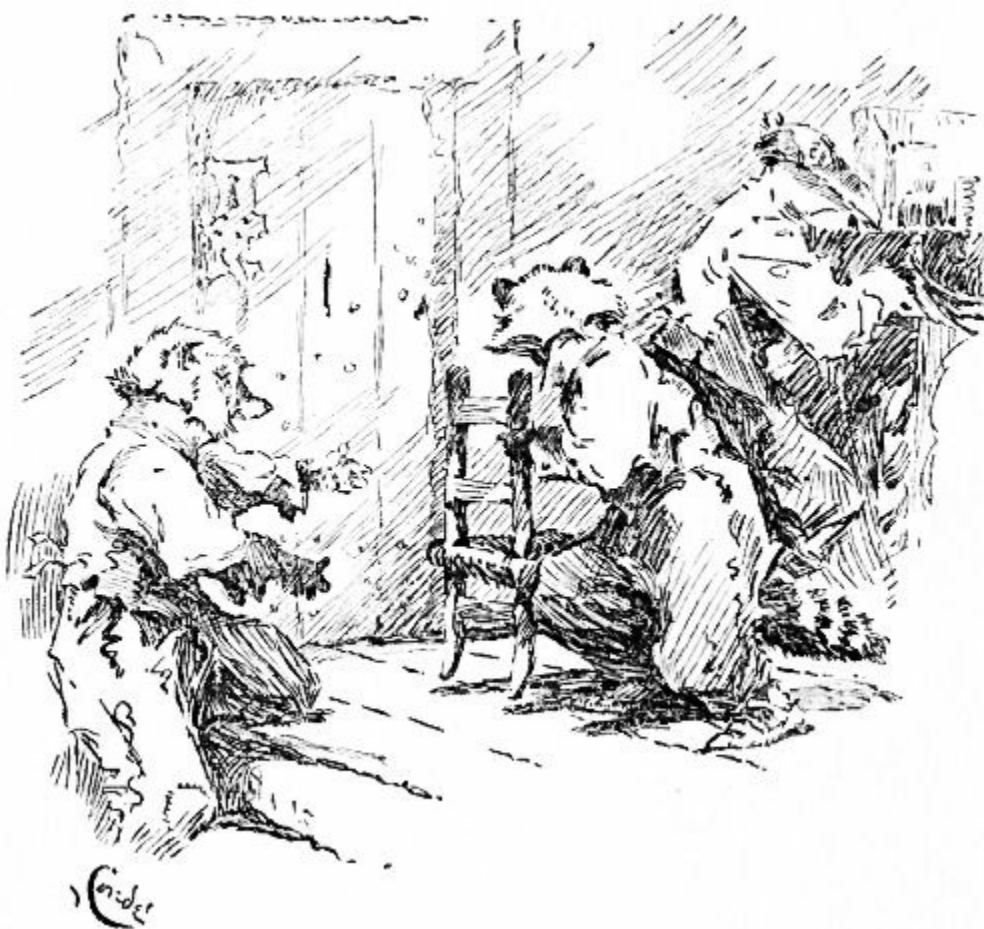
LISTENED NOW AND THEN AT WIDOW CROW'S DOOR TO BE SURE SHE WAS ASLEEP

Mr. Crow said he knew his own things, and that he wouldn't take any that belonged to the Missing One, because they had mostly come from her mother; and, besides, they would be a sad reminder, and didn't seem to go with the kind of a place they had planned to have. He said if they didn't have enough things they could borrow a few from Mr. Man when Mr. Man went away and left his windows open, and that they wouldn't need much to begin with.