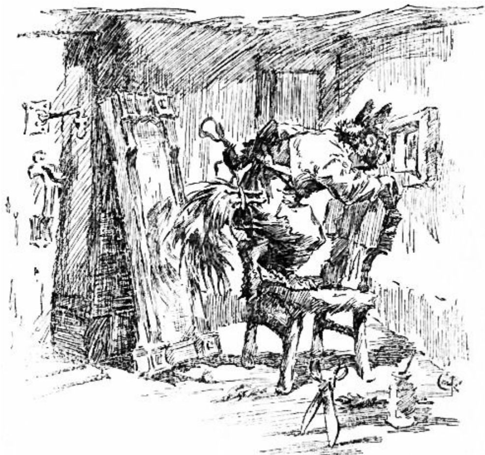
TRIED TO SPLICE HIS PROPERTY BACK IN PLACE

"Well," he said, "my twenty-seventh great-grandfather Hare didn't go out again for several days. He put up a sign that said 'Not at Home,' on his door, and then tried a few experiments, to see what could be done.