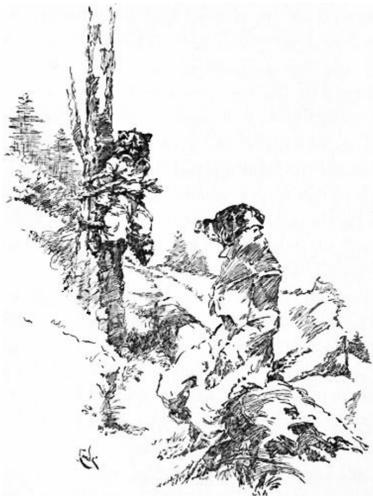
"THEN MR. DOG SAID, 'TELL ME ANOTHER'"

"Will you tell it if I untie your feet?' said Mr. Dog.