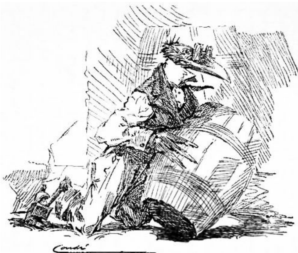
ONE DAY MR. CROW FOUND HE WAS AT THE BOTTOM OF THE BARREL OF EVERYTHING

But they didn't mind it so long as they were warm and not hungry, and they played games, and recited their pieces, and sang, and danced, and said they had never had such a good time in all their lives.