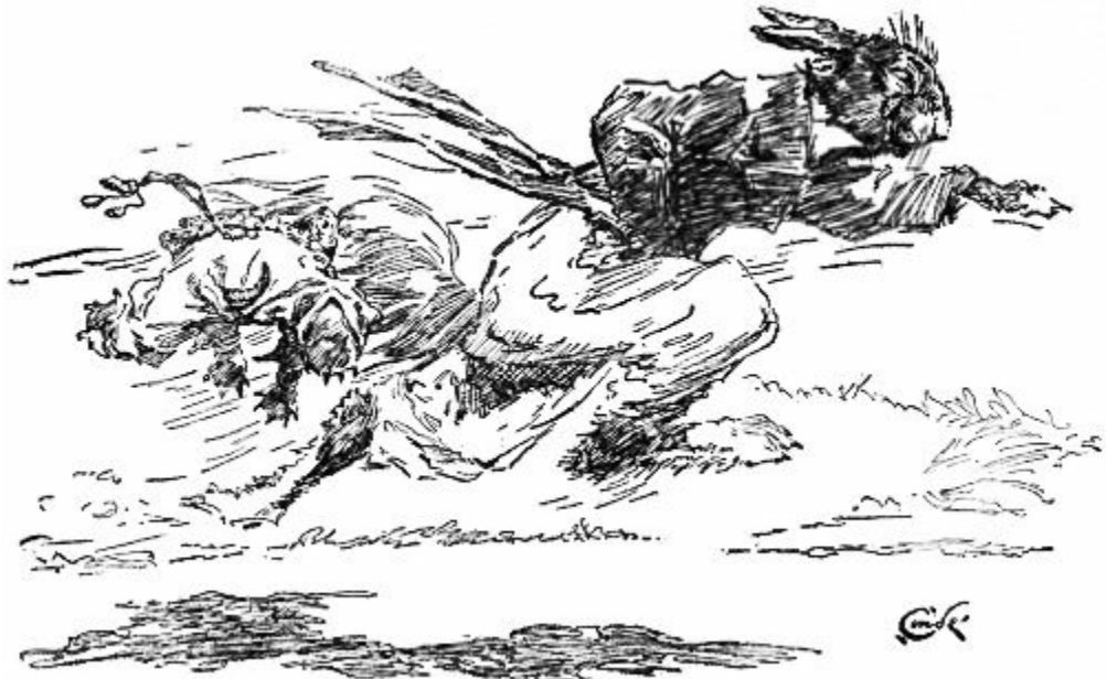
SAILING ALONG, JUST TOUCHING THE HIGHEST POINTS

"Mr. Fox had gone sound asleep and didn't hear the rumpus at first, and when he did, he thought grandpaw was just calling to him to wake up and be ready to judge the race, so he sat up quick and watched them come. He saw my twenty-seventh great-grandfather sailing along, just touching the highest points, with something that looked like an old black wash-pan tied to his tail.