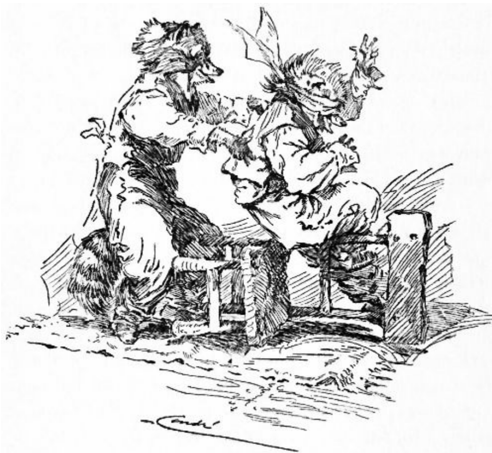
MR. 'POSSUM HAD TO PUT ON THE HANDKERCHIEF AND DO MORE EXERCISING THAN ANY OF THEM

which was a rigmarole Mr. Rabbit had made up himself to use in games where somebody had to be "It," and Mr. Rabbit said it around and around the circle on the different ones--one word for each one--until he came to the word blind and that was Mr. 'Possum, who had to put on the handkerchief and do more exercising than any of them, until he caught Mr. Turtle, who had to be "It" quite often, because he couldn't get out of the way as well as the others.