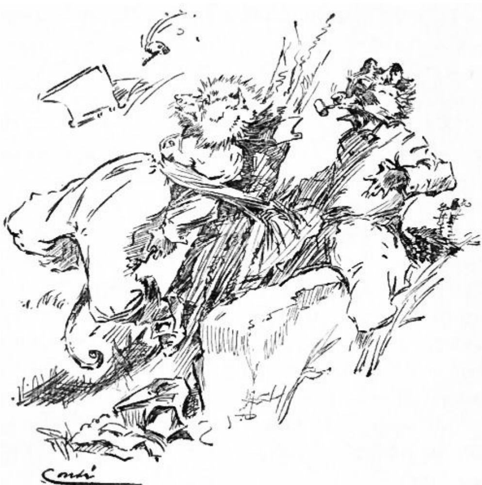
SO MR. 'POSSUM PROMISED, AND MR. 'COON UNTIED HIM