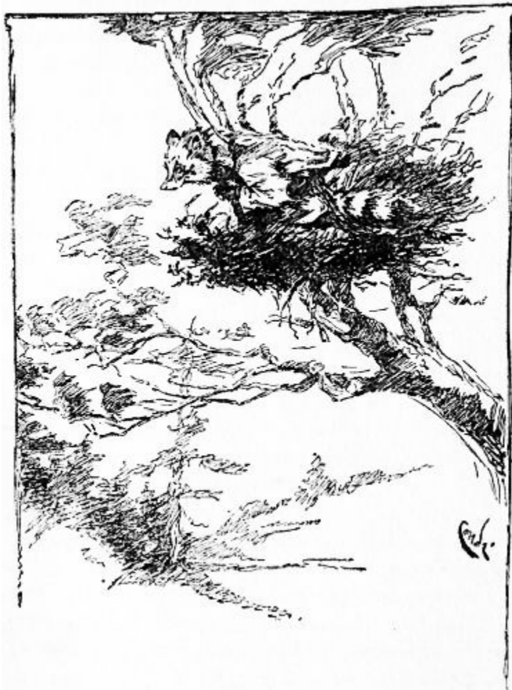
THEN I SUDDENLY FELT LIKE A SHOOTING-STAR

"Every time he struck the tree I could feel it all through me," he said, "and I knew if he kept that noise up long enough it would give me a nervous headache. I wished the tree would hurry up and drop, so we could have what muss we were going to, and get it over with. I'd have got out of that old nest and made a jump for another tree if there had been any near enough, but there wasn't, so I just laid low and gritted my teeth and let him chop.