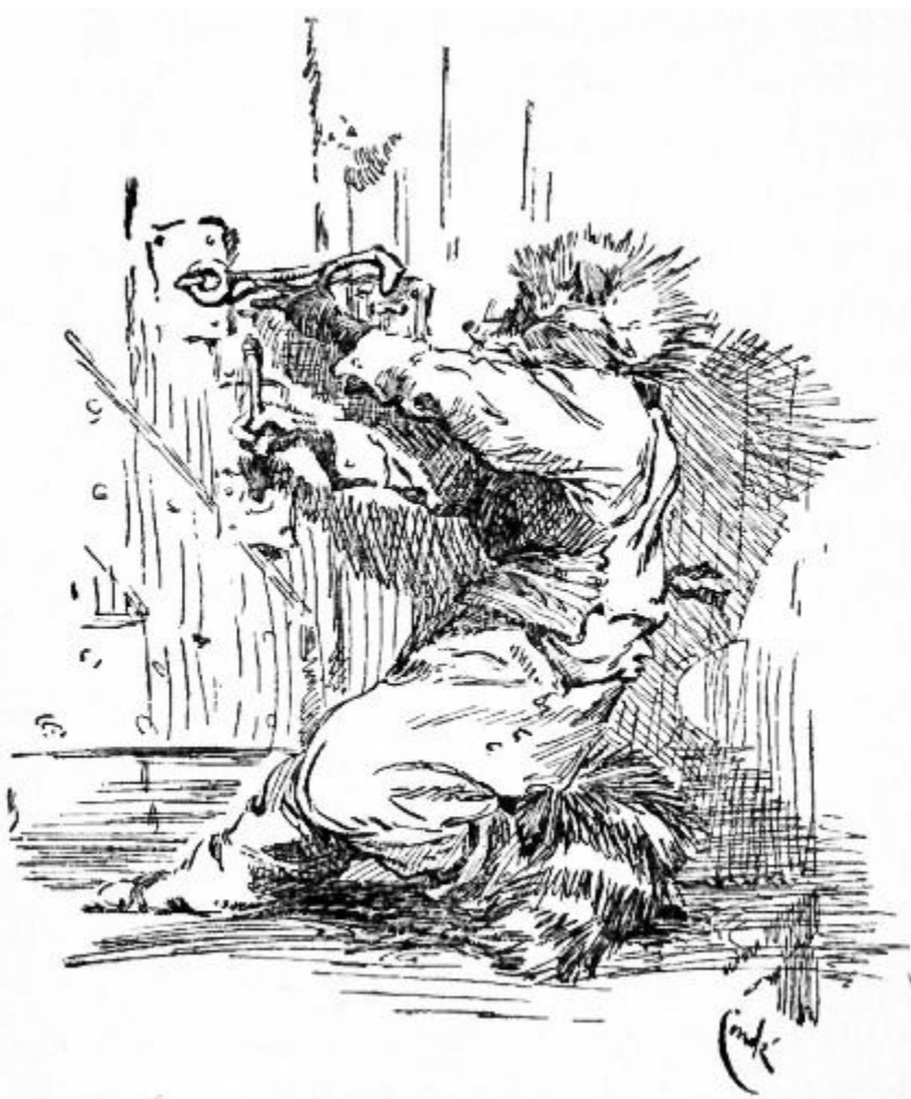
THEN MR. 'COON SLAMMED HIS DOOR

Then they all went very quietly up Mr. 'Coon's stair (all except Mr. 'Possum, who stayed with Mr. Crow), and they opened Mr. 'Coon's door and took one look inside, and then Mr. 'Coon he slammed his door shut, and locked it, and they all let go of everything and came sliding down in a heap, for they had seen the great fiery eyes and black face of Old Hungry-Wolf glaring in at Mr. 'Coon's window.