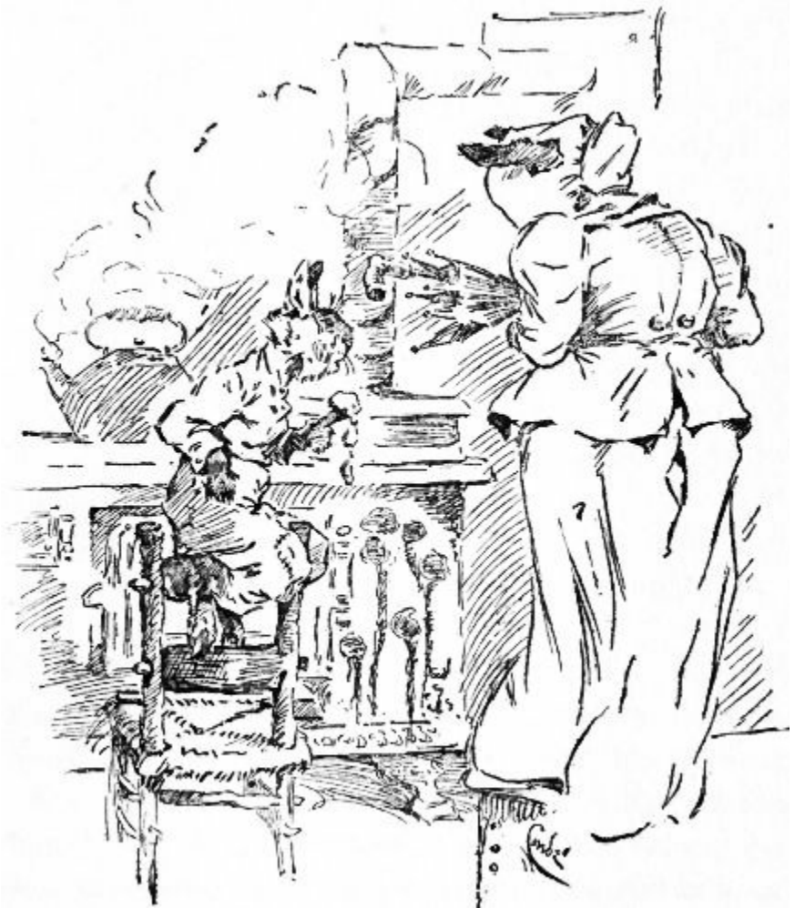
LITTLE JACK KNEW PERFECTLY WELL THAT SHE WASN'T AT ALL PLEASED