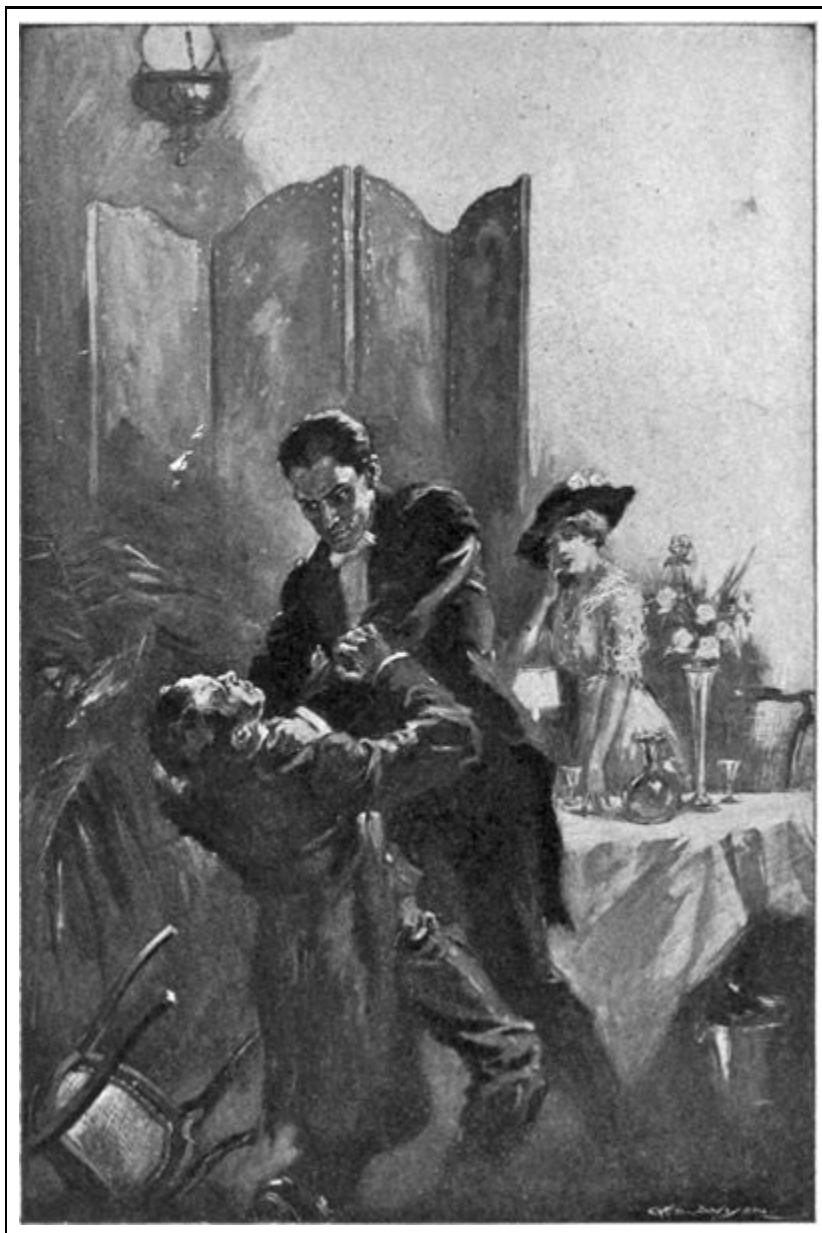
What followed came like a thunder-clap. Frontispiece. See page 304.