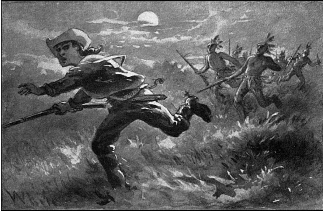
A RACE FOR LIFE.