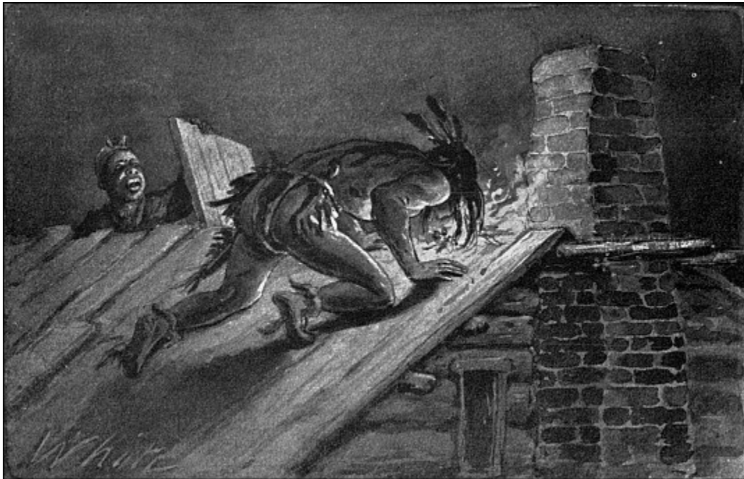
A STARTLING DISCOVERY.

The Indian whom she had heard prowling like a hungry wolf over the roof, was there for a more sinister purpose, if possible, than that of gaining entrance through the scuttle into the building. He had managed to climb undetected to his perch for the purpose of setting fire to the building, and not only that, but he had succeeded in his design.