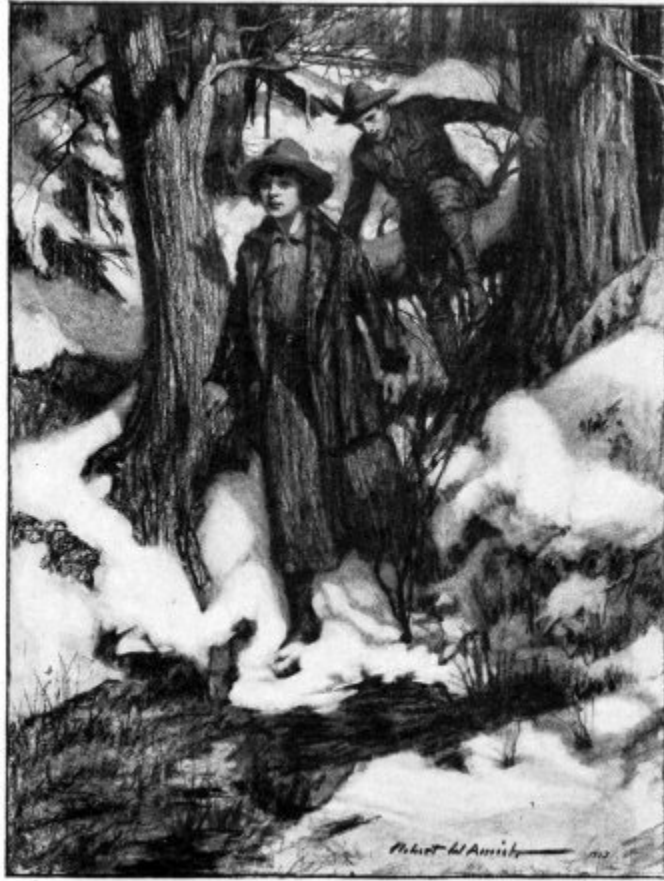
SHE FOUND HERSELF CONFRONTED BY AN ENDLESS MAZE OF BLACKENED TREE-TRUNKS

He bravely reassured her: "I'm not defeated, I'm just tired. That's all. I can go on."