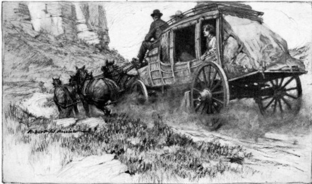
THE GIRL BEHIND HIM WAS A WONDROUS PART OF THIS WILD AND UNACCOUNTABLE COUNTRY

The picture which the girl had made as she dashed up to the pasture gate (her hat-rim blown away from her brown face and sparkling eyes), united with the kindness in her voice as she accepted his gallant aid, entered a deep impression on the tourist's mind; but he did not turn his head to look at her--perhaps he feared Bill's elbow quite as much as his guffaw--but he listened closely, and by listening learned that she had been "East" for several weeks, and also that she was known, and favorably known, all along the line, for whenever they met a team or passed a ranch some one called out, "Hello, Berrie!" in cordial salute, and the men, old and young, were especially pleased to see her.