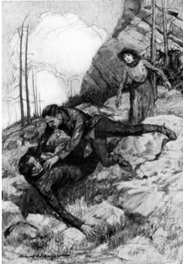
THE SLENDER YOUTH WENT DOWN BEFORE THE BIG RANCHER AS THOUGH STRUCK BY A CATAPULT

Belden snarled between his teeth: "I told you I'd kill you, and I will."