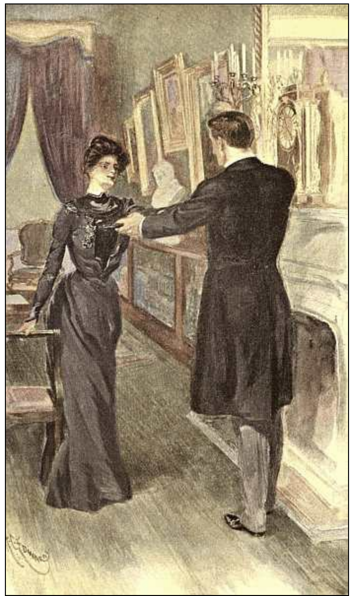
"'Beatrix?' he said"