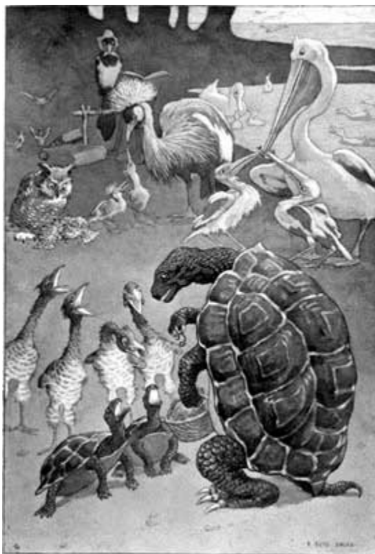
Here are some nice fat wiggly worms!

"Oh, that is easily told," cried Mrs. Partridge. "They are the most beautiful little creatures in the school. They are said greatly to resemble me. You will have no trouble in recognizing them. When you come to the school just look around at all the children, and pick out the three most beautiful of all. Those are certain to be mine. Give them the wiggly worms, please, with my love. And oh, thank you, Madame Tortoise, so very much! Some time I will do as much for you. So neighborly! Thank you!"