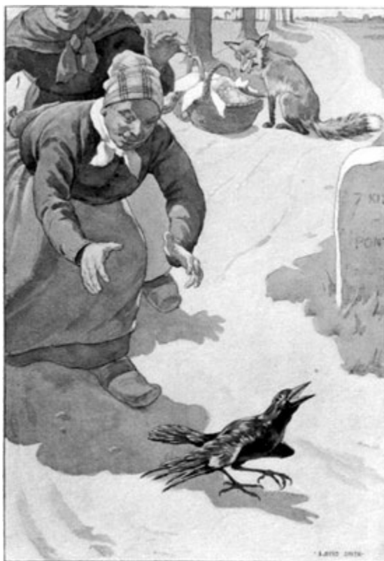
He managed to flutter out of reach

And, instead of going on to Verrieres, they turned about with their empty baskets and went back home, a sorry party, scolding and crying all the way. But long before they reached their homes and their angry husbands Madame Fox was comfortably snoozing her after-dinner nap under the hedge; while the happy Blackbird picked up juicy bugs in the neighboring meadow, with one eye cocked to guard against being surprised a second time by any bushy-tailed rogue.