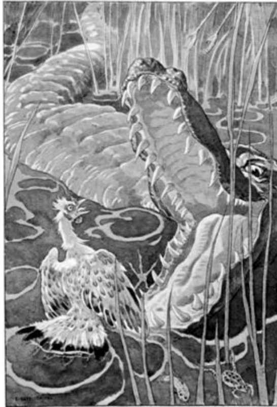
O Brother, don't!

"Oho!" snapped the Crocodile. "You shall not escape me this time. I am a log, am I? Look at me again, Mrs. Hen. Am I a log?" And he came at her to swallow her at once.