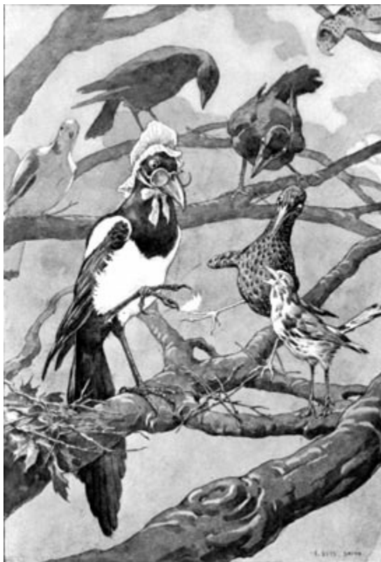
"Next you must lay a feather"

"Yes, yes," cried the Starling, "sticks and grass, every one knows how to do that! Of course, of course! Tell us something new."