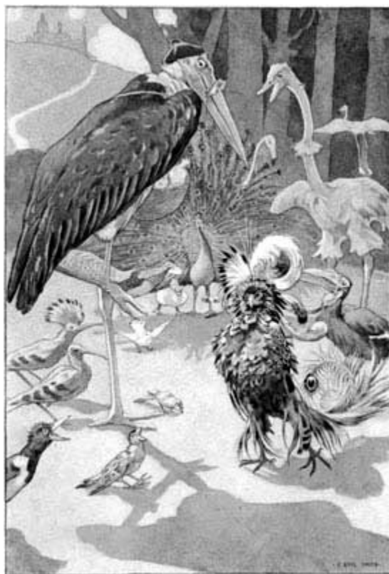
"Bless me!" he exclaimed, "whom have we here?"

"Bless me!" he exclaimed, "whom have we here? I thought I knew all Birdland, but I never before saw such a freak as this!"