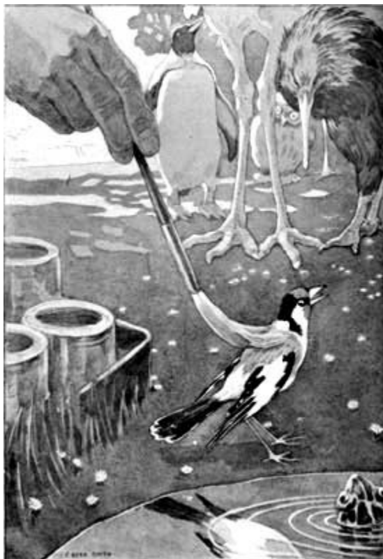
Such a gorgeous coat!

And so it happened. For to this day the Goldfinch is persecuted by human folk who admire his wonderful plumage and his beautiful song. He is kept captive in a cage, while his less gorgeous brothers fly freely in the beautiful world out of doors.