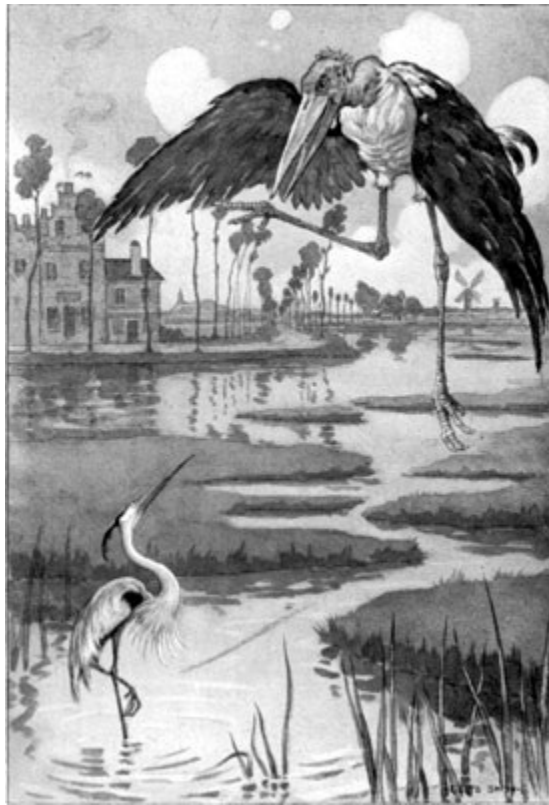
Mr. Stork and Miss Heron (page 178)