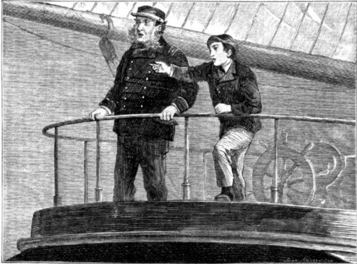
Captain Bounce cannot see the Town. Page 218 .

During the run of the Orion, from the time that Leopold assumed the charge of her till the anchor buried itself in the mud of the river, the owner and the passengers remained in the cabin. They were all city people, and to them the fog was even more disagreeable than a heavy rain. It was cold and penetrating, and the pleasure-seekers found it impossible to remain on deck. They were actually shivering with cold, and perhaps for the first time in their lives realized what a blessing the sunshine is. But Captain Bounce was on deck, and, standing on the fore-castle, he nervously watched the progress of the yacht. Doubtless he felt belittled at finding himself placed under the orders of a mere boy, even though the pilot was as polite as a French dancing-master.