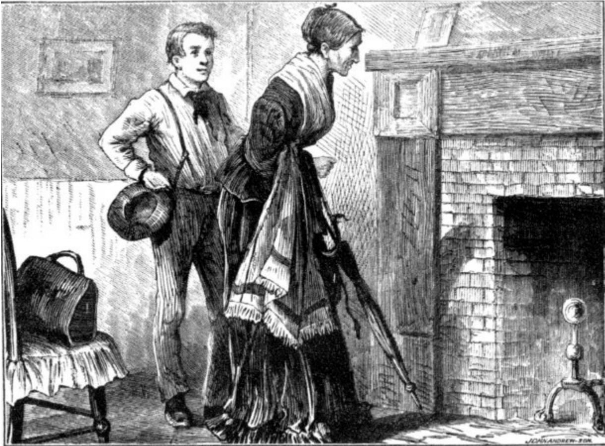
The Arrival of Miss Sarah Liverage. Page 121 .

"And this was Harvey's room," continued the woman glancing around the chamber, and then bestowing especial attention upon the fireplace.