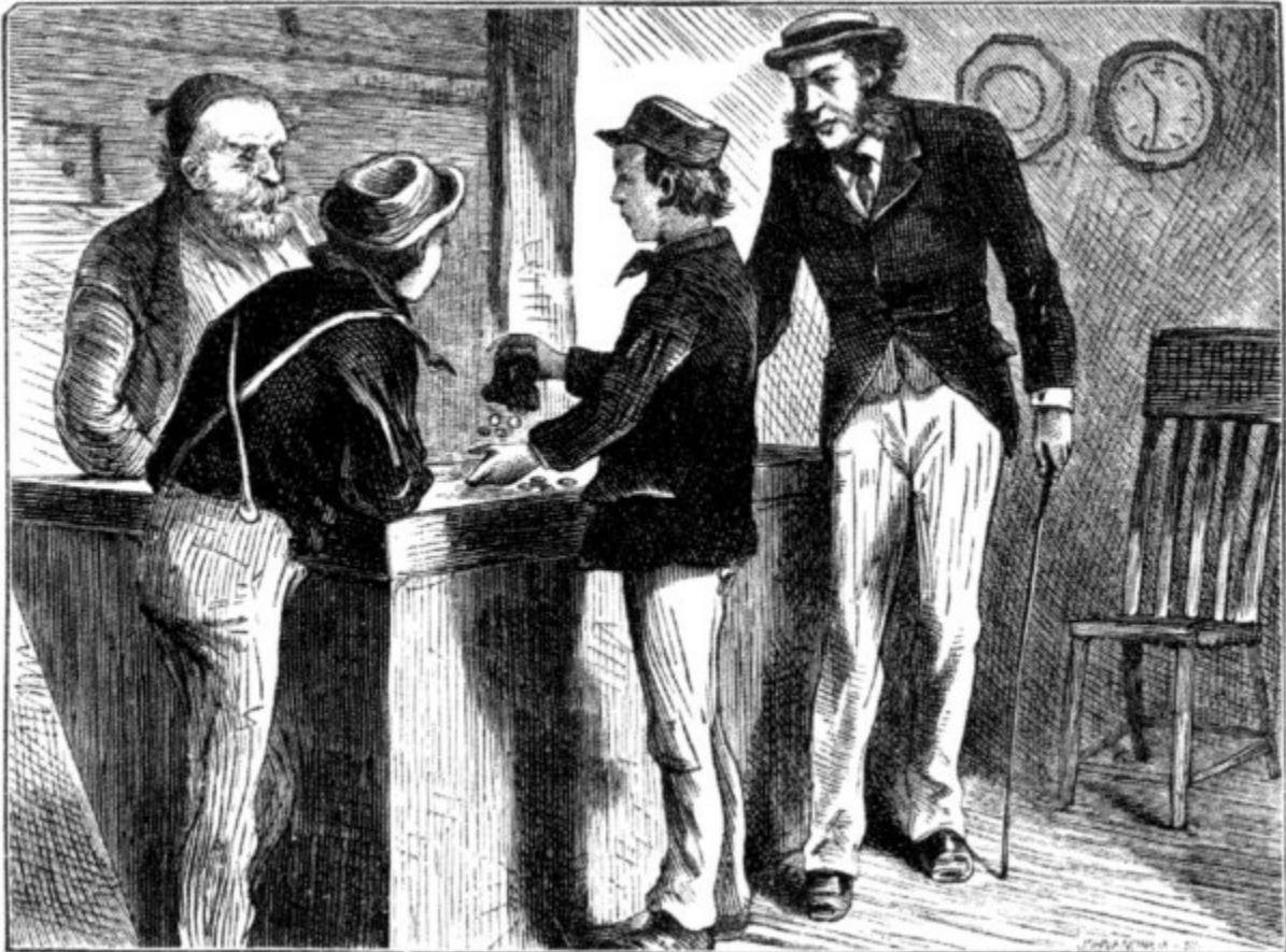
Stumpy pouring out the Gold. Page 302 .

"You bet!" added Stumpy. "I've been thinking all the time about getting my mother out of trouble, and only just now it comes into my head that Le's father is in hot water. I'll tell you what we'll do, Le: I'll give you five hundred--"