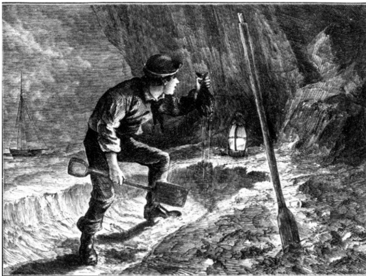
The Money Digger. Page 176.

The bag was just what Harvey Barth had described, and it weighed at least the four pounds and a half Avoirdupois which he had made it by his calculations. Leopold was tremendously excited, as he seated himself on the brink of the hole, with the shot-bag in his hand.