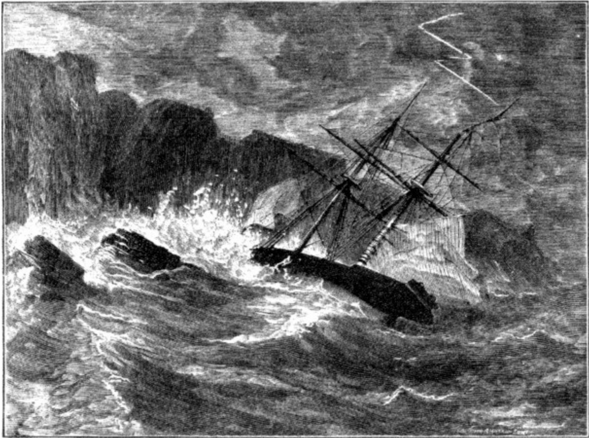
The Wreck of the Waldo. Page 28.

A flash of the electric fluid streamed along the mass of black clouds at this instant, and disclosed to him the situation of his companions. He was shocked by the sight, and even his strong frame was shaken by the fearful scene which for an instant only was visible to him. He recognized the captain, but he seemed to be dead. Next to him was the passenger, who was getting upon his feet again, apparently not much injured by the bolt. Not another of the six men who lay on the quarter-deck moved, or exhibited any signs of life. The mate,—in whose mind the situation of each of his unfortunate shipmates was fixed in such a way that he could not have forgotten the scene if he had lived to be a hundred years old,—went to each man, but could discover no indications of vitality in them. He was thinking of saving his own life, but it was awful, and terribly repulsive to his sense of humanity to consider the idea of abandoning the vessel while these men, who might be only stunned by the shock lay on her deck.