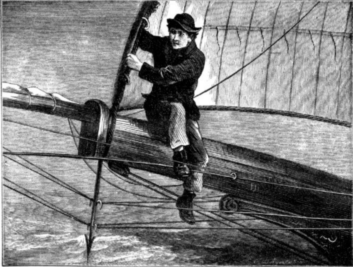
Leopold on the Lookout. Page 213 .