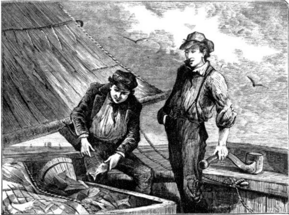
The big Catch of Mackerel. Page 85.

"The house and land are worth just what I say; or, at least, they were a year ago, though the war has knocked things higher than a kite just now. Nobody except my loving grandpa has got the ready cash to pay down; and mother thinks the place wouldn't fetch much, if anything, over the mortgage. But in time it will be worth two thousand dollars."