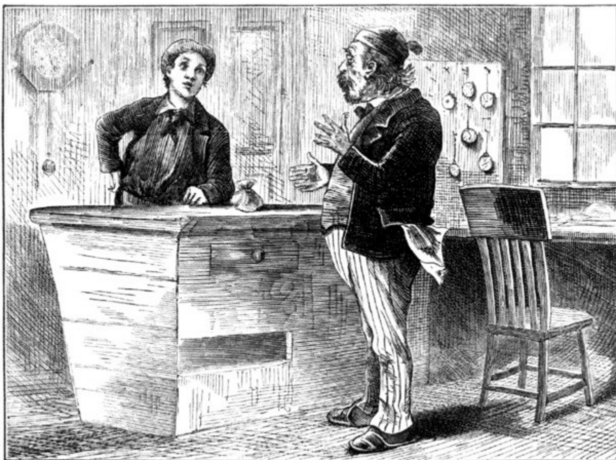
"Donner und Blitz." Page 273 .

As soon as Leopold had landed his passengers, and securely moored the sloop, he hastened, before going to the hotel, to the shop of his uncle. Without any explanation, he dropped upon the watch-maker's counter the shot-bag, in which the gold chinked as it fell, to the intense astonishment of Herr Schlager.