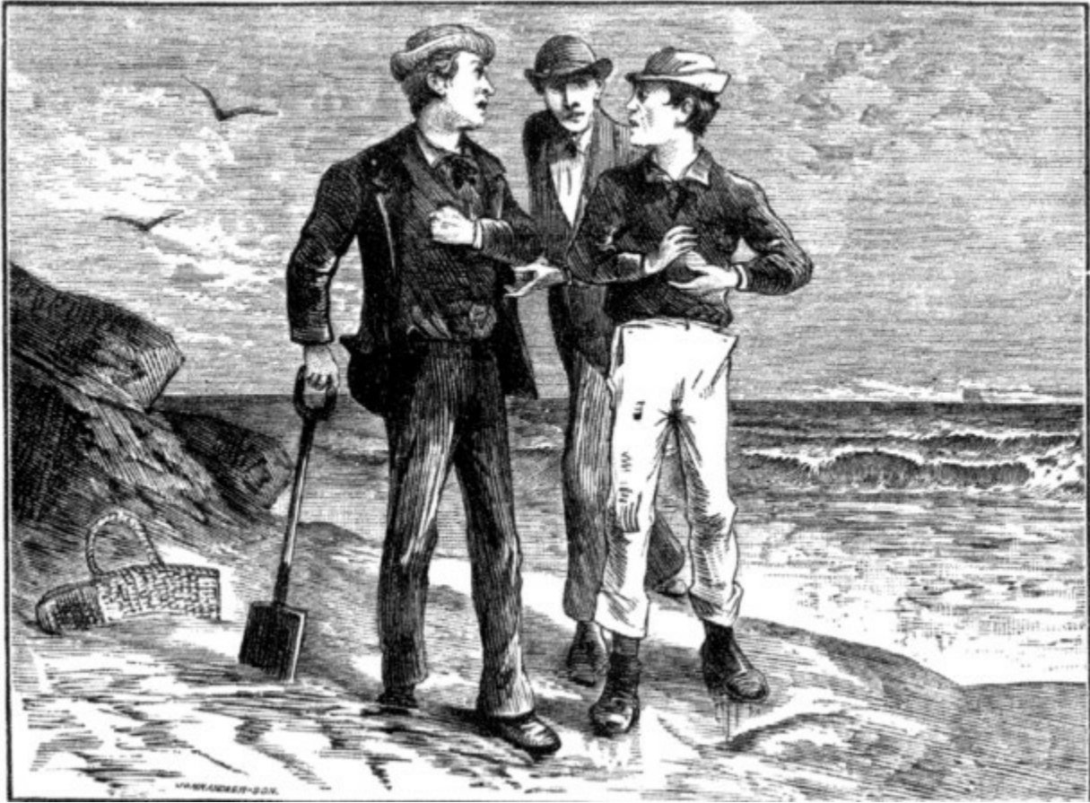
Stumpy with the Bag of Gold. Page 253 .

"My throat was as parched as though I had spent a month in the Desert of What-you-call-it, you see," continued Mr. Redmond. "I desired very much to come down to the boat and obtain a draught of cold water. I didn't expect to obtain a draft on a gold bank then--ha, ha! you see? Not bad--eh? Even a gentleman can't help making a pun sometimes, you see."