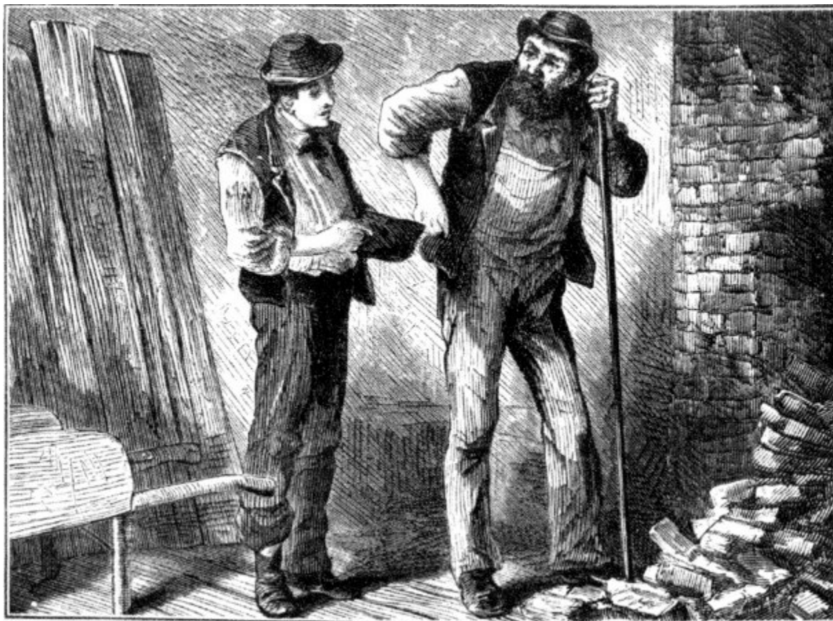
Leopold makes a Discovery. Page 149 .

He desired very much to speak to his father about the diary; but he did not feel at liberty to do so. It did not appear that the mason with whom Leopold was at work had told Mr. Bennington, or any person, of the finding of the package. After his questions had been answered, he seemed to feel no further interest in the diary, and probably forgot all about it before he went home to dinner. The discovery of it did not seem to him to be a matter of any importance, and Leopold kept his information all to himself.