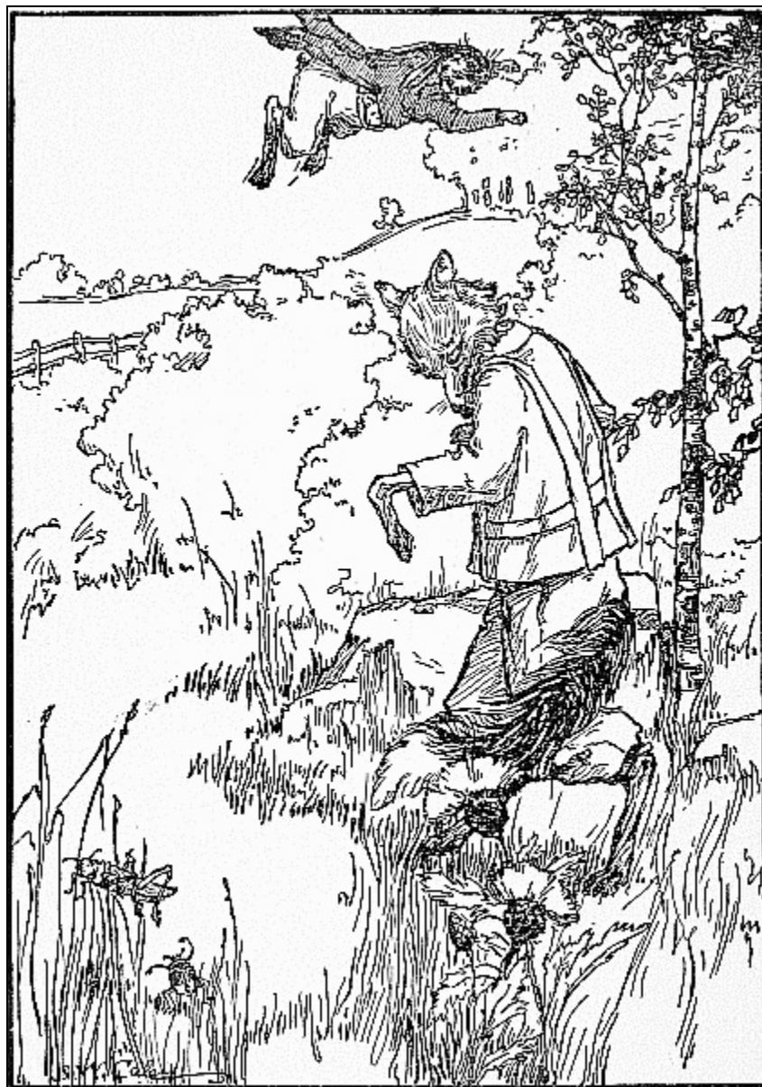
STRAIGHT IN THE AIR

"Before I'd much more than struck my gait I knew I could give him the slip whenever I wanted to, and it seemed as if it would do the foolish fellow a world of good to teach him a lesson that he wouldn't forget right away, so I set about doing it to the Queen's taste. First I took a turn over by the pond, where the ground was so wet in spots that he'd sink in two or three inches at every leap, while, by skimming along the edge, I was tiring him out, which was what I didn't want to do till he'd got it considerably harder than he had up to that time.