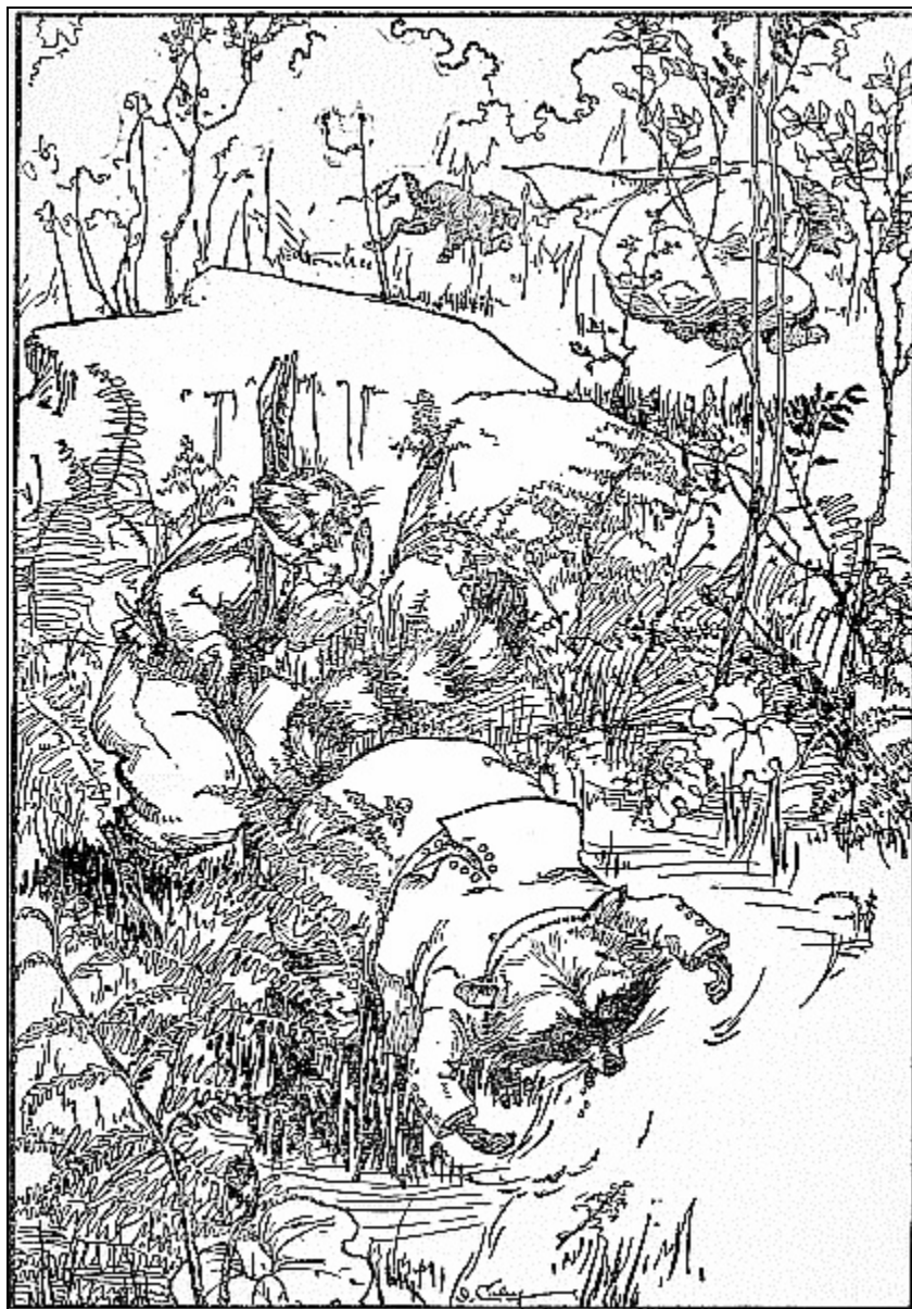
"LET ME AT 'EM"

"If you could have seen Bobby Coon capering around after the Senator and Mr. Towser ran away from each other you'd thought he had done the whole trick. He threw out his chest as if he were the biggest thing in the woods, and began telling about what the Coon family had done in days past, till I got provoked and said right sharply: