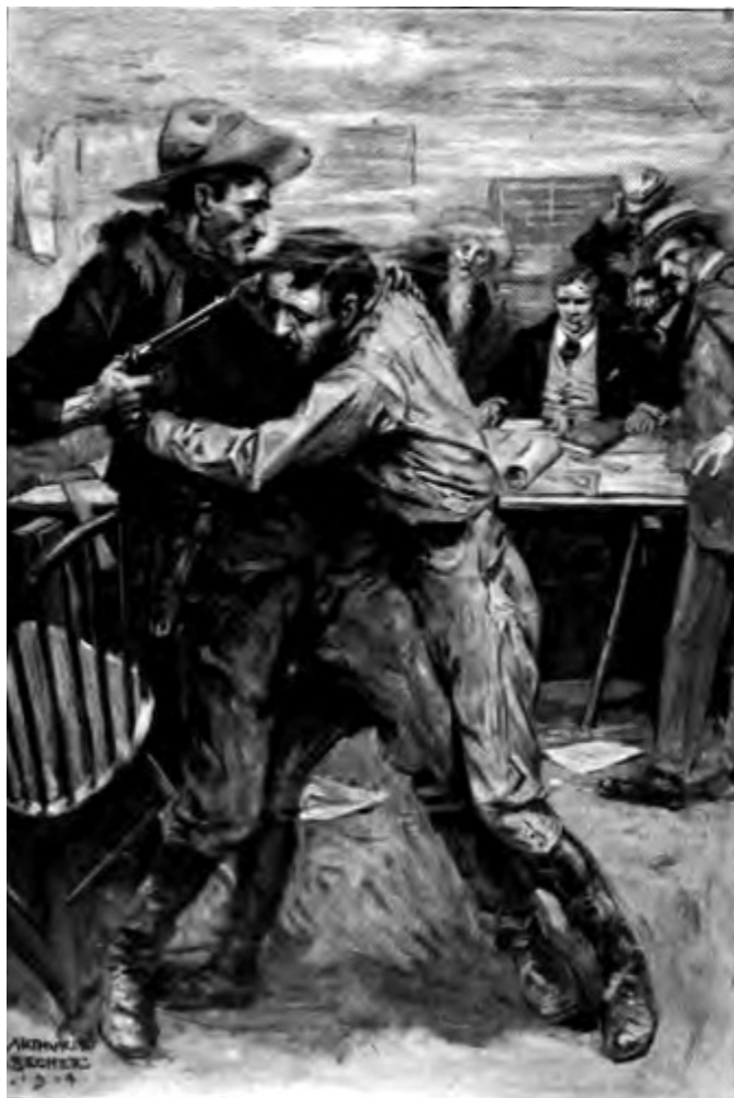
Brouillard got between.

"You are Amyand this is that other world you used to talk about, isn't it?" he asked feebly.