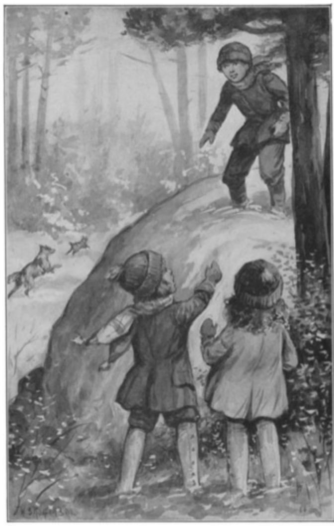
"OH, BERT!" CRIED FREDDIE, "WE'RE LOST!"

"Oh! A wildcat!" cried Bert, as, a moment later, there sprang out at him the same animal, or one very like it, that he had snowballed a little while before. Probably it was another lynx, but Bert did not stop to think of this.