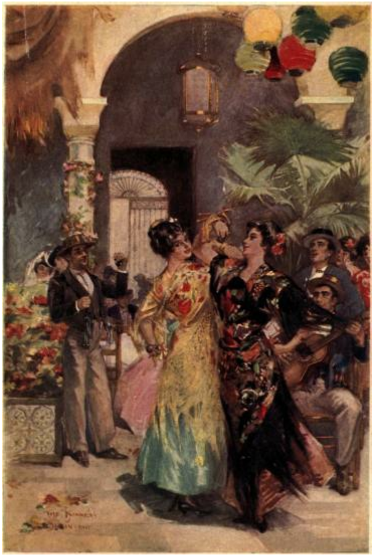
Gallardo's wedding was a national event. Far into the night guitars strummed with melancholy plaint.... Girls, their arms held high, beat the marble floor with their little feet

Alms were given at the door of the house during the day. The poor came even from the distant towns, attracted by the fame of this gorgeous wedding.