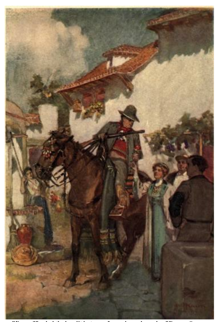
"For me?" asked the bandit in tones of surprise and wonder. "For me, Senora Marquesa?"

The men of La Rinconada assented dumbly. They already knew it. They must keep quiet about the visit to avoid trouble, as was done in all the plantations and herders' ranches. This general silence was the bandit's most powerful aid. Moreover, all these countrymen were Plumitas' admirers. In their rude enthusiasm they looked upon him as an avenging hero. They had nothing to fear from him. His threats only weighed against the rich.