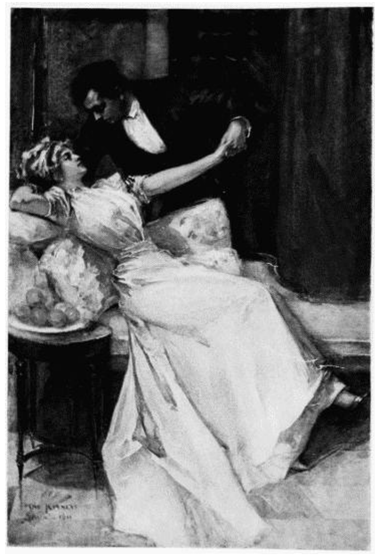
When the swordsman clasped her hand she looked into his eyes. "Don't go-come; come!" [Chapter III]