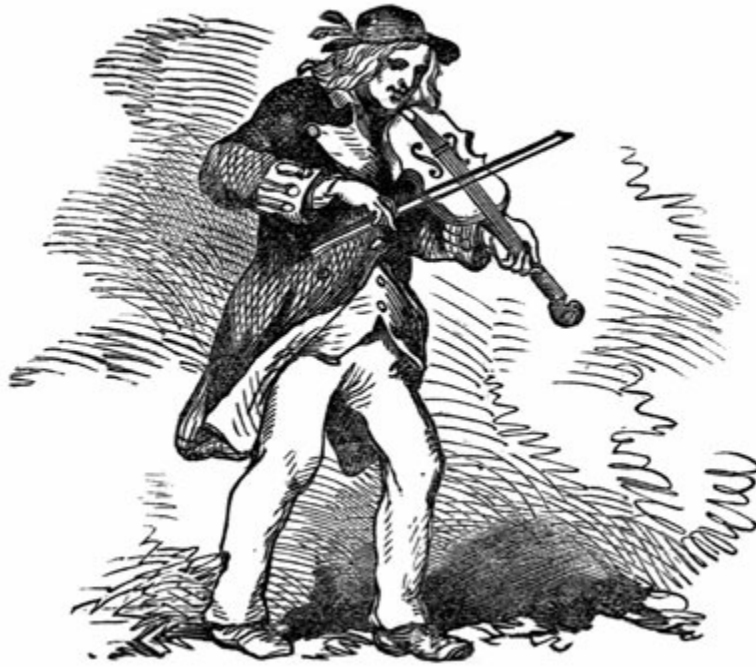
The Old Fiddler.