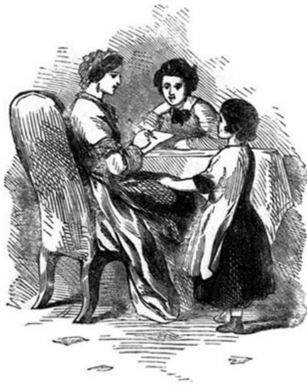
Writing the Notes.