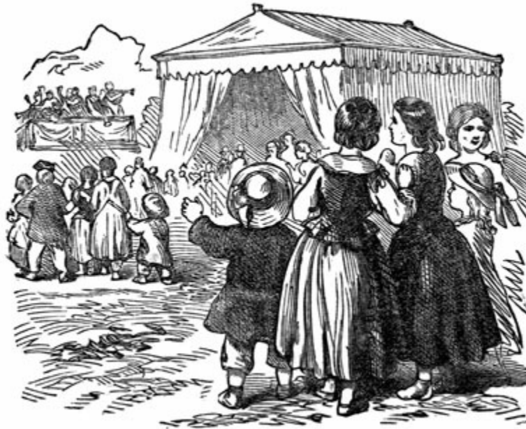
On the Lawn.