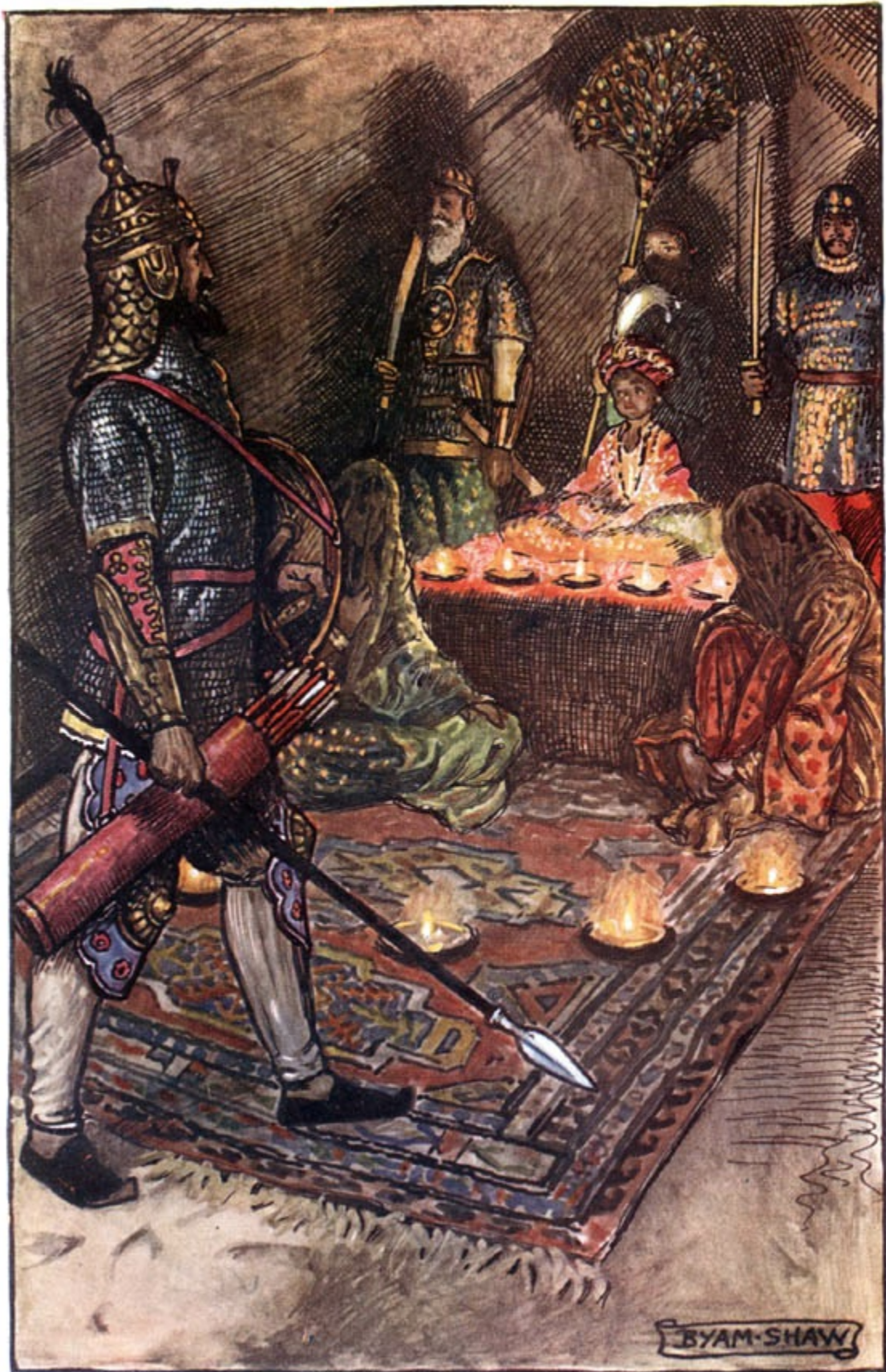
Prince Askurry ... strode ... into the tent.

It was really rather a pretty picture which he saw. To begin with the tent had been lit up with the little rushlight lamps