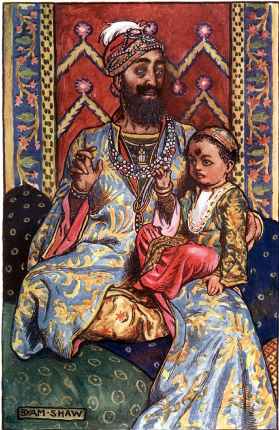
The child had slipped it onto his little forefinger.

A dignified, gracious-looking image with forefinger held up in the attitude of kingly command; and on that forefinger--